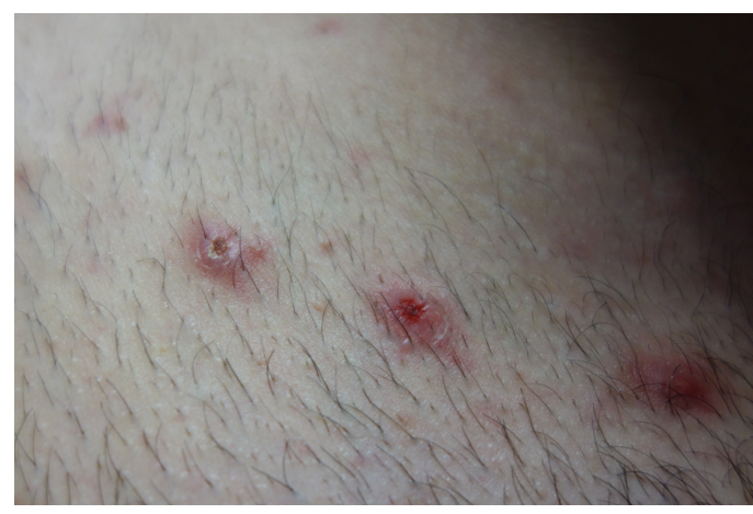
Figure 2 | Papules with central erosion.