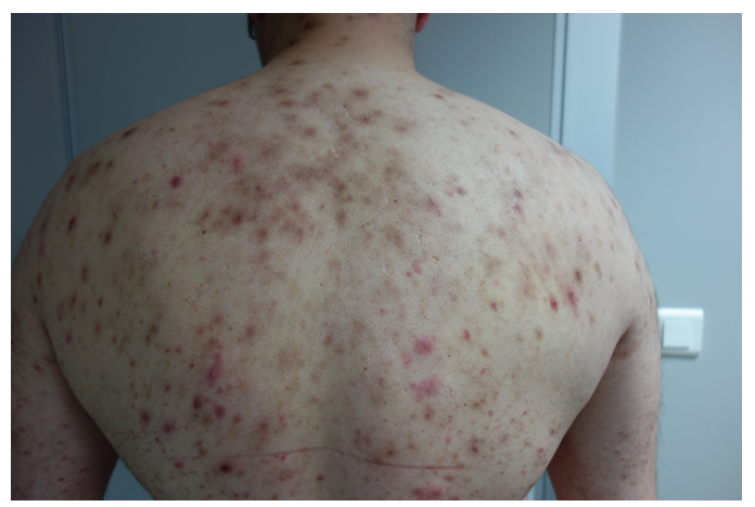
Figure 4 | Partial resolution of the lesions after 1 week of treatment.