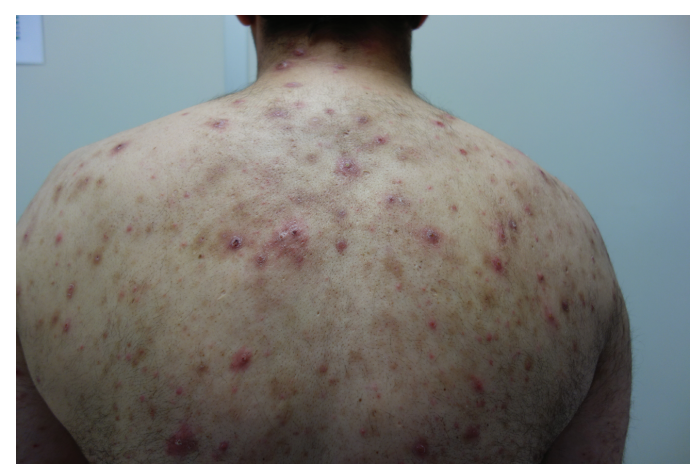
Figure 1 | Well-delimited, violaceous papules with central erosion on the back.

to disappear after 2 weeks of treatment (Fig. 4). NEH recurred with less intensity after the third cycle of chemotherapy. After a multi-disciplinary consult with the oncology team, the patient chose to continue treatment with FOLFOX and to use topical corticosteroids if the lesions reappeared. During the subsequent cycles of chemotherapy and through 2 years of follow up the lesions did not recur.