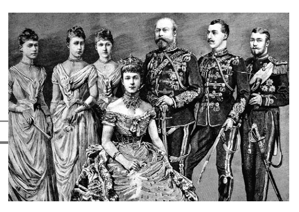
The family of the Prince of Wales: Engraving by Shyubler. Published in the magazine Niva , published by A.F. Marx, St. Petersburg, Russia, 1888

Royalty devalues the average citizen. A monarchy flies in the face of the idea that "all men are created equal." If royalty were eliminated, any loss of tradition would be more than replaced by a thirst for innovation, improvement, and individuality.