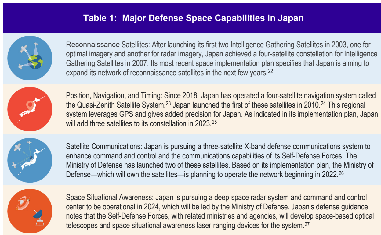
Table 1 lists the major defense space capabilities in Japan, and Figure 1 lists the key governmental space players.

overarching security posture, and noted that, while Japan had been extremely limited in the use of outer space for national security purposes, other countries had developed and deployed a variety of national security-related satellites designed to gather data and detect ballistic missile launches. 18,19 The document goes on to say that given the change in domestic law, Japan would move ahead with a number of research and development projects focused on increasing its capability to improve national security information gathering and enhance “warning and surveillance activities in light of the international situation, especially the circumstances in North East Asia.” 20 This included investments in reconnaissance satellites, secure satellite communications, and a positioning, navigation, and timing satellite system. 21