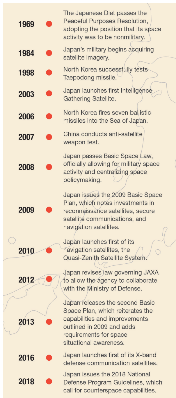
Figure 2: Important events in Japan's shift toward military space.

developing reconnaissance satellites signaled yet another significant step in the country's shift toward military space. 50