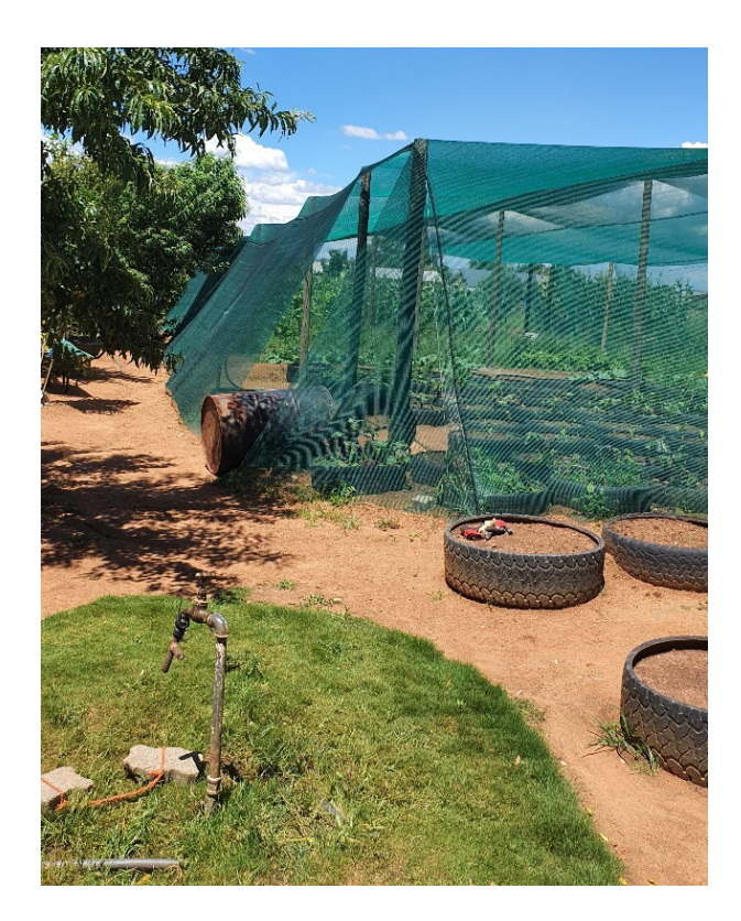
3. Vegetables under shade cloth, Tumahole, Parys, Free