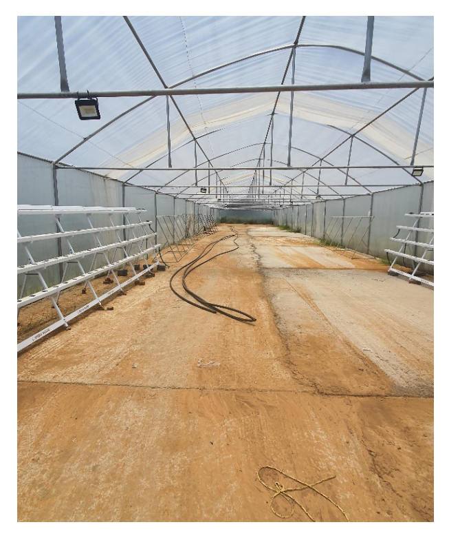
2. Inside the incomplete tunnel erected for the project, Tumahole, Parys, Free State