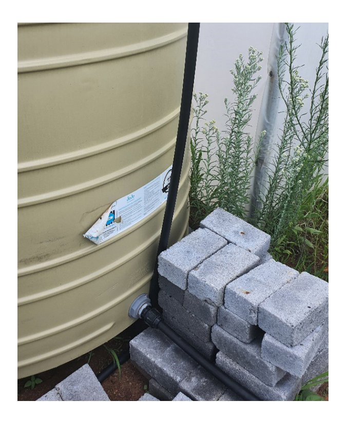
1. Water supply system funded by UN Women Climate Smart Agriculture (CSA) Project, Tumahole, Parys, Free State