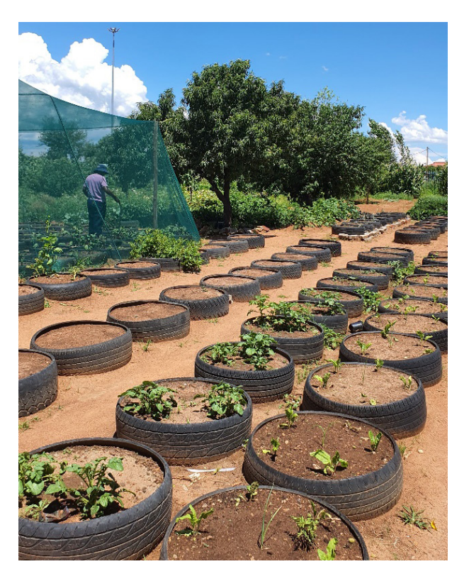
3.Vegetables grown in tyres, Tumahole, Parys, Free State