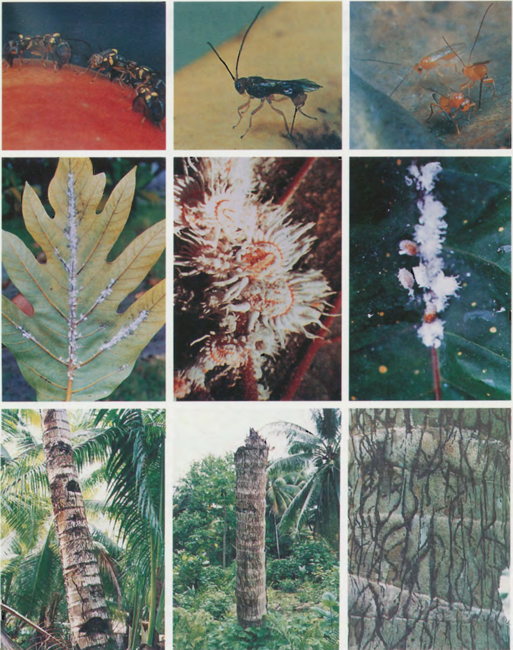
Plate 1 Top line: 1. Bactrocera tryoni ovipositing in an apple. 2. Fopius arisanus probing a banana for tephritid eggs. 3. Diachasmimorpha longicaudata probing for tephritid larvae. Middle line: 4. Icerya aegyptiaca on a breadfruit leaf (D.P.A. Sands). 5. Adult I. aegyptiaca with wax filaments displaced by blowing lightly (G.S. Sandhu). 6. Larvae of Rodolia attacking I. aegyptiaca (D.P.A. Sands). Bottom line: 7. Coconut palm with bark channels of Neotermes rainbowi (M. Lenz). 8. Coconut palm stump following loss of top (M. Lenz). 9. Bark channels characteristic of N. rainbowi (M. Lenz).