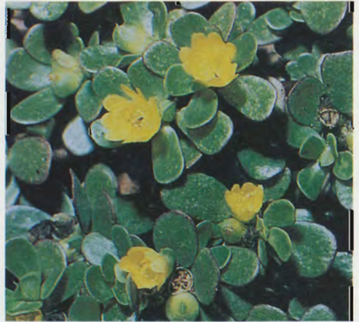
Plate 2 Top line: 1. Thicket of Clerodendrum chinense in Western Samoa. 2. Roadside thicket of C. chinense in Fiji (D.P.A. Sands). Middle line: 3. Flower head of C. chinense (D.P.A. Sands). 4. Phyllocharis undulata and damage to Clerodendrum leaf (B. Napompeth). Bottom line: 5. Young prostrate plant of Portulaca oleracea (J.T. Swarbrick). 6. P. oleracea in flower (W.A. Whistler).