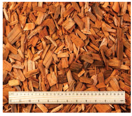
Colored wood chips mulch (GOLD)