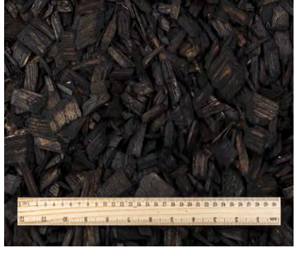
Colored wood chips mulch (BLACK)