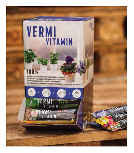
VermiVitamin BOX (100 pieces)

Processed organic fertilizer - (biohumus, slug compost) is the final product obtained after specially prepared compost from cattle manure was processed (enriched) by the slugs of the population of "Staratel". This concentrated and enriched fertilizer contains a whole complex of necessary nutrients and microelements, as well as enzymes, soil antibiotics, vitamins, plant growth and development hormones. The application of this fertilizer improves agrochemical properties and quality of agricultural products and increases yield. Packages: 5 liters, 10 liters.