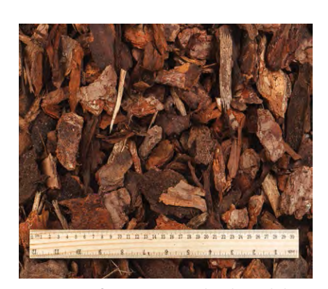
Coarse fraction pine bark mulch Playground