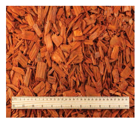
Colored wood chips mulch (ORANGE)