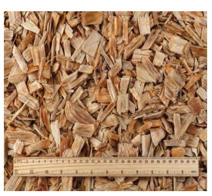
Colored wood chips mulch (UNDYED/NATURAL)