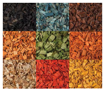
Colored wood chips mulch Playground