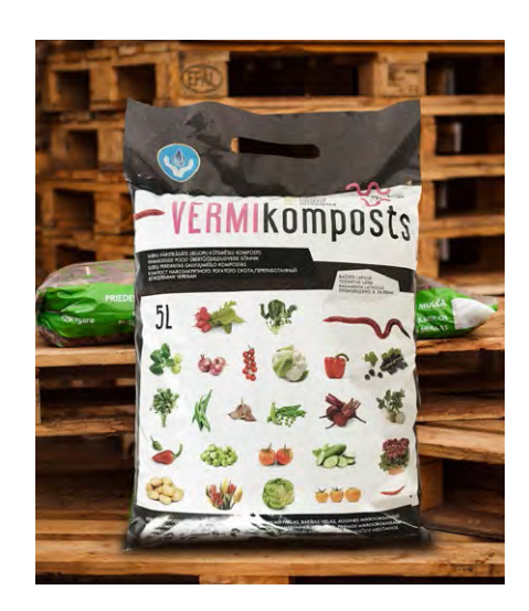
Vermikomposts - organic fertilizer

Processed organic fertilizer - (biohumus, slug compost) is the final product obtained after specially prepared compost from cattle manure was processed (enriched) by the slugs of the population of "Staratel". This concentrated and enriched fertilizer contains a whole complex of necessary nutrients and microelements, as well as enzymes, soil antibiotics, vitamins, plant growth and development hormones. The application of this fertilizer improves agrochemical properties and quality of agricultural products and increases yield. Packages: 5 liters, 10 liters.