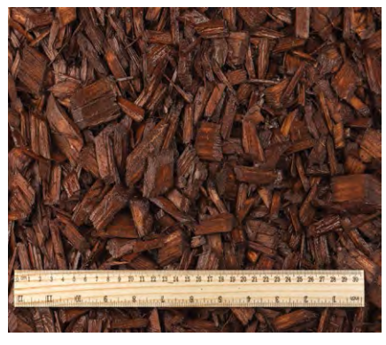
Colored wood chips mulch (BROWN)