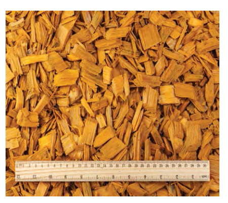
Colored wood chips mulch (YELLOW)