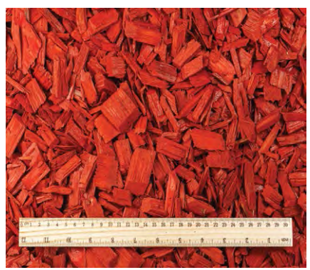
Colored wood chips mulch (RED)