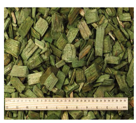
Colored wood chips mulch (GREEN)