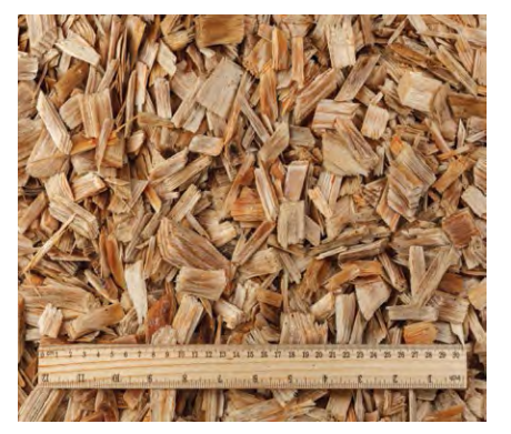
Natural wood chip mulch Playground (UNDYED/NATURAL)