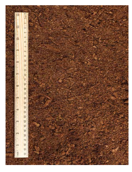
Peat PH (2,5-3,5)

Aggregare peat is used as a soil substrate. Natural white peat can be used as raw material for soil substrates, for soil improvement, and in some cases as soil material for plants. This material is widely used for professional purposes.