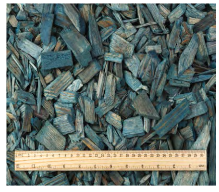
Colored wood chips mulch (BLUE)