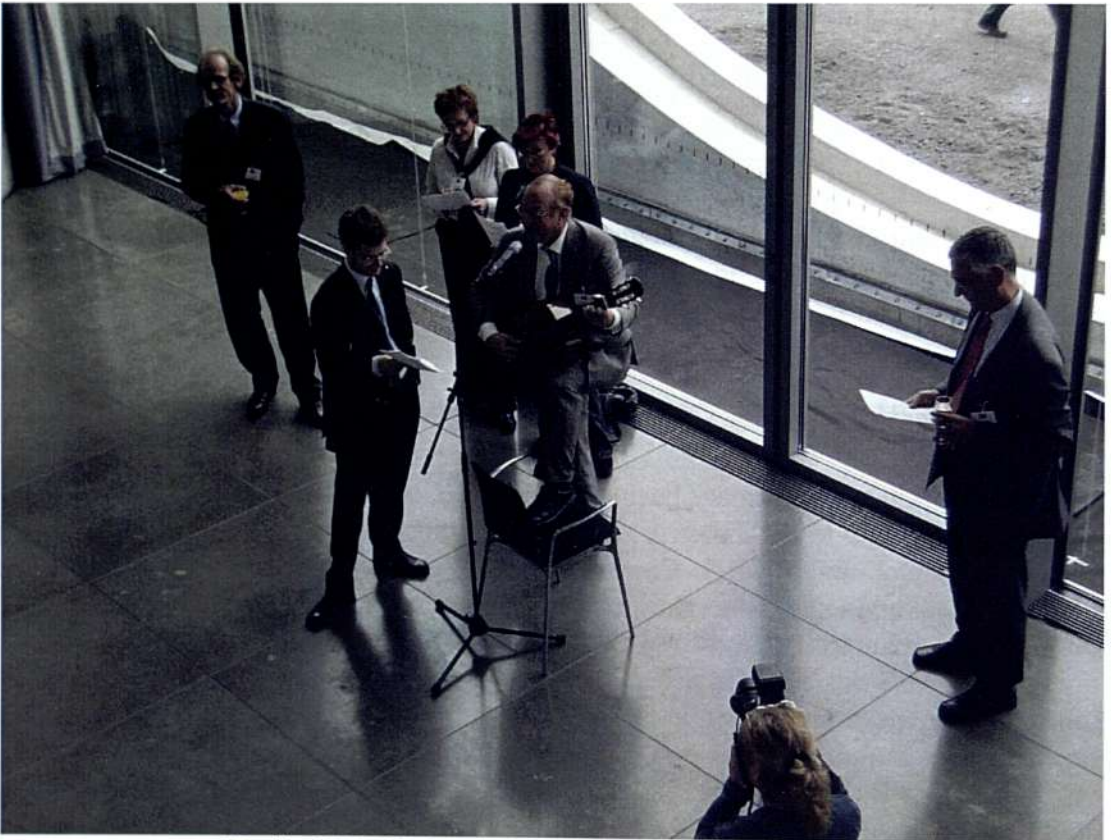
(Berlin, 14-15 October 2004 - Conference of Correspondents) "Tribute to Maître D" (Song also available on website - go to Reports Berlin 2004)