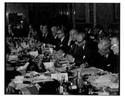
(Vienna, 10 and 11 June 1977 - Speakers' Conference)

Furthermore, it resulted clearly from the outcome of the seminar of experts held on 3 and 4 February 1977 that the officials of the national parliaments were strongly in favour of co-operation within a Centre. They had been waiting a long time for the establishment of a coordinated means of contact with the services of the other parliaments, capable of stepping up the flow of information without a corresponding increase in paper work or administrative cost. The experts also considered that a coordination of parliamentary efforts to cope with technological progress would be appropriate.