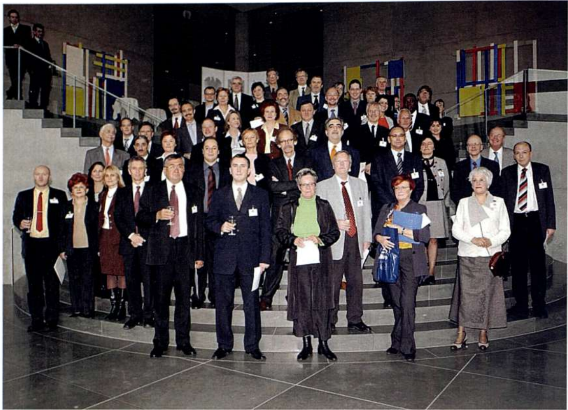
(Berlin, 14-15 October 2004 - Conference of Correspondents)