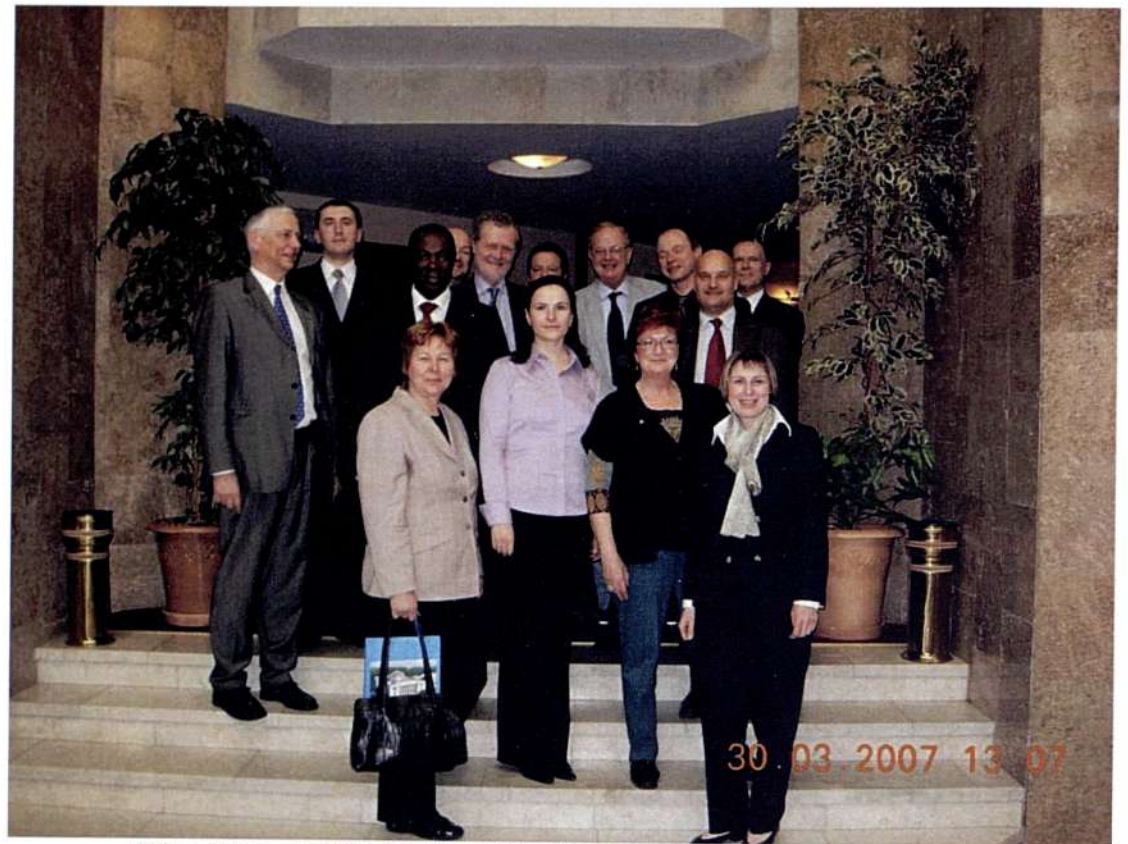
(Kiev, 30 March 2007: Meeting of the Executive Committee and Co-ordinators)

On a proposal from the Executive Committee and to meet specific terms, the Conference of Correspondents may set up ad hoc working groups composed of staff of member chambers for a duration which must not exceed three years.