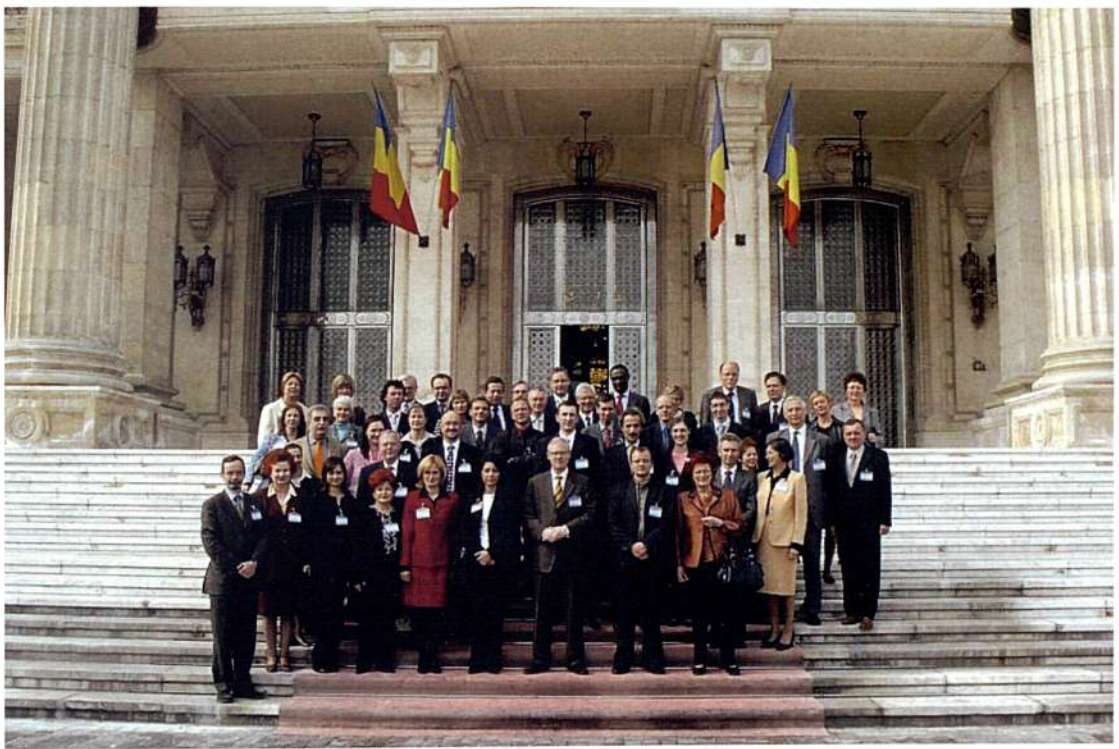
(Bucharest, 14 October 2005 - Conference of Correspondents)

Between 2004 and 2006 fewer seminars were organised namely 10. This was mainly due to a fewer number of proposals from national parliaments and because of organisational changes in the ECPRD.