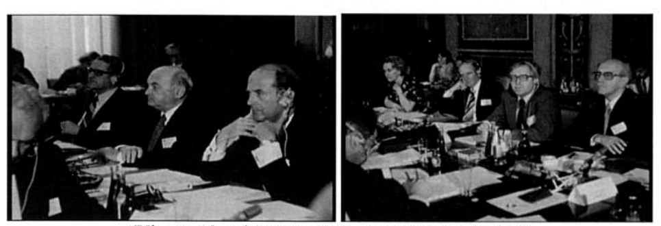
(Vienna, 10 and 11 June 1977 - Speakers' Conference)