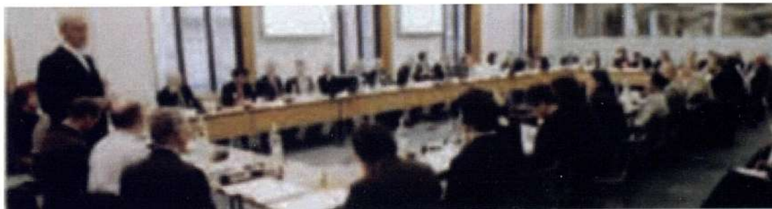
Annual Conference of Correspondents, London (14 October 2006)

For each area of ECPRD activities followed by coordinators, lists of subjects coming under these areas have been established. It will be important for the ECPRD soon to give to coordinators the ability to have their own section in the website where they may add information directly.