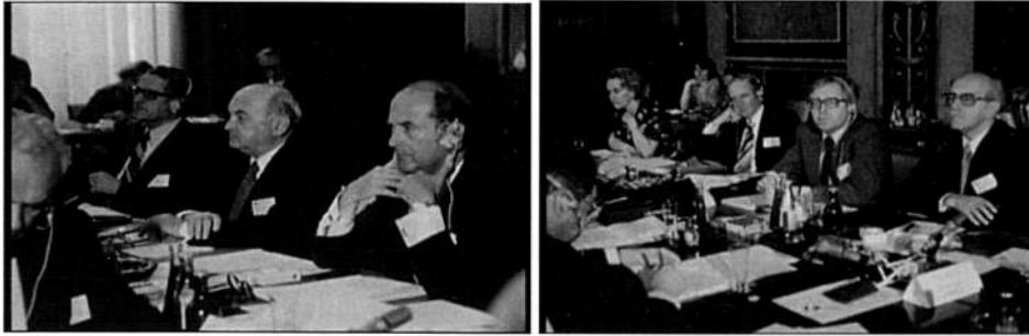
(Vienna, 10 and 11 June 1977 - Speakers' Conference)