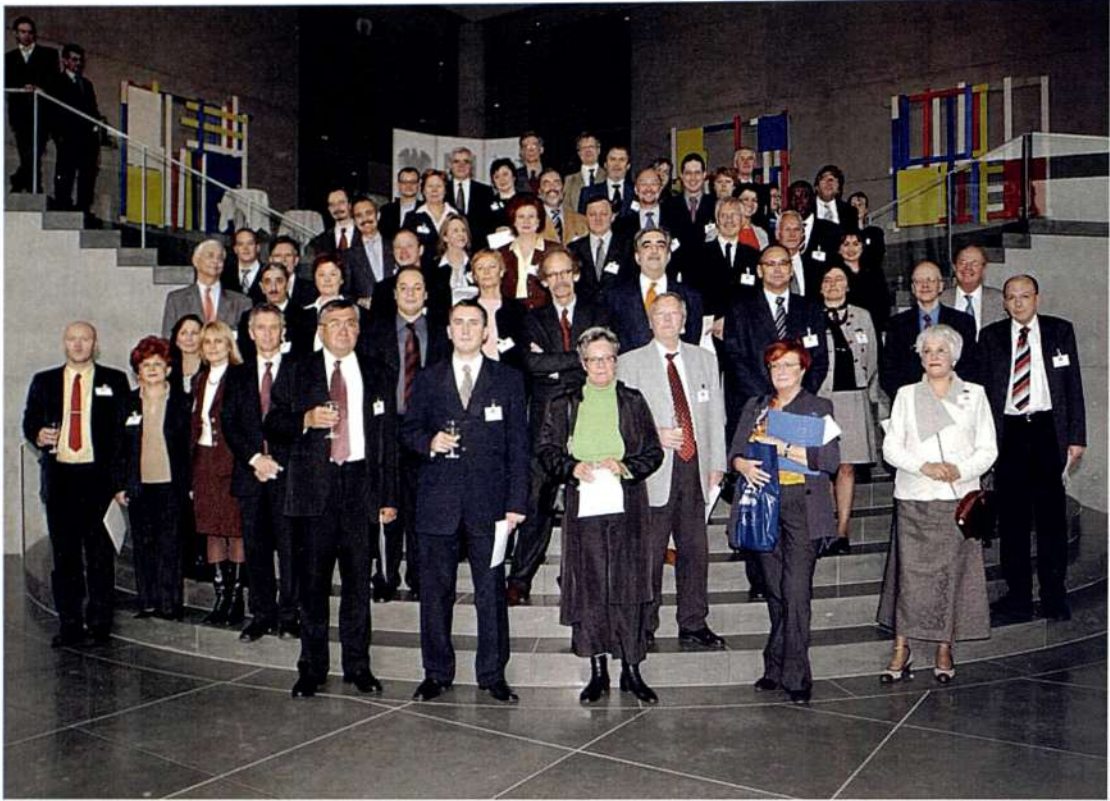
(Berlin, 14-15 October 2004 - Conference of Correspondents)