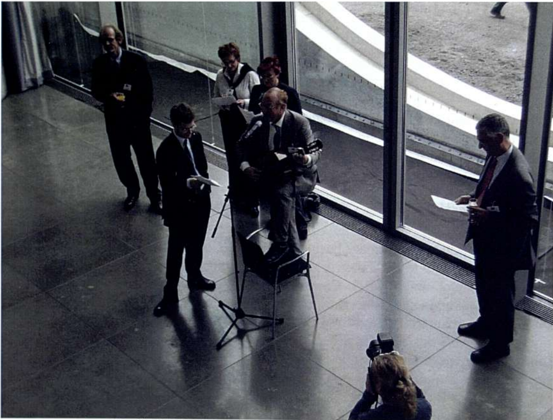
(Berlin, 14-15 October 2004 - Conference of Correspondents) "Tribute to Maître D" (Song also available on website - go to Reports Berlin 2004)