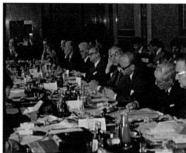
(Vienna, 10 and 11 June 1977 - Speakers' Conference)

Furthermore, it resulted clearly from the outcome of the seminar of experts held on 3 and 4 February 1977 that the officials of the national parliaments were strongly in favour of co-operation within a Centre. They had been waiting a long time for the establishment of a coordinated means of contact with the services of the other parliaments, capable of stepping up the flow of information without a corresponding increase in paper work or administrative cost. The experts also considered that a coordination of parliamentary efforts to cope with technological progress would be appropriate.