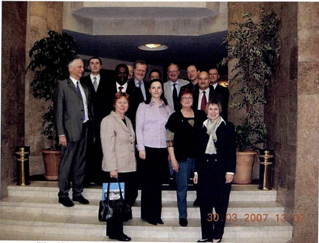
(Kiev, 30 March 2007: Meeting of the Executive Committee and Co-ordinators)

On a proposal from the Executive Committee and to meet specific terms, the Conference of Correspondents may set up ad hoc working groups composed of staff of member chambers for a duration which must not exceed three years.