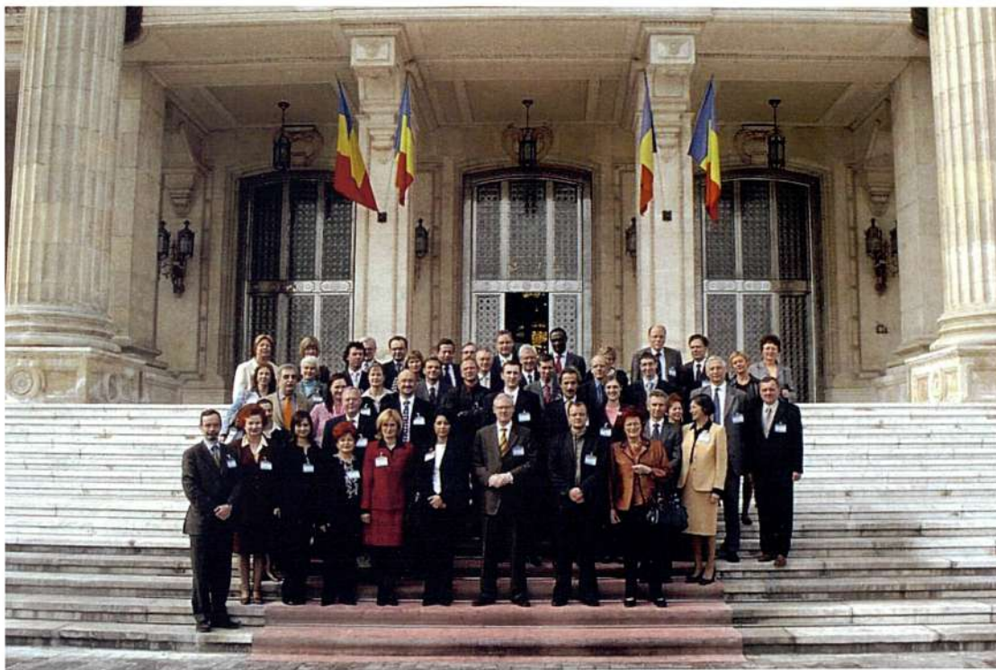
(Bucharest, 14 October 2005 - Conference of Correspondents)

Between 2004 and 2006 fewer seminars were organised namely 10. This was mainly due to a fewer number of proposals from national parliaments and because of organisational changes in the ECPRD.