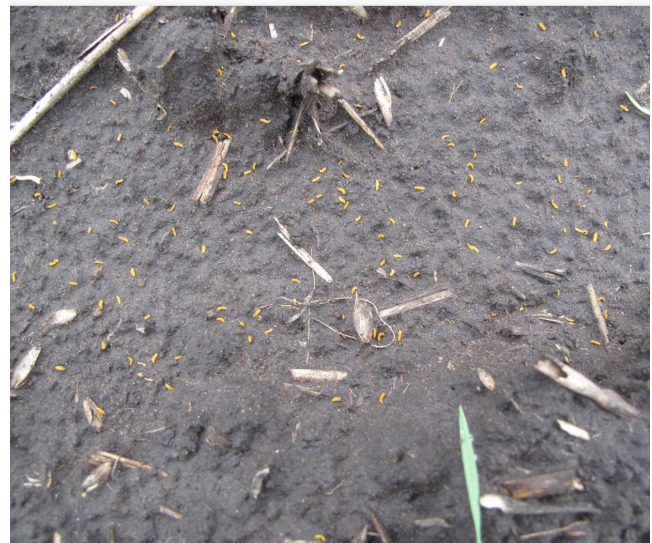
FIGURE 4. Midge larvae on soil surface.

Larvae can often be found on the soil surface during the last week of May if soil moisture is adequate (Figure 4). If soil conditions are dry, the