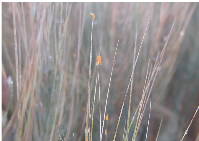
FIGURE 5. Larvae drop from wheat heads after rain or heavy dew.

The female lays eggs either singly or in groups of three to five on individual florets of the wheat spike. Although the females only live for about seven days, they will lay an average of 80 eggs. The eggs hatch in about four to seven days, depending on environmental conditions.