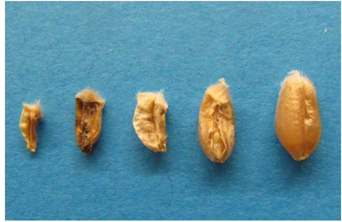
FIGURE 3. Midge-damaged wheat kernels.

The most obvious impact of this pest is a reduction in yield. However, more subtle effects also occur. Small, shriveled seed and low test weights are common occurrences and are often mistaken for the effects of frost damage or drought stress. Damage to the seed coat allows easier water entry, often resulting in sprout damage and low falling numbers.