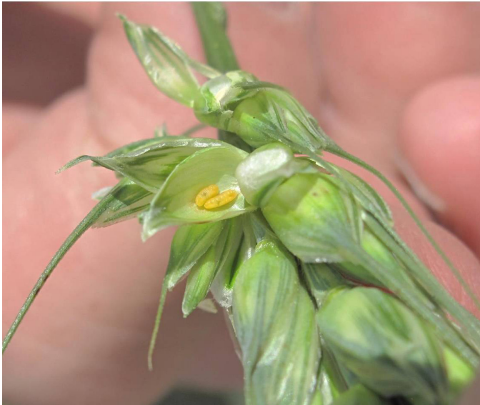
FIGURE 2. Midge larvae feeding on wheat kernel.

Damage to the crop is not readily apparent since the insect feeds inside the wheat head. Damage can only be detected by threshing the heads and by inspecting the kernels. Upon inspection, orange-colored larvae can be found feeding on the developing seed (Figure 2). The larvae feed by exuding enzymes which break down cell walls and convert starch to sugar. Each larva is capable of reducing grain size by 30-50 percent, and it's not uncommon to find several larvae feeding on a single kernel.