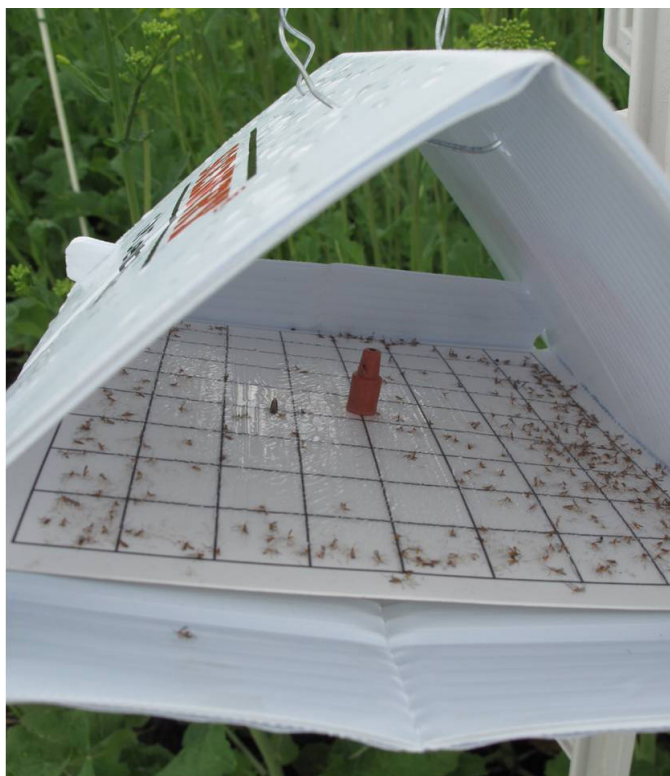
FIGURE 6. Midge adults in pheromone trap.

Wheat is most susceptible to midge damage when egg-laying occurs from early heading through pollination (Figure 7). As such, fields should be