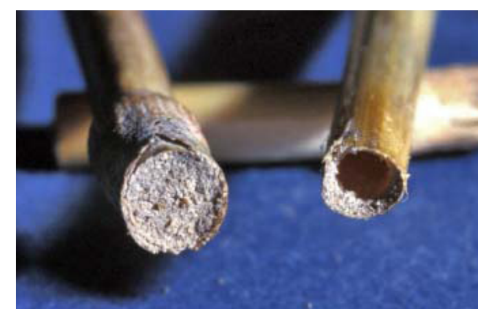
FIGURE 5. Wheat stems where the wheat stem sawfly has not emerged (left) and emerged (right). (Robert Peterson)