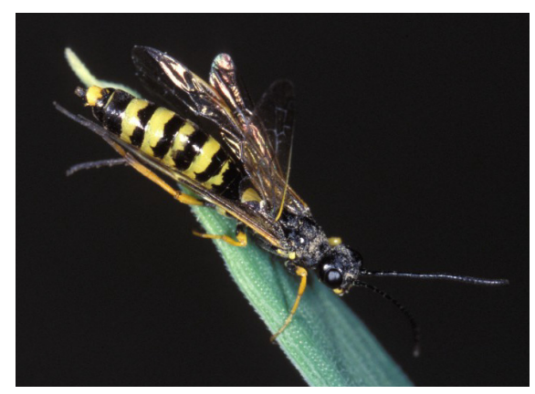
FIGURE 1. Adult female wheat stem sawfly. (Robert Peterson)

grasses. It was first reported and described from a sample collected in Colorado in 1872, and was found in Montana in 1890. Its first record in Canada was in 1895 in Manitoba. It has been suggested that the wheat stem sawfly was recently introduced to North America from northeastern Asia. However, early records indicate that wheat stem sawfly occurred in large stem native prairie grasses such as western wheat grass and basin wildrye as