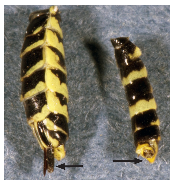
FIGURE 7. A close-up, comparing female (left) and male (right) reproductive structures, noting the ovipositor on the female and the typically retracted reproductive structures of the male. (Robert Peterson)