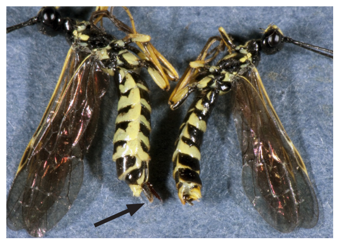
FIGURE 6. Abdomen comparison of female sawfly (left) and male sawfly (right), noting size differences between the sexes and ovipositor present on the female.

Varieties of wheat that are tall and remain green longer are preferred. This does not indicate, however, that the insect will not attack other varieties nearby. The wheat stem sawfly continues to be a major pest in the state of Montana, as it has for more than one hundred years. Future Montguides will detail control measures which will help assist growers in managing damage more successfully. These measures include the use of natural enemies, trap crops, cultural control measures – including forage production – as well as continuing research regarding host plant resistance.