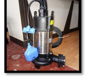
Sewage mud pump

Turning chain system: Manure which is pushed by the manure scrapper is collected in manure pit that is transported to manure storage area by use of turning chain system. The turning chain can travel at about 16.5 feet/min by a motor of 380V.