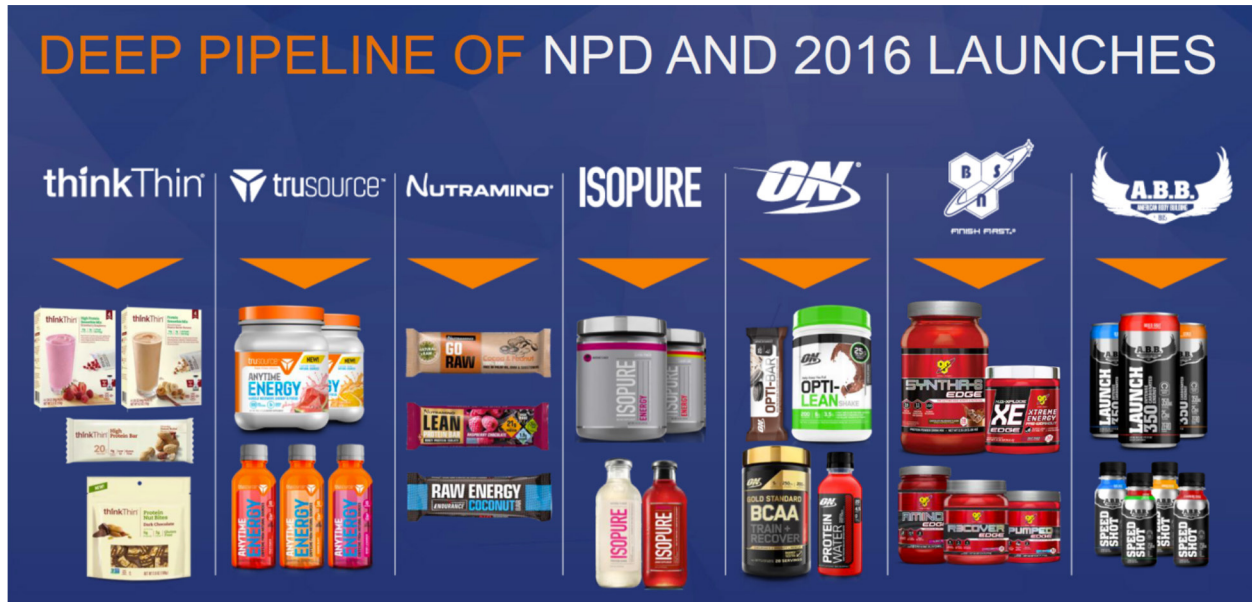
Figure 1: GPN new product pipeline and launches, 2016.

portfolio. (See Figure 1 for the GPN innovation pipeline in 2016.) The brand also appeared to have successfully navigated the transition to online selling; Optimum Nutrition was the second biggest selling CPG brand online in the U.S. in 2015. (See Figure 2 for a ranking of biggest selling CPG brands online in 2015.)