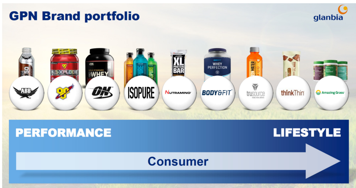
Figure 3. GPN brand portfolio, 2017.

GPN delivered €1.1 billion of Glanbia's revenue in 2016, margin of 16.1 percent, and EBITA of €162.6 million, a 20 percent increase over 2015. This amounted to just over 27 percent of Glanbia's total group revenue of €3.7 billion and 46.5 percent of the group's total EBITA of €350 million. From 2010 to 2015, 27 percent CAGR was achieved. GPN owned the top three sports nutrition brands in 20 countries and the number-one performance nutrition brand portfolio in the world. The total portfolio comprised 90 products offered in 1,200 SKUs that covered the full spectrum of sports nutrition needs, catering to the dedicated athletes and bodybuilders as well as recreational athletes and consumers seeking improved general health through nutrition (Figure 3).