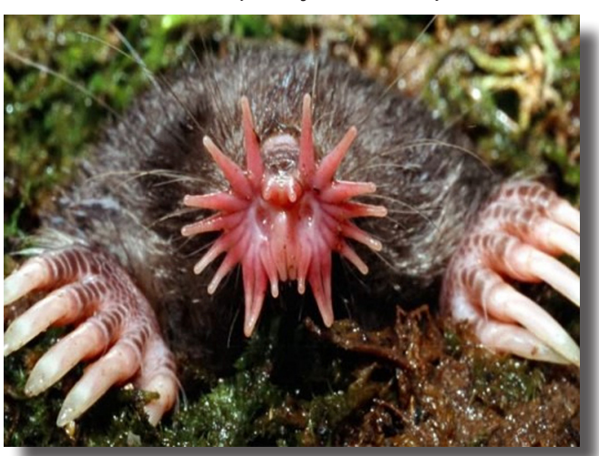
Below: Starnose Mole (Condylura cristata)

Economic status: Neutral. Occasionally does damage to lawns or golf courses; destroys many insects; aerates soil. Fur of some value.