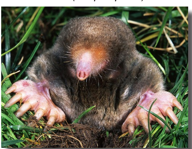
Below: Eastern Mole (Scalopus aquaticus)

Economic status: Damages lawns and gardens, but destroys many insects and aerates soil where not cultivated.