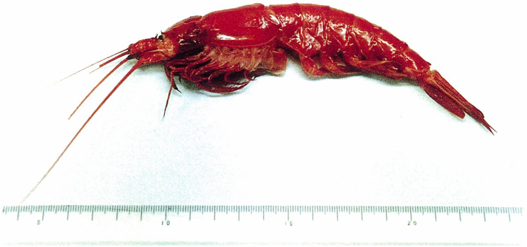
Thysanopoda spinicaudata Brinton, adult female of 141 mm.