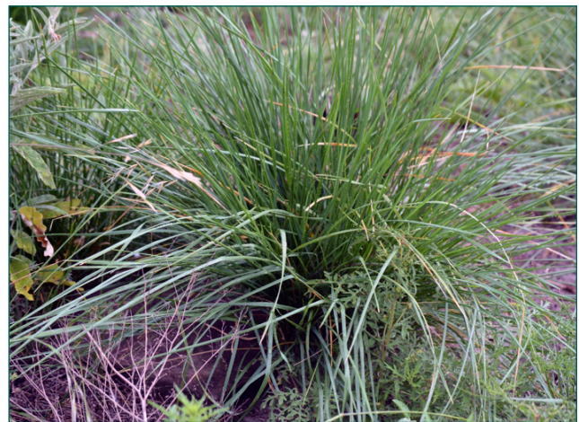
Figure 2. Mexican needlegrass has spiny tips on the end of leaf blades that makes the grass extremely undesirable to cattle, sheep, and horses grazing on infested rangeland.

Mexican needlegrass is prolific and reproduces sexually and asexually. Vegetative reproduction is through 10 to 20 buds at the base of each stem