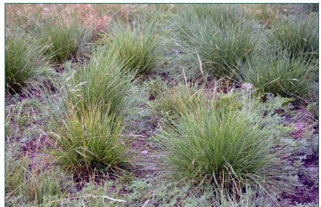
Figure 1. Mexican needlegrass is a prolific seed producer which rapidly colonizes on deep soils throughout West Central Texas.

Mexican needlegrass is native from northern Mexico to Colombia, but is now found in pastures and along roadsides in numerous Texas counties (Table 1). Areas in west and central Texas with deep soils are especially susceptible to Mexican needlegrass after above-normal rainfall. Cattle typically avoid grazing Mexican needlegrass because of the sharp-pointed leaves, though goats sometimes eat this grass.