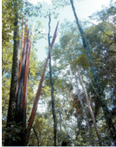
Damage in experimental plot 4 caused by a falling tree (Paracou site). Logged and thinned forest.

Secondly, the number of trees of dbh \geq 60 cm after 50 years predicted either by using one set of mean parameters, or by calculating the mean result of 10 000 repetitions with sampled parameters are close to each other, regardless of the species. No logical rule can be found as to over or under-evaluation according to the initial diameter distribution. The important point is that, by sampling parameters and averaging the results of the simulations, we obtain what can be considered as “the most probable value” given the quality of the increment and mortality estimates for the trees under study. We also obtain