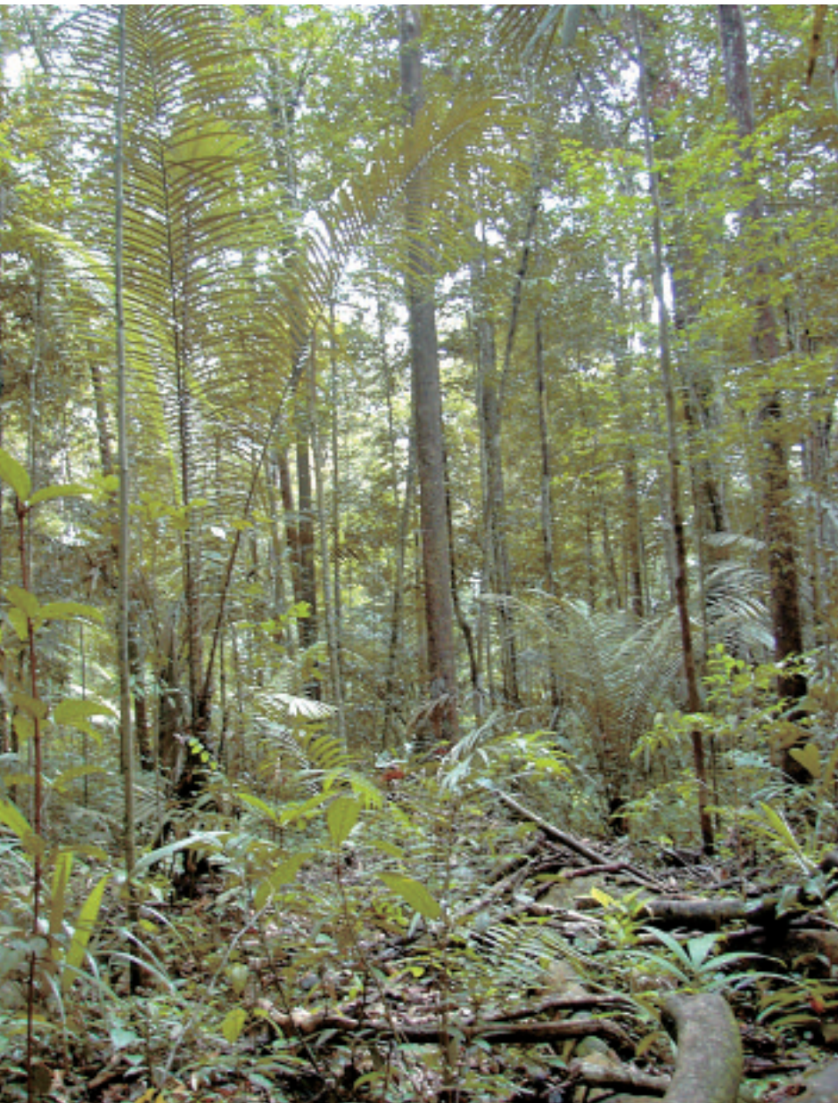
Clearing in the stand in plot 15 (control).

▪ Use should be made of the real information available on the variability of estimates of population dynamics parameters, at least for diameter increments and mortality rates. This can be achieved by repeated simulations with sampling of the parameters in the interval of variations observed. The mean result can thus be associated with meaningful confidence intervals, to obtain assessments of the risk taken depending on the species considered. In the case of French Guiana, results show that a 50-year felling cycle could ensure the recovery of 83% of trees of dbh \geq 60 cm belonging to the three most valuable timber species. However, there are high risks to the recovery of one of them, Sextonia rubra , which will probably deserve more careful logging rules in future.