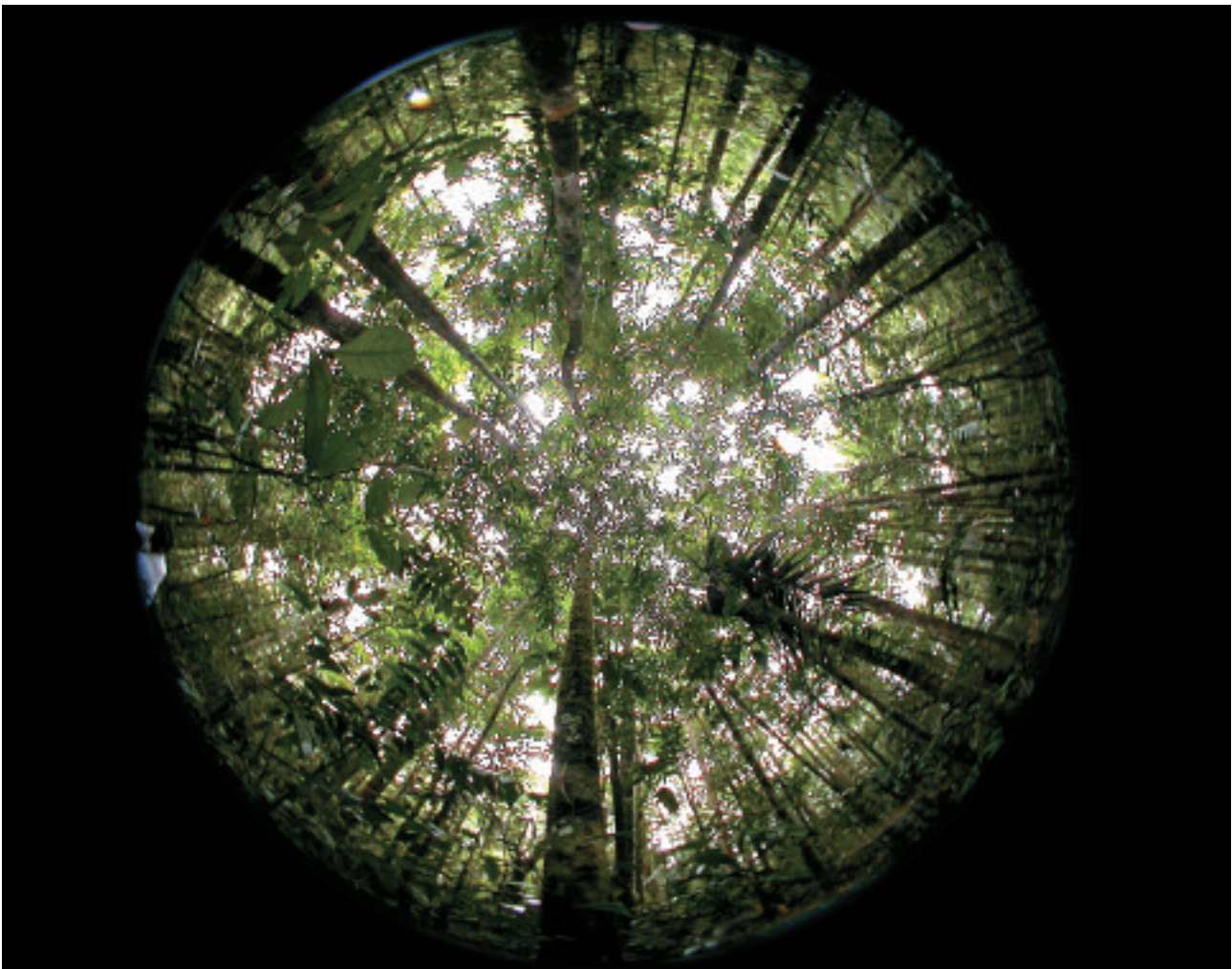
Hemispheric photograph taken in plot 11. Undisturbed forest.

Third, all the simulations indicate that the initial number of trees of dbh \geq 60 cm will not recover within 50 years after logging, the situation being of greater or lesser concern depending on the species. If the three species are grouped together, 83.5% of the stock could be back by the end of the felling cycle. This is consistent with what was indicated in GOURLET-FLEURY (2000)