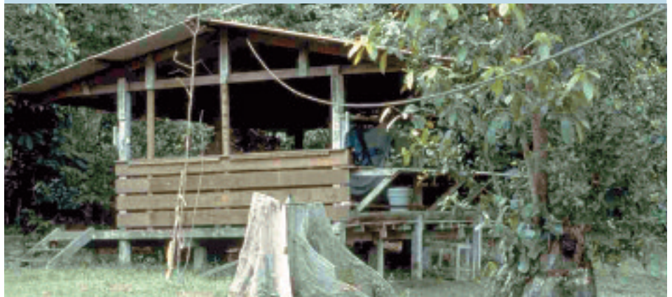
Carbet of the Paracou camp.

For each species, the recruitment vector R_S was calculated so as to maintain a constant number of trees in the first diameter class.