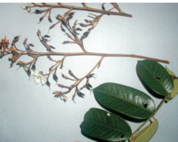
Angelica inflorescence and leaf ( Dicorynia guianensis ).