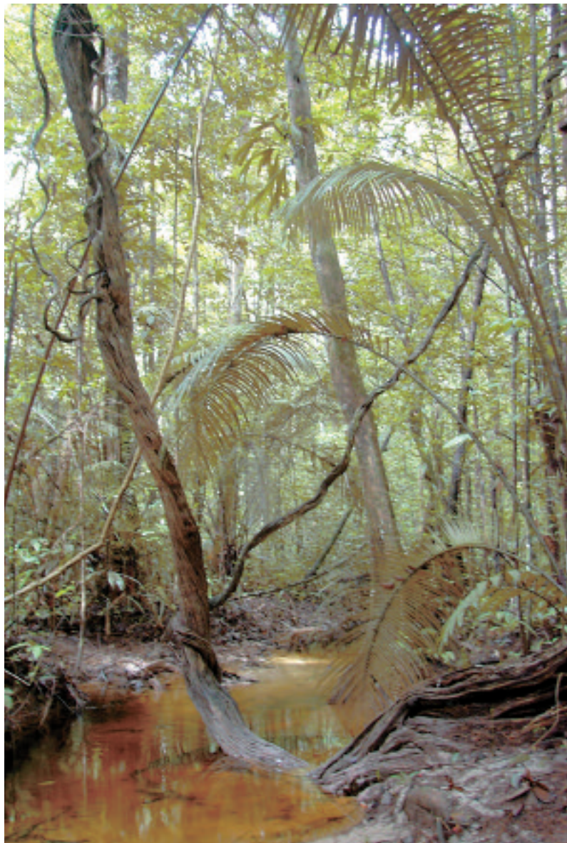
Overview of the stand in a bottomland near experimental plot 14 (Paracou site). Undisturbed forest.