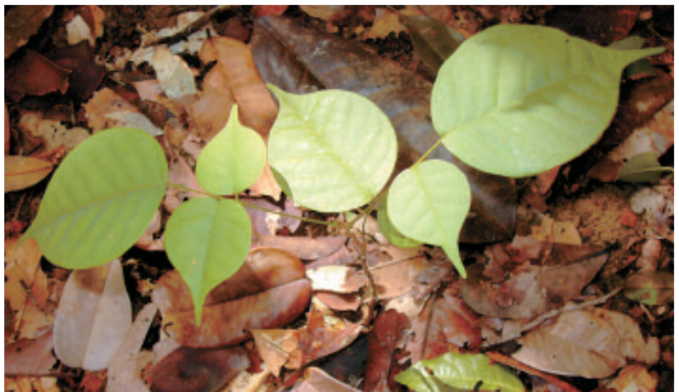
Angelica sapling ( Dicorynia guianensis , the main logged species in French Guiana) in the forest understory.