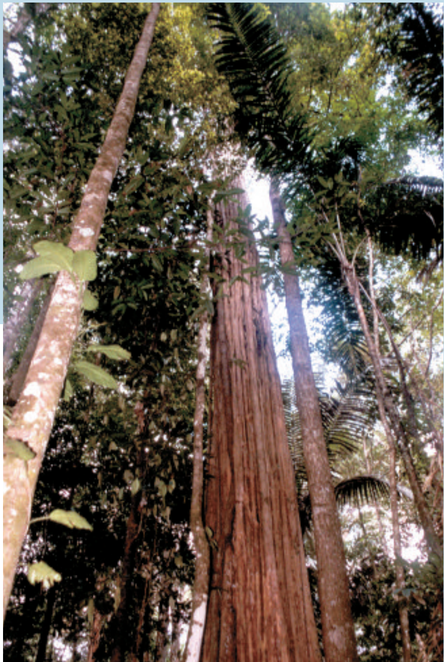
Overview of the stand adjacent to experimental plot 16 ( Chimarrhis turbinata , background). Undisturbed forest.

1 Article adapted from a paper given at the IUFRO Symposium: Manejo integrado de florestas umidas neotropicais por industrias e comunidades , held at Belém, from 4 to 7 December 2000. A preliminary version is to be published in the Symposium proceedings, by C. SABOGAL and J. N. M. SILVA (2003).