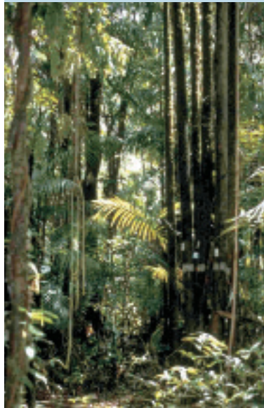
Pinot palms ( Euterpe oleracea ) in plot 16. Undisturbed forest.