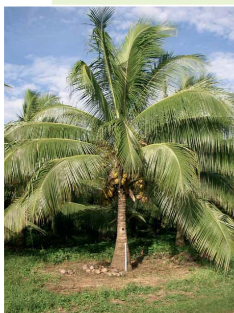
5 years old Elite VTT

The Elite VTT was obtained through selection, over 4 generations, of the best parents from coconut populations collected on the east coast of Santo. Under good soil and growing conditions, it starts flowering very early and gives its first harvest 4 years after planting. The amount of copra per nut has been improved by 50% and yield (2.8 tons of copra per hectare) by 56% compared to the unselected VTT.