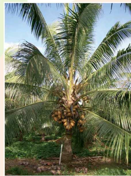
5 years old VTT x RIT

Crossing the Vanuatu Tall with the Rennell Island Tall (a variety with very large nuts originating from the Solomon Islands) has given an early-bearing hybrid variety producing a large number of large nuts (120 nuts per palm and per year). On good soil, without fertilizer, copra yield is remarkable with an average 3.7 tons per hectare, i.e. double the yield of the unselected VTT.