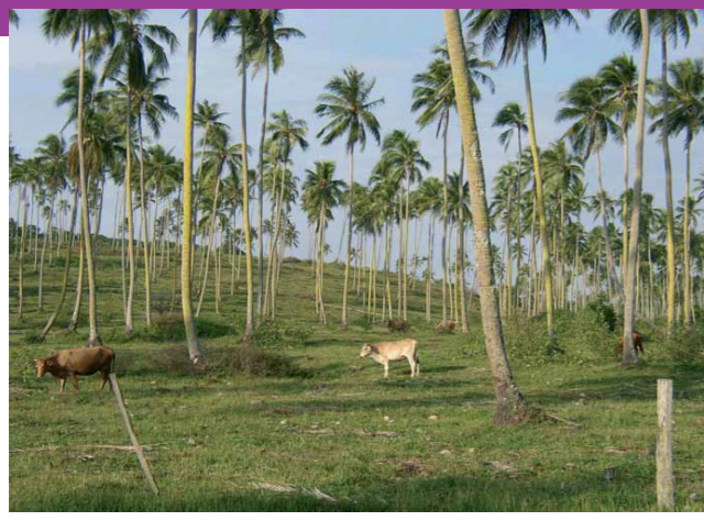
Senescent coconut plantation on Santo

Since the end of the 19th century, the economy of Vanuatu has largely depended on the production of copra and coconut oil, two coconut products that still amounted to 43% of export earnings in 2007. Coconut plantations were once limited to the island coasts, but have gradually spread to more fertile zones where they compete with food crop production. This situation jeopardizes the country's food self-sufficiency.