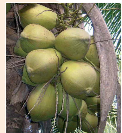
Bunch of VTT x RIT