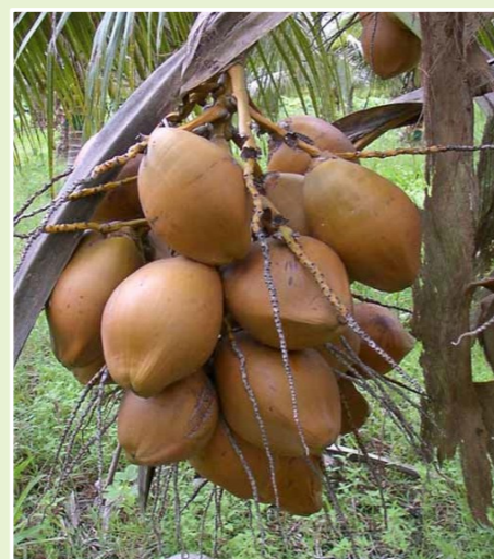
Bunch of Elite VTT