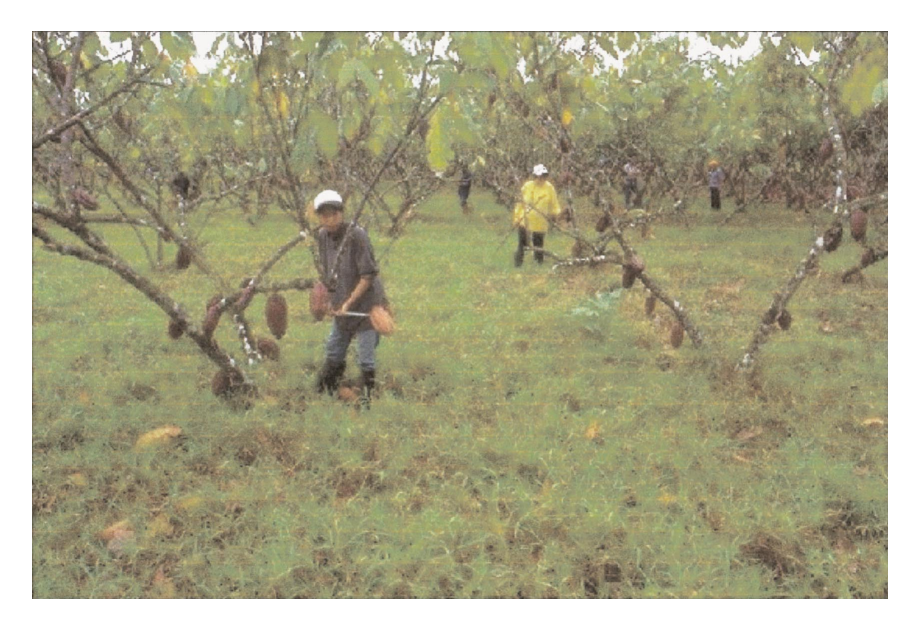
Fig. 3. Harvesting cacao in full sun. Note the dense ground weeds.

Traditional aromatic varieties are common and are generally unirrigated. Farmers use some chemical fertilizer on traditional varieties, but the only farmers who fertilize heavily are those with the modern variety CCN51. Epiphytes (air weeds) have to be cleaned off by hand, but are more common in traditional, shaded cacao. Full-sun cacao, especially CCN51, encourages ground weeds and farmers tend to use more herbicides with it. Farmers use fungicides and insecticides only sporadically (see Table III).