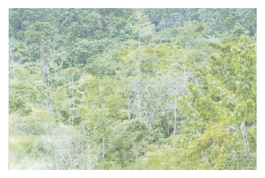
Fig. 2. Heavily shaded cacao can look like a forest, at least superficially.

It is commonly assumed that shade trees are forest remnants (Rice and Greenberg, 2000). An earlier study of cacao in Coastal Ecuador went so far as to say that most shade trees were "native to the area, of an advanced age, without market value, and without utilization value" (Mussack, 1988, p. 54). However, we only visited one farm where the shade trees were survivors from the natural forest. On all other farms, cacao was grown either in full sun or in the shade of trees that the farmers had planted. Some of the planted shade trees were quite large, and looked (superficially) like natural forest, especially when grown on steep, boulder-covered slopes (Fig. 2). But the farmers were quick to point out that they had planted the trees—as much as 40 years previously—lined up in rows, columns and even diagonally, to allow maximum wind passage (or as one farmer called it: by all four winds, por los cuatro vientos ). Some of these large shade trees were planted decades after the natural forest had been cut. Some of the farms had first been cleared of natural trees, then planted in banana, sugarcane, or some other field crop for many years before being replanted in anthropogenic forest (see Table I).