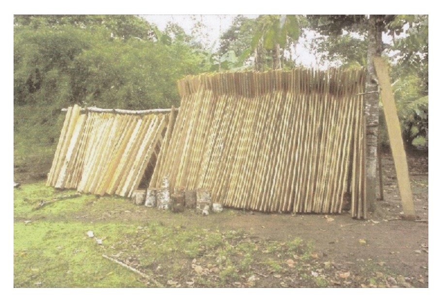
Fig. 4. Laurel timber drying next to a cacao grove.

plants. In some groves, farmers plant coffee as an understory to cacao, so the cacao is actually the shade tree for the coffee.