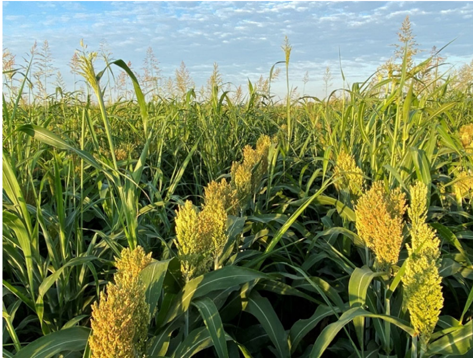
Figure 4. Infestation of johnsongrass in a grain sorghum production field in southeast Texas.