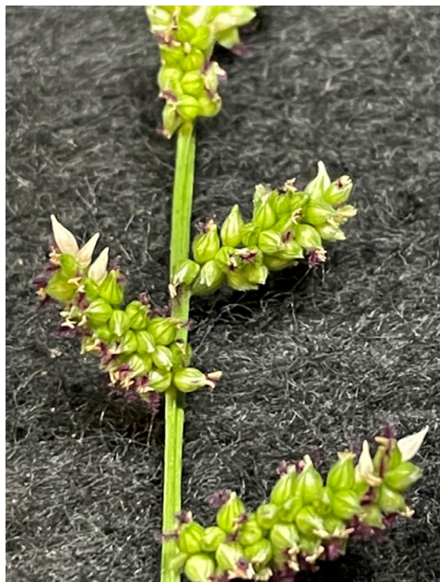
Figure 1. Ongoing pollination of a barnyardgrass inflorescence.

PMGF and the spread of HR weeds into new agroecosystems is a concern because it introduces new HR alleles into weeds and makes them difficult to control with herbicides (Jhala et al. 2011; Jhala and Hall 2013). Beckie et al. (2019) reported that PMGF from HR crops has been extensively studied; however, PMGF from HR weeds is understudied. Jhala et al. (2021) reviewed PMGF from economically important HR broadleaf weeds to susceptible weeds; however, a comprehensive review of the scientific literature on PMGF from HR grass weeds has not been collated. The objective of this article was to review reproductive biology, HR biotypes, and the potential for herbicide resistance allele transfer via pollen from economically important and widely distributed HR grass weeds, including barnyardgrass, creeping bentgrass, Italian ryegrass, johnsongrass, rigid ryegrass, and wild oats ( Avena fatua L. and Avena sterilis L.).