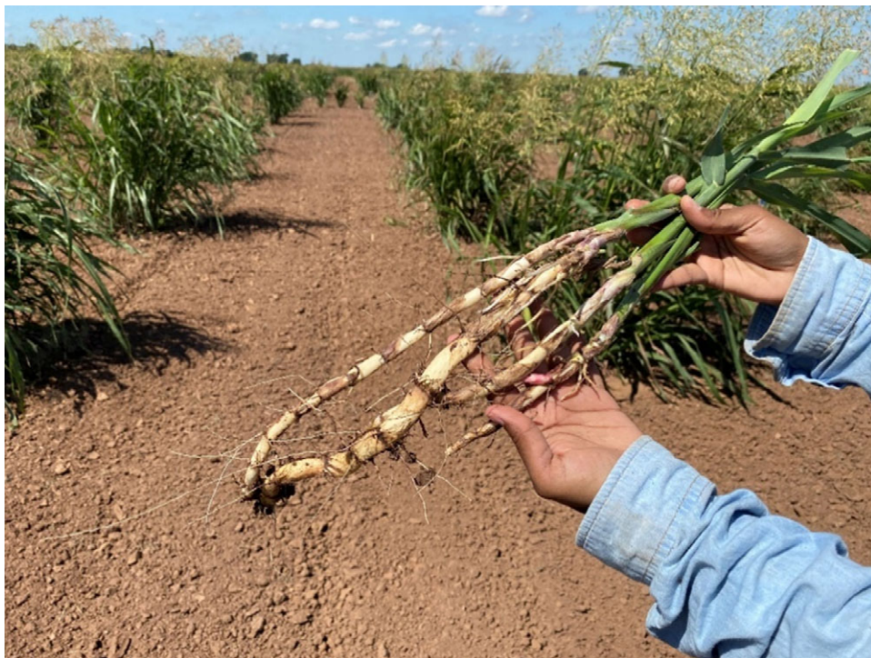
Figure 5. Vigorous rhizome production by johnsongrass in a field study conducted at College Station, Texas.

counties in Arkansas and found resistance in two accessions for glyphosate or imazethapyr. Riar et al. (2011) confirmed glyphosate resistance in a johnsongrass population collected from a field near West Memphis, AR, that had been under continuous soybean production for at least 6 yr with frequent use of glyphosate. This