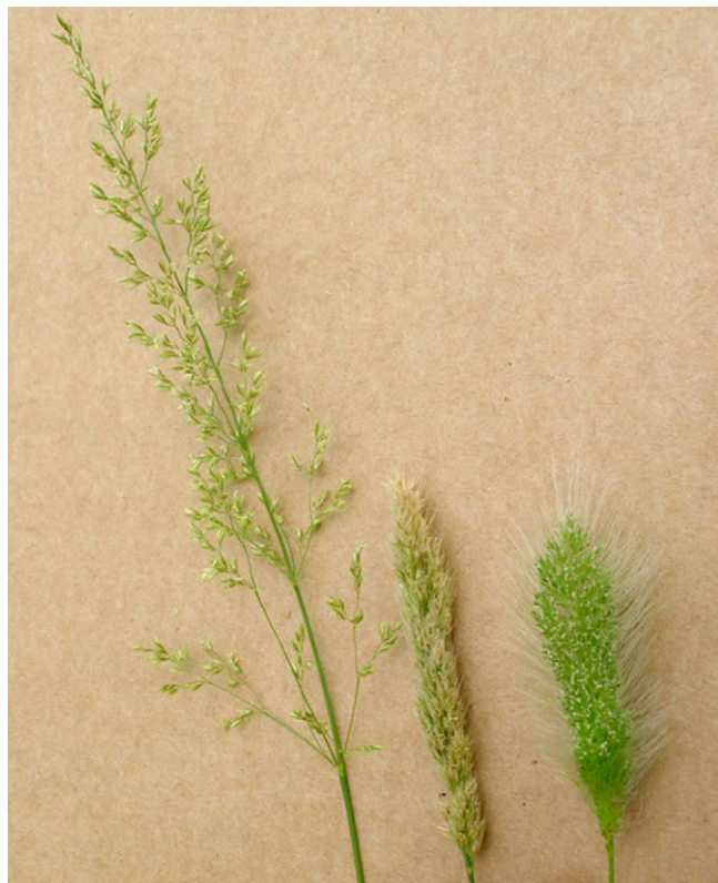
Figure 3. (left to right) Spikes of glyphosate-resistant creeping bentgrass, intergeneric hybrid between glyphosate-resistant creeping bentgrass and annual rabbitsfoot, and annual rabbitsfoot.

geographical region it inhabits. High intra- and interspecific diversity has been reported in this species (Maity et al. 2021), allowing for high adaptive potential. It is especially invasive where ground cover is disturbed or discontinuous and requires fertile, well-drained soils, and moderate temperature and moisture conditions for vigorous growth and reproduction (Beddows 1973; CABI 2021).