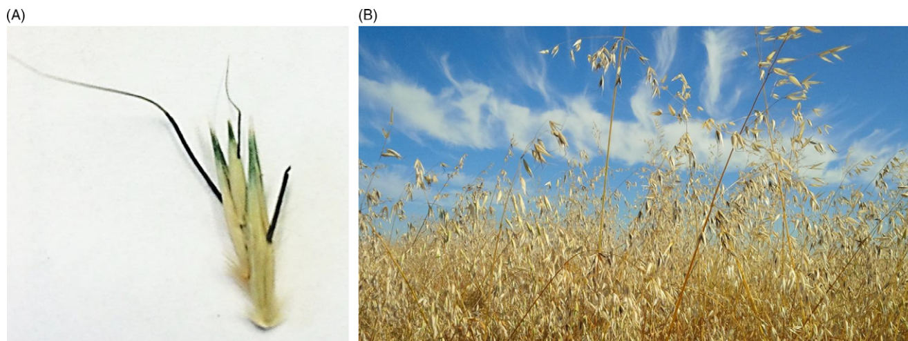
Figure 7. (A) Wild oat ( Avena fatua ): three florets/seeds and (B) wild oat mature plants in a crop canopy.