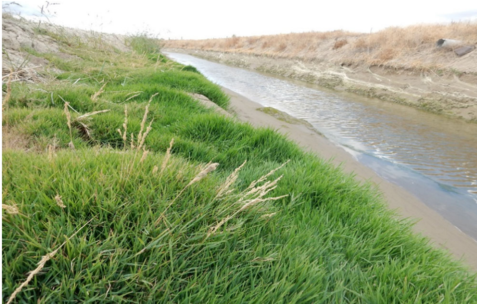
Figure 2. Glyphosate-resistant creeping bentgrass established on an irrigation canal in 2016 near Ontario, Oregon.

(Bradshaw 1958). Many of the hybrids are fertile; even if sterile, the plants will likely persist because the parent species are perennial and reproduce vegetatively.