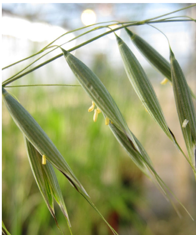
Figure 8. A wild oat panicle during anthesis with yellow anthers visible on some of the florets.

compared with those favored by A. fatua (Stace 1997). In addition, A. sterilis can grow under drier conditions than A. fatua (Fernández-Quintanilla et al. 1990; Thurston 1951).