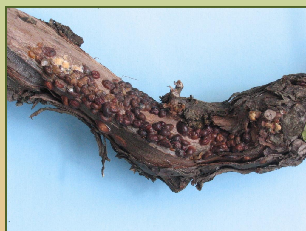
Fig. 6-7. Numerous colonies of P. persicae on grapevine trunks