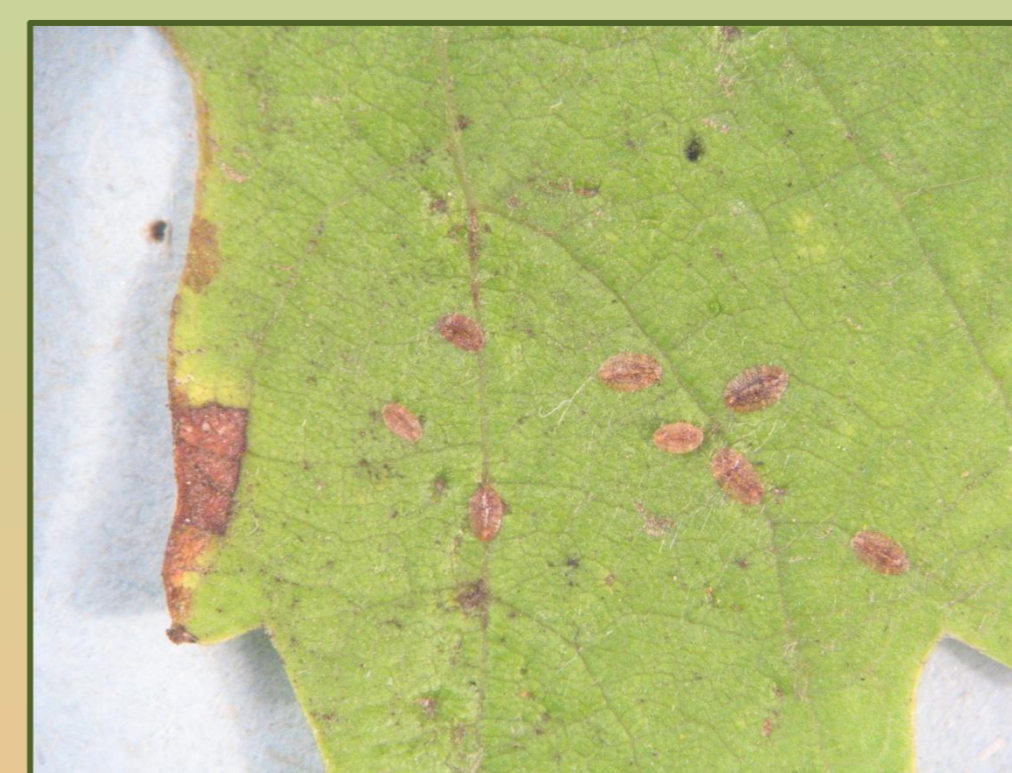
Fig. 8. Leaf discoloration