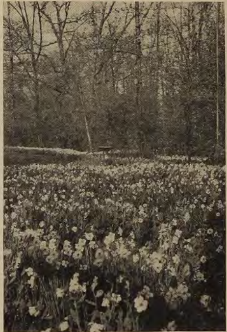
DAFFODILS IN THE WOODS

When spring cleaning in the garden, do not burn the trash. Use it for compost.