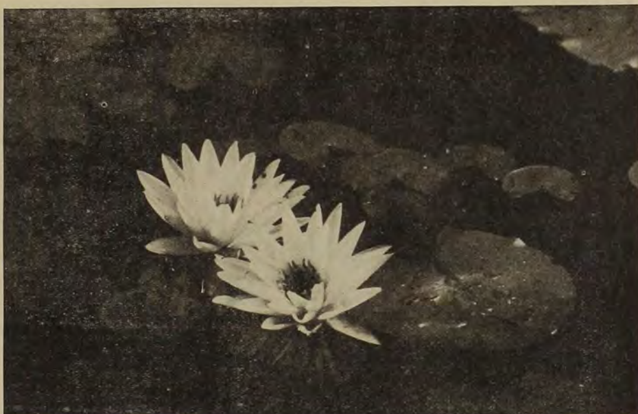
Photograph by Varela