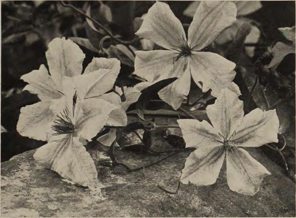
Donald Merrett ©