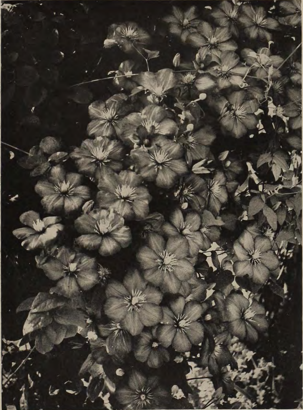
Donald Merrett ©

Clematis Ville de Lyon , a purplish carmine hybrid of the Viticella Type