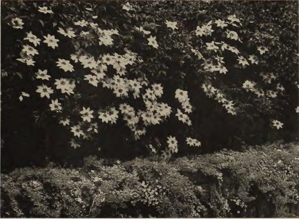
Donald Merrett ©

Clematis Miss Bateman, a white hybrid of the Patens type