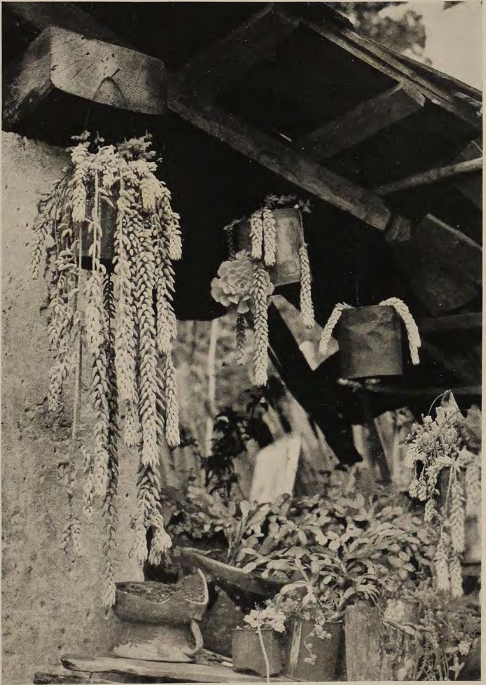
A new succulent, of merit as a basket plant. Not yet identified.