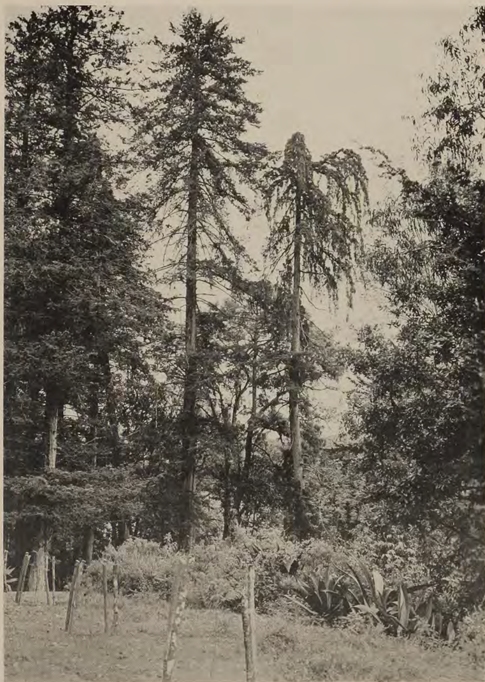
Cupressus Benthami , showing the usual variation