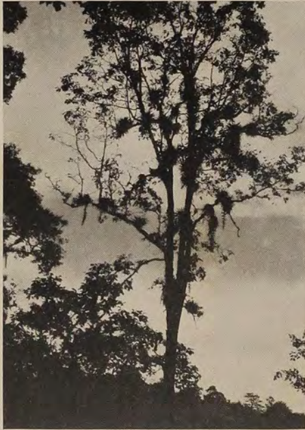
Madroña near Tenancingo covered with epiphytic Bromeliads

In closing we express the hope that any plant-minded tourists will not fail to make the slight effort needed to send home seeds or plants of anything worth while they may discover.