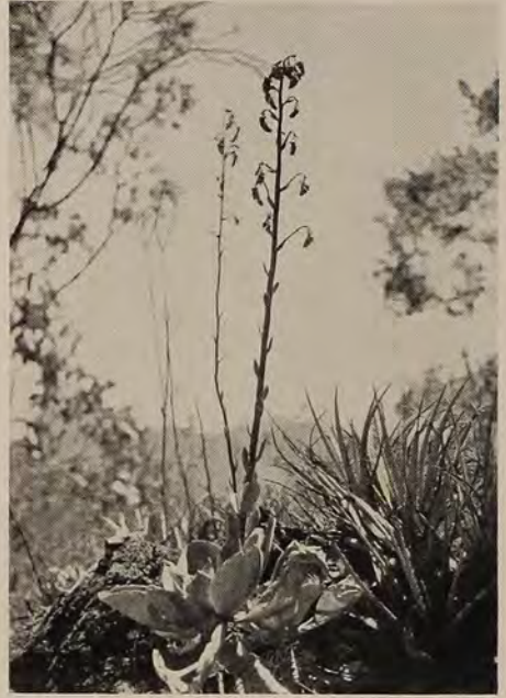
Echeveria gibbiflora DC. near kilometer 86 on railroad to Cuernavaca

Next day, Sunday, we spent at Cuernavaca, where the balmiest climate we know invited to a day of rest. In the afternoon the return to Mexico City took us over a now familiar road, at this season lined with a wealth of flowers, including masses of Lopezia , Bidens , Tagetes , Eupatorium , Salvia , Stevia , etc. A brief stop was made near the summit, at Cima, where last year we had found a new species of Echeveria , i.e., E. crassicaulis , and our host here posed for us against the trunk of the largest specimen we had yet seen of Juniperus mexicana . Here also grew some fine specimens of a Lamourouxia , a genus of the Scrophulariaceae , very tempting to the plant collector, but culturally impossible because it is a root-parasite like the related Castilleja .