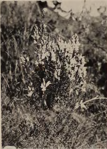
Lamourouxia sp., near Mexico City

On another day we had occasion to again visit this vicinity, on the hunt for typical Echeveria gibbiflora , seen the previous season from the window of the rushing train on our very last day in Mexico. We simply had to come back to photograph and gather this, as well as to make certain of its identity. Utilizing the one daily train from Mexico City to Cuernavaca, we got off at El Parque, and thence hiked over the ties to Kilometer 86, with a literal jungle of wild flowers lining the way. The Echeveria proper occurred in a rather drier location on an old lava flow, as part of a more xerophytic plant association. One member of this was a species of Hechtia , a genus common in drier parts of Mexico and memorable by reason of its vindictively hooked leaf-margins. We established to our satis-