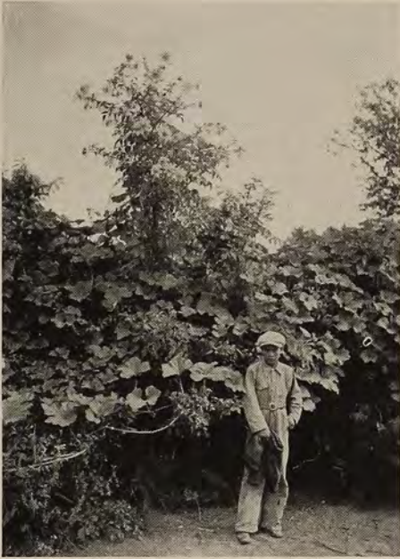
Dahlia maximiliana (?) and Sechium edule near Tenancingo

faction that here was indeed the real E. gibbiflora , with its characteristic, orbicular, blunt leaves which occasionally shaded to the deep vinaceous-lilac typical of our well known Echeveria metallica . Having gotten our plant, both alive and in pictures, we just had time to rush back and catch the returning train for home at El Parque.