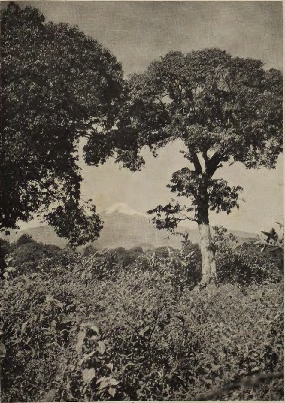
Orizaba from the tropics, framed by gigantic mangoes