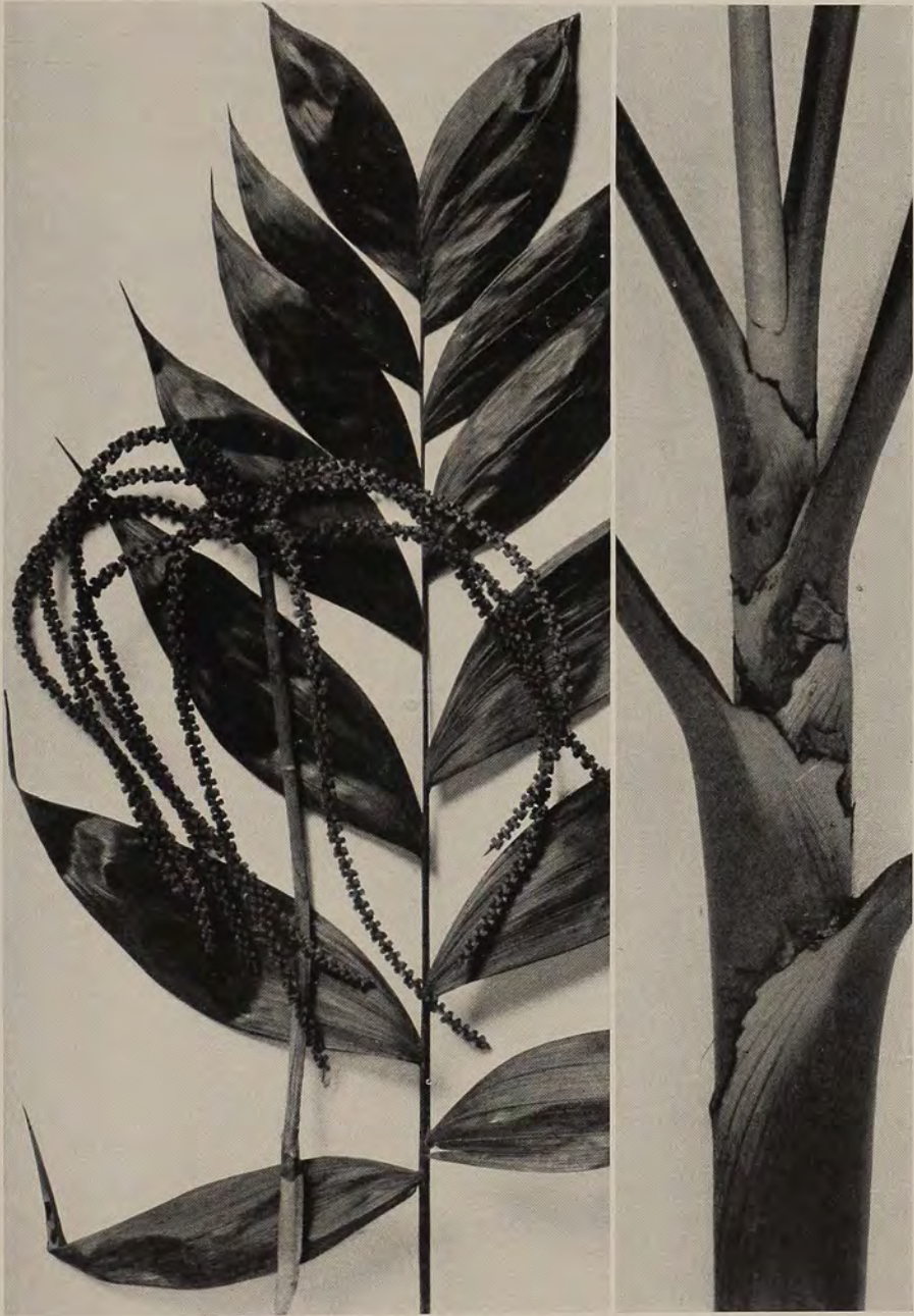
Fig. 9. Docanthe alba, leaf-blade and male inflorescence reduced, leaf-sheaths natural size