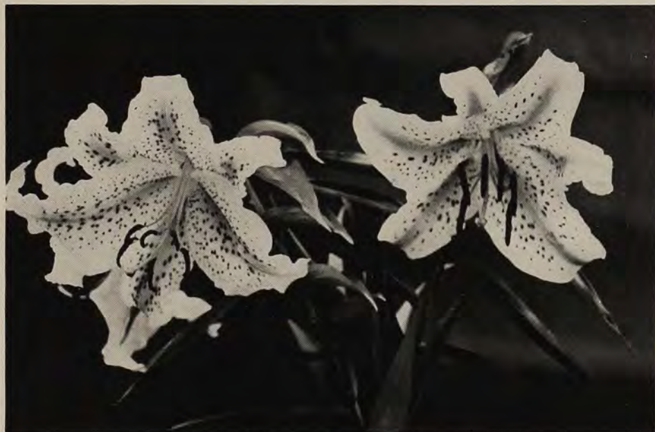
The pure Chalice type

vittatum ; there remained Wittei and Virginale that various authorities seemed confused about, the same applying to rubro-vittatum and pictum .