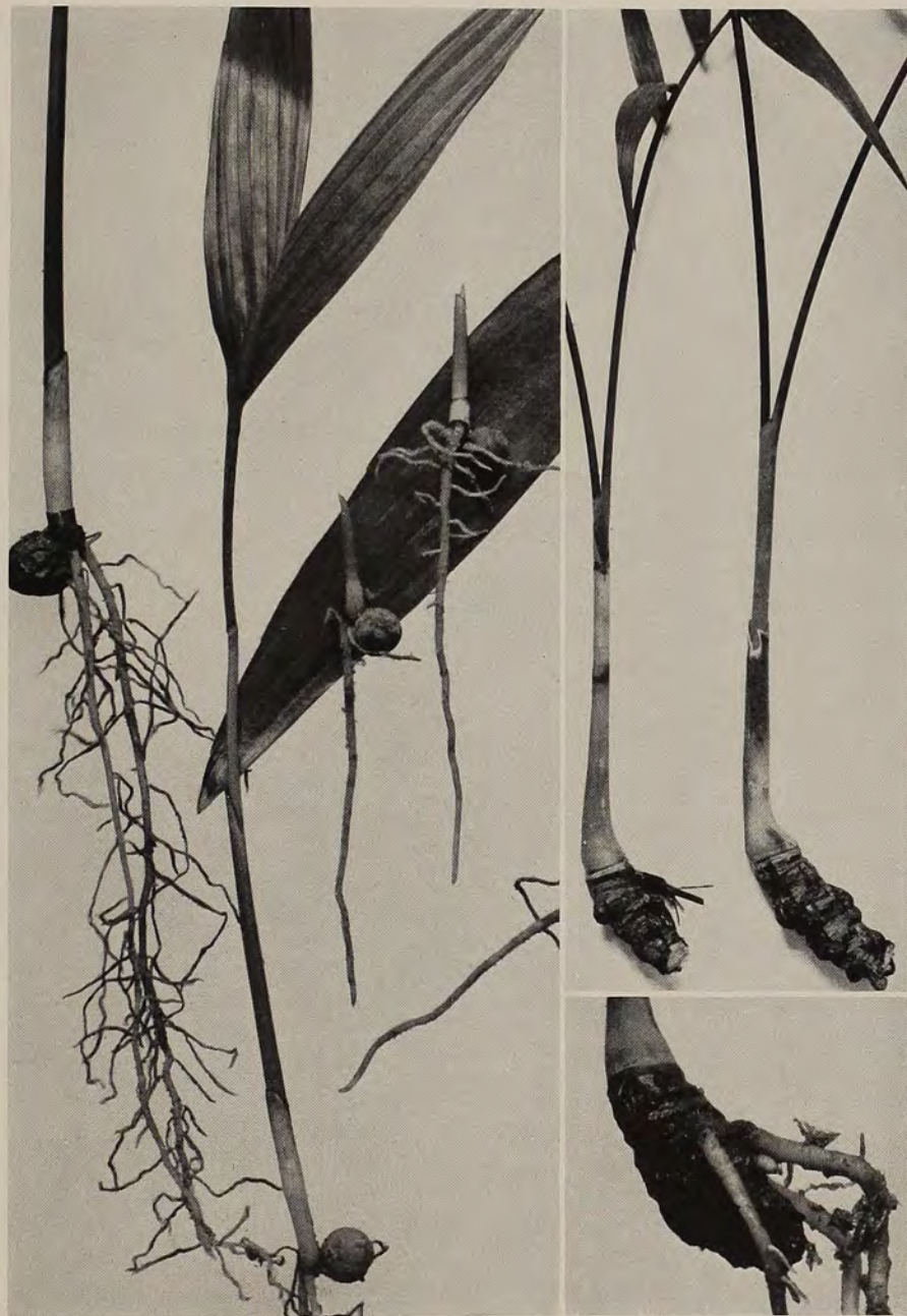
Fig. 5. Omanthe, seeds, seedlings and rooted offshoot, natural size