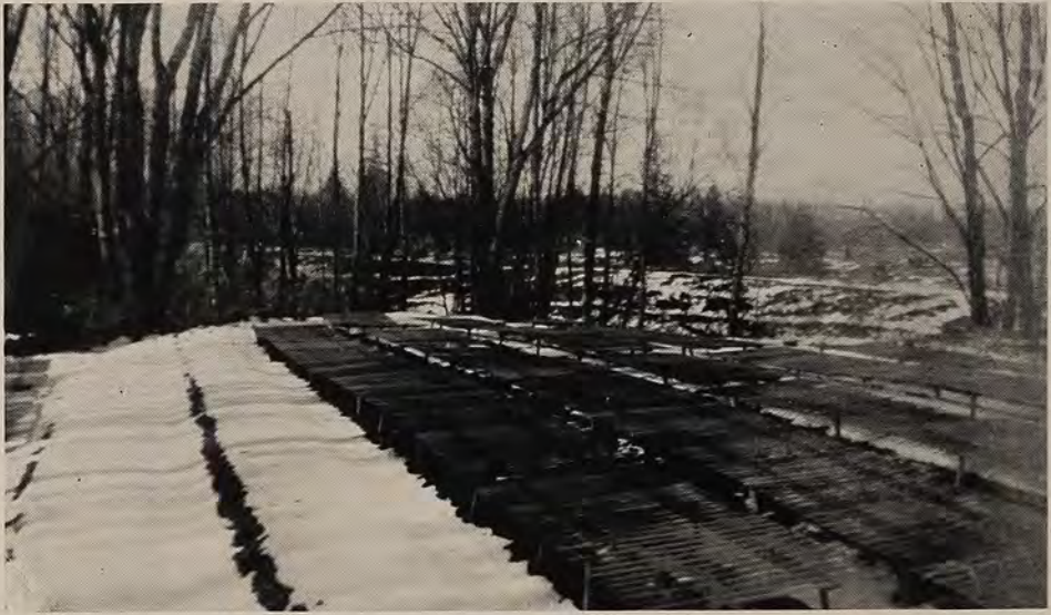
Seedbeds in winter at "Esperanza"

lover and for blood strains to infuse into late forms of desirable beauty. After a journey across the continent and a late planting, one of our groups had its earliest representatives in flower ten days before any of our own seedlings. Wada has it flowering with the japonicum six weeks earlier than this, so ours may do much better yet. We note that in every case the stems are thinner, the leaves smaller, the height less, but although some showed a corresponding miniature flower, many were as big as the normal auratum blooms and showed similar variations in structure. Turning now from the extreme forms to what we might call the main group of auratum s we find that in our particular locality of the Fraser Valley of British Columbia, the flowering period of such seedlings as we have acquired starts about July 25th, reaches its height about August 10th and the last flowers come into bloom at the end of October. Propagating from our own stock the natural selection should terminate this season in plenty of time for good pollination and the maturing