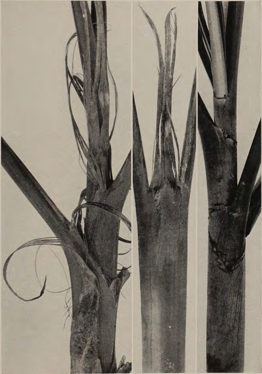
Fig. 7. Legnea and Mauranthe, leaf-sheaths, natural size