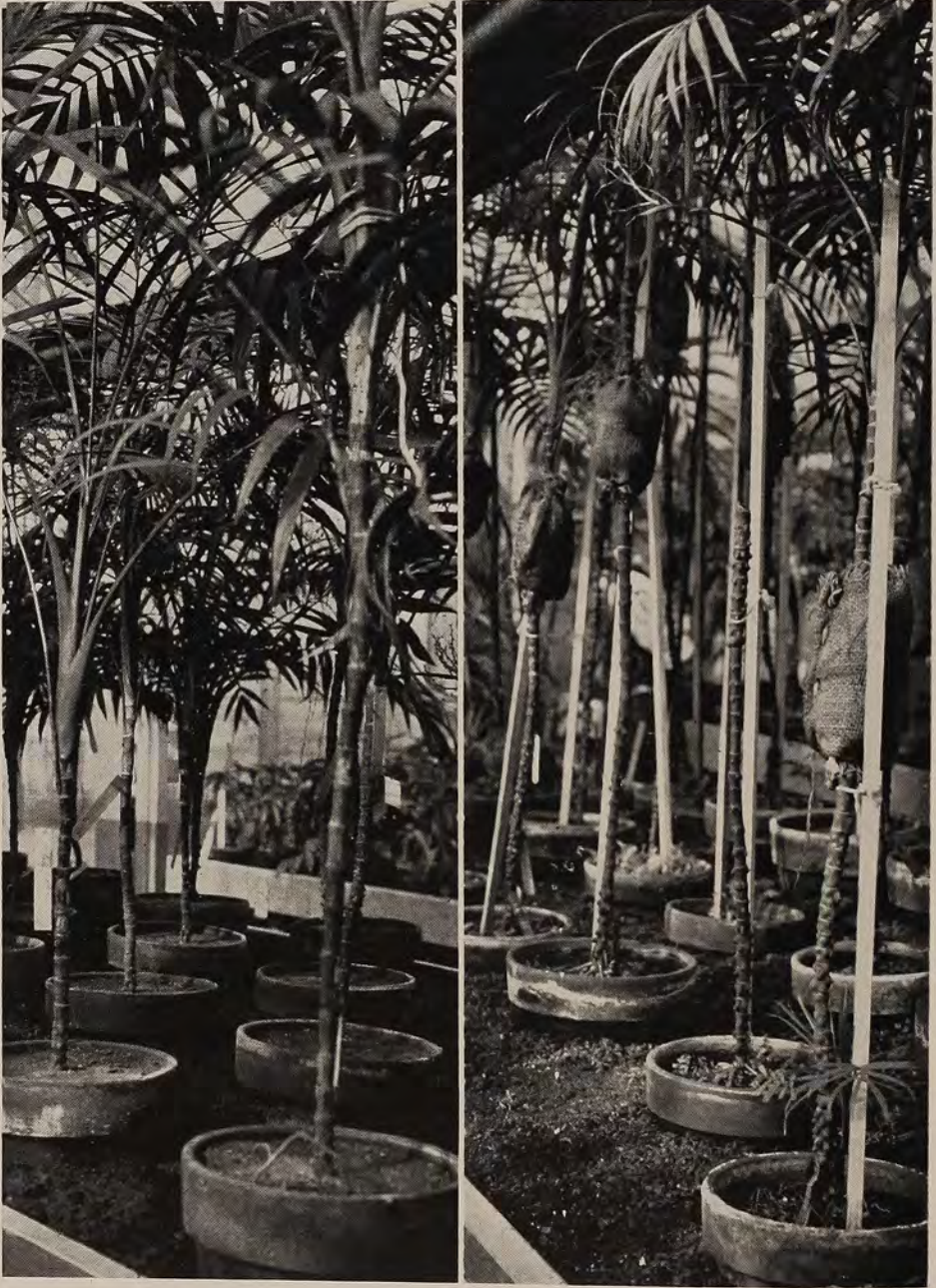
Fig. 3. Neanthe bella, mature plants, at right old plants marcotting