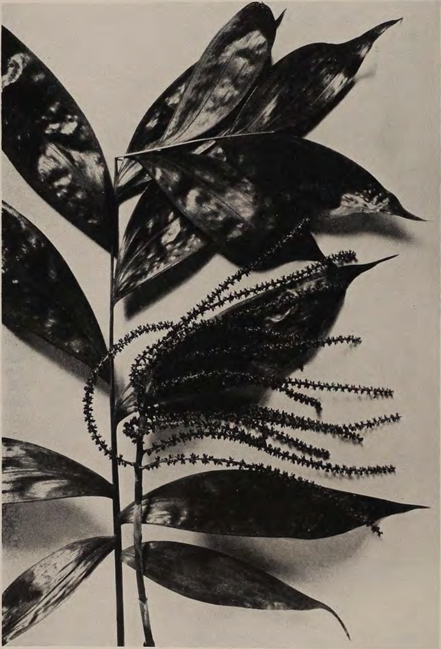
Fig. 8. Mauranthe lunata, leaf-blade and male inflorescence reduced