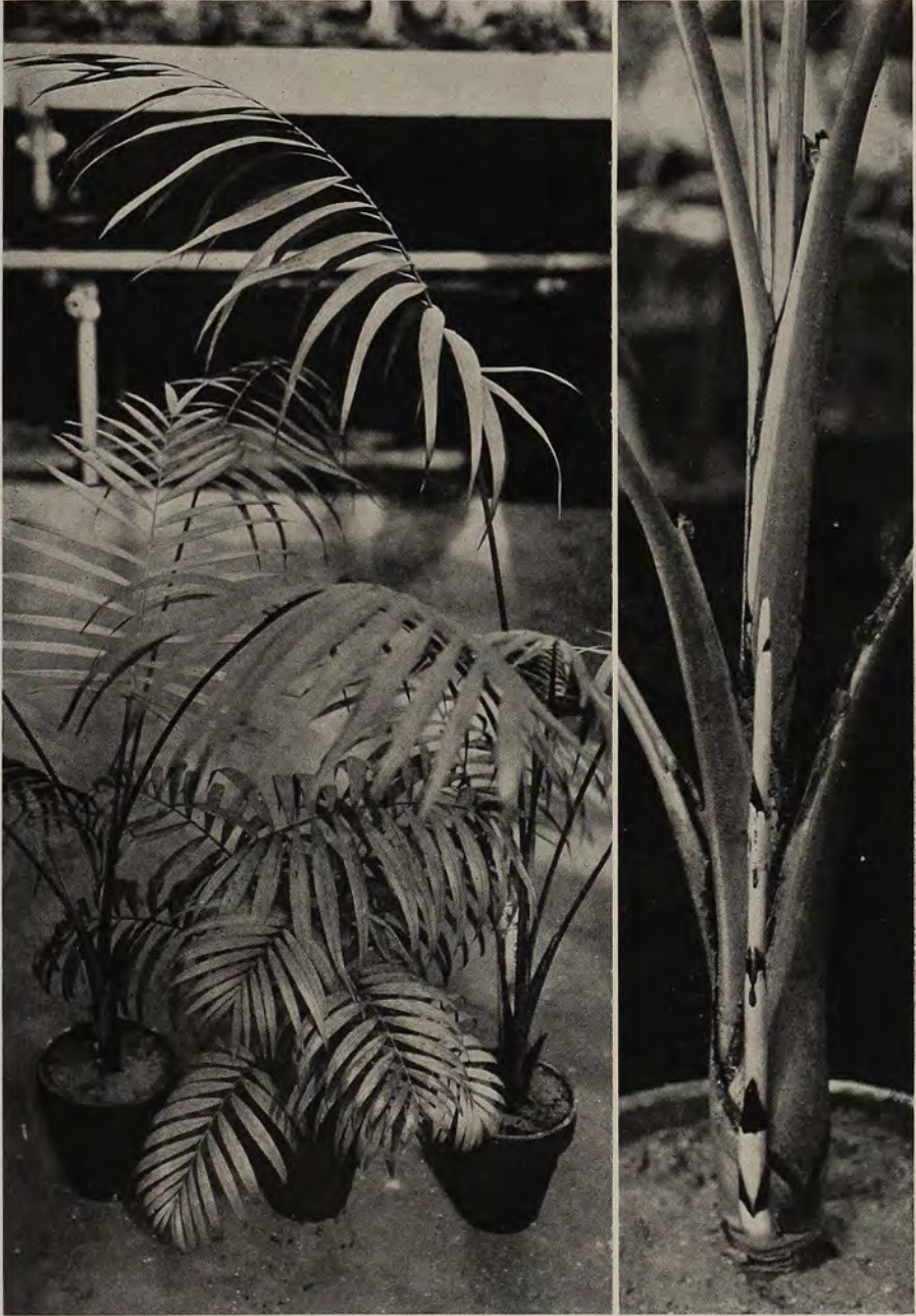
Fig. 2. Neanthe elegans and Neanthe bella (between). Leaf-sheaths and young inflorescence of elegans, natural size