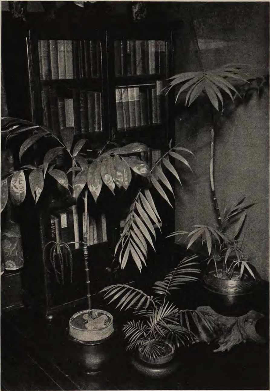
Fig. 1. Three household palms, Mauranthe, Neanthe, Omanthe