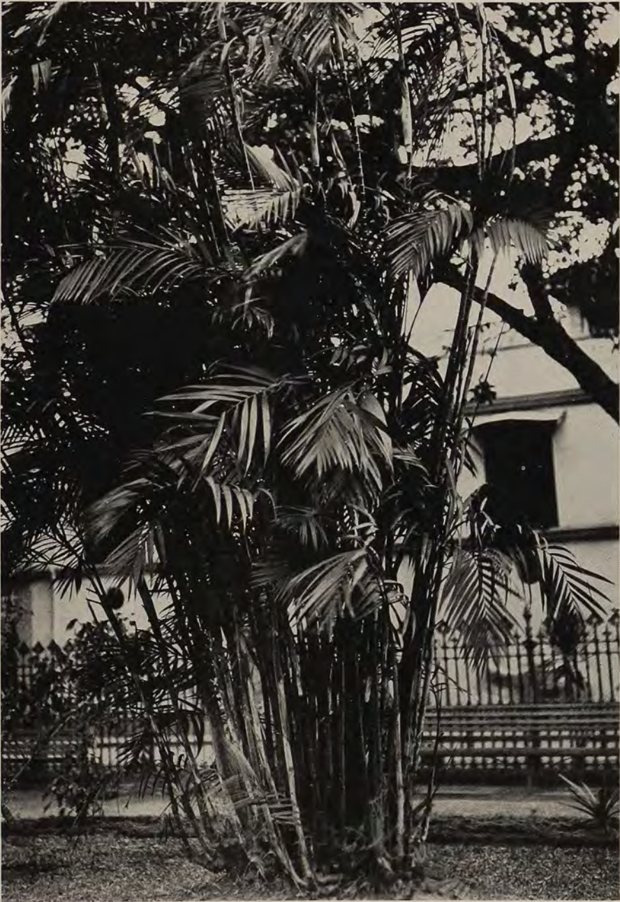
Fig. 4. Omanthe costaricana, in city park, San Jose, Costa Rica, 1903