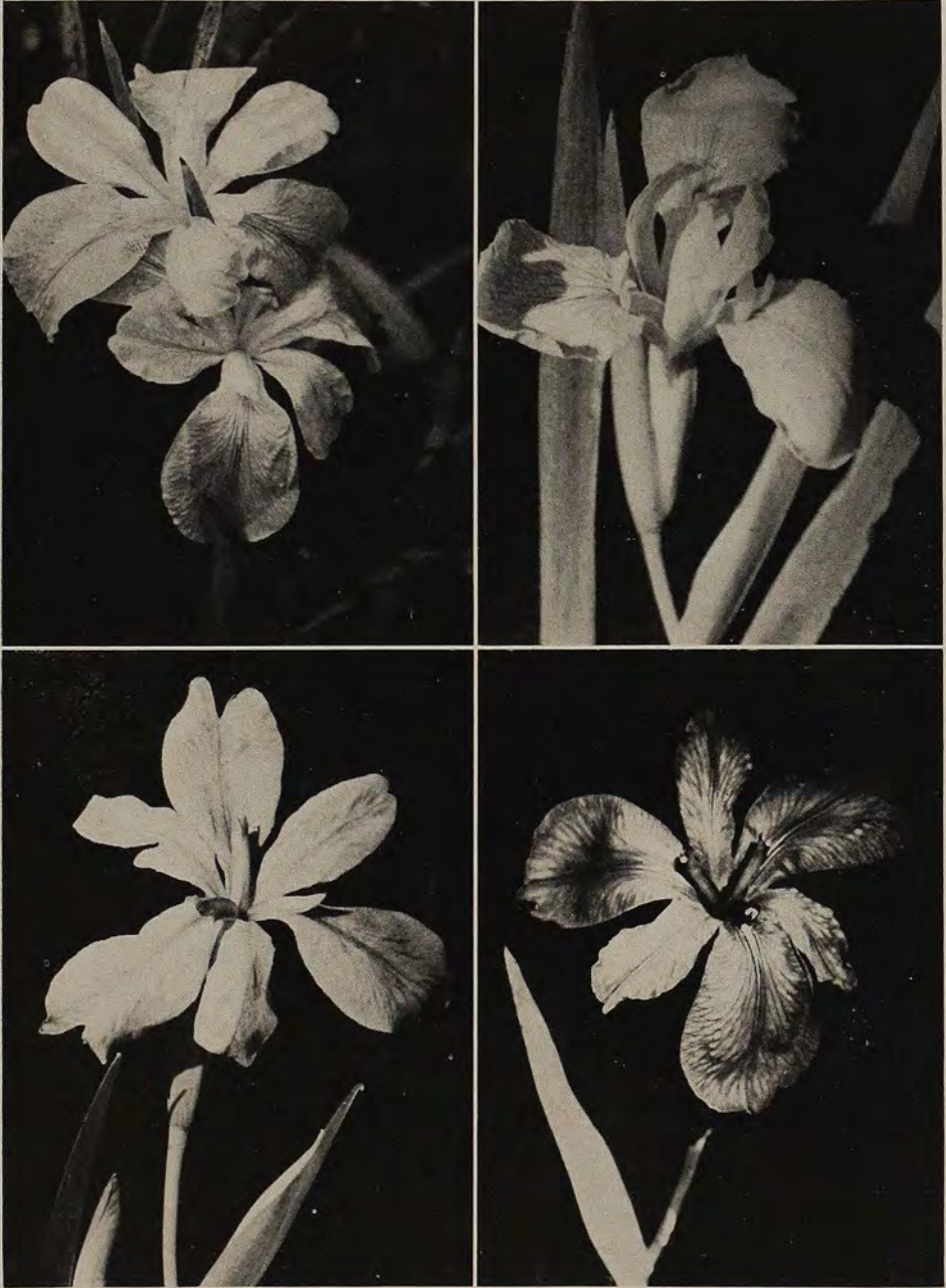
Excellent corsage material, upper left; a fondling probably foliosa-giganticaerulea cross, upper right; an oddity of fulva extraction, lower left; Abbeville red, lower right