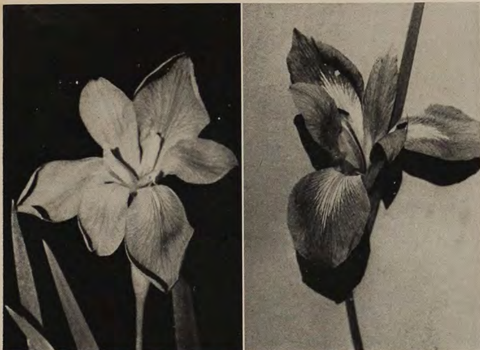
Typical Abbeville Red; giganteaerulea type

the swamp and only occasionally is the swamp bordered by patches of foliosa . Although giganticaerulea is found within a few miles, none are known to be growing with the Abbeville Reds. It seems apparent that the Abbeville Reds are a distinct type that has developed in an isolated swamp of cypress and tupelo.