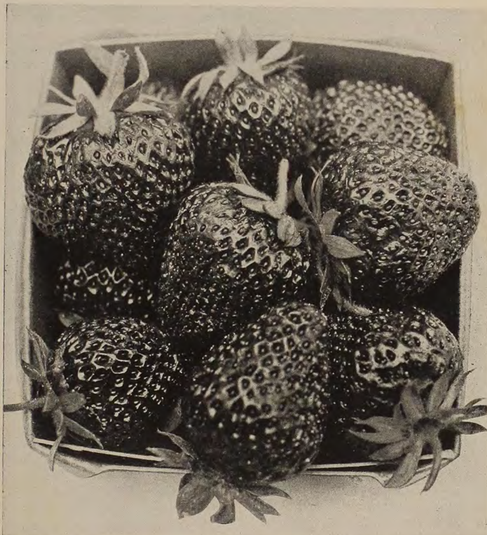
W. F. Allen Co.