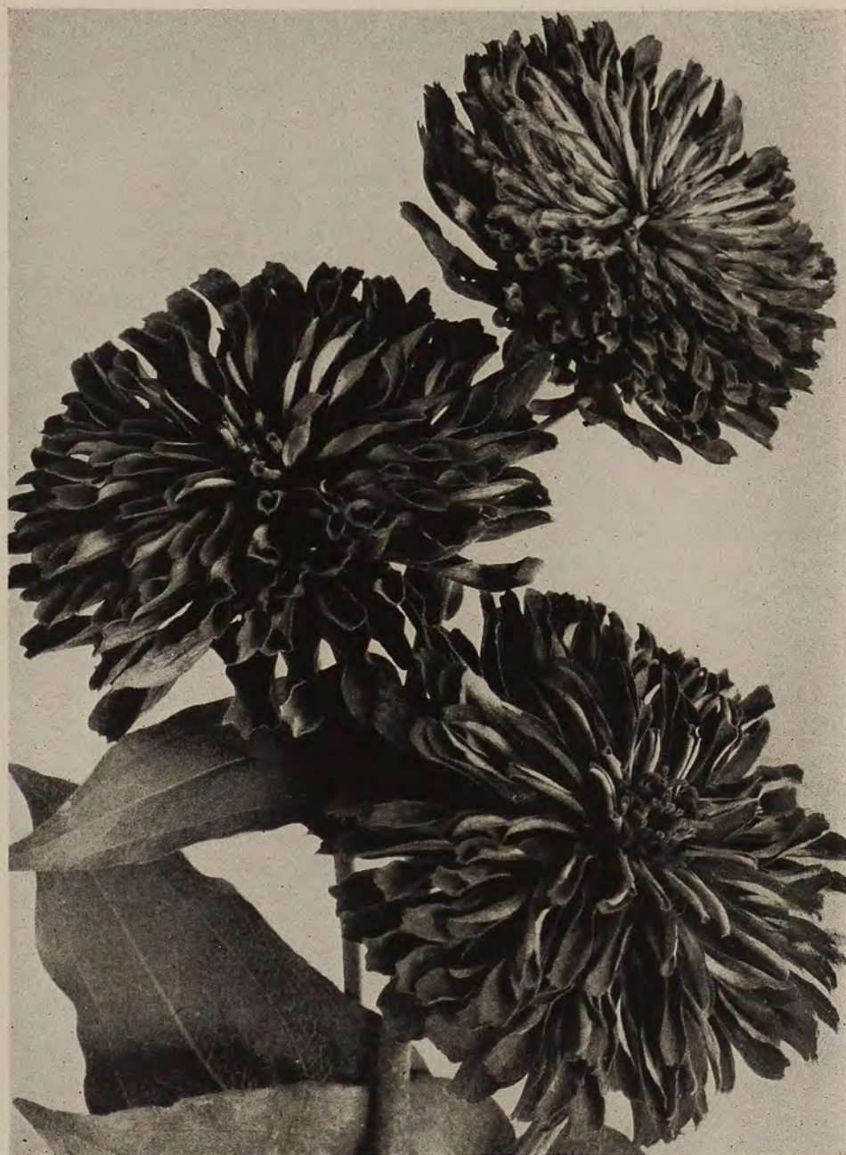
J. Horace McFarland Co.