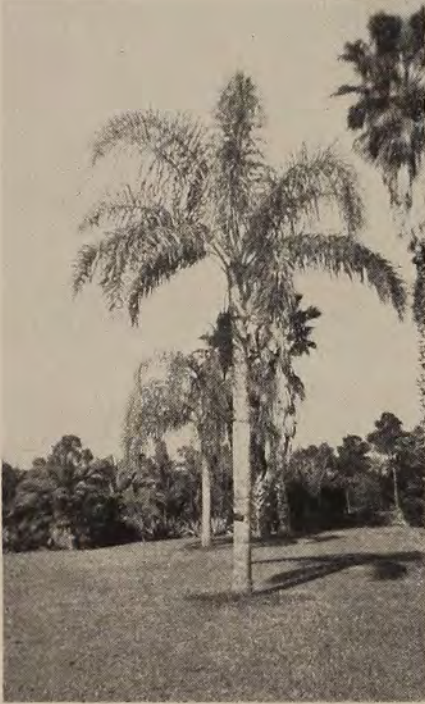
The Queen Palm. Washingtonia and Phoenix in background

The Queen Palm eventually will attain a height of about forty feet, with numerous long, beautifully arching leaves many feet in length. The leaf-pinnæ are suddenly bent downward near the middle and give the palm a most pleasing and graceful appearance. From among the old leaf-bases appear the great woody spathes, often four feet for more in length. They