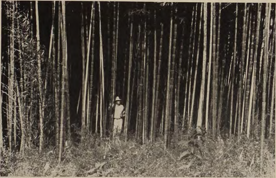
A forest of timber bamboo now growing at Avery Island, La.

Buckets, Poles for drying clothes, Fencing and railings, Various toys and ornaments, Water Conduits and drain-pipes, Walking Stocks, Telephone and Radio Areolon Poles, Rope, Pipe Stems, Flower Stakes, Window Shades, Musical instruments, Mats,