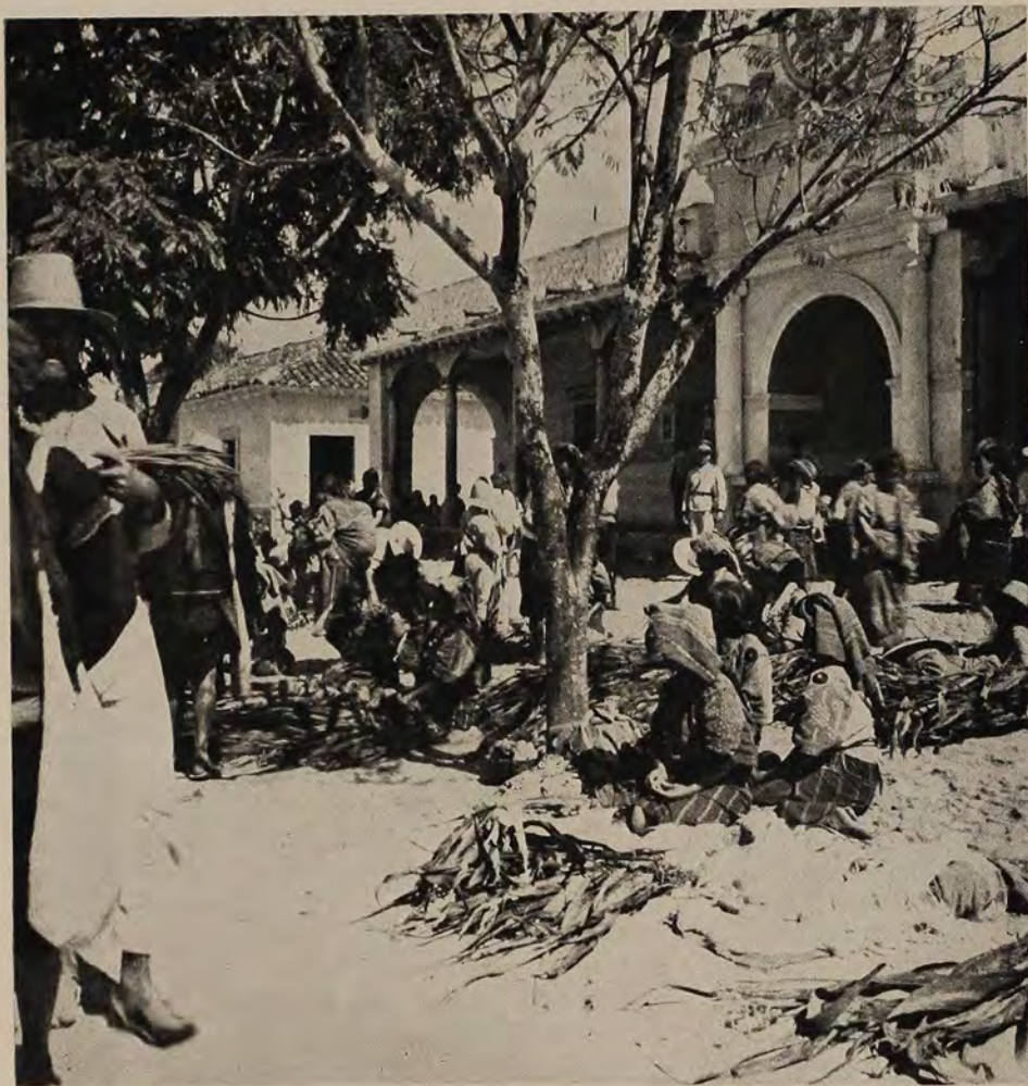
Market scene in Chichicastenango, Guatemala.

quently is merely a means of protecting "trade secrets," just as any drug company does with a patented remedy. The prestige of a medicine man depends upon his ability to dispel the "evil spirits" or illnesses of his tribe by means of secret concoctions. Often his income derives from his private prescriptions or formulas.