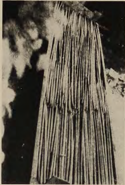
A fifty-foot gondola car loaded with large bamboo poles

In order to check the previous record of the growth of the Phyllostachys group, a cutting was made in February,