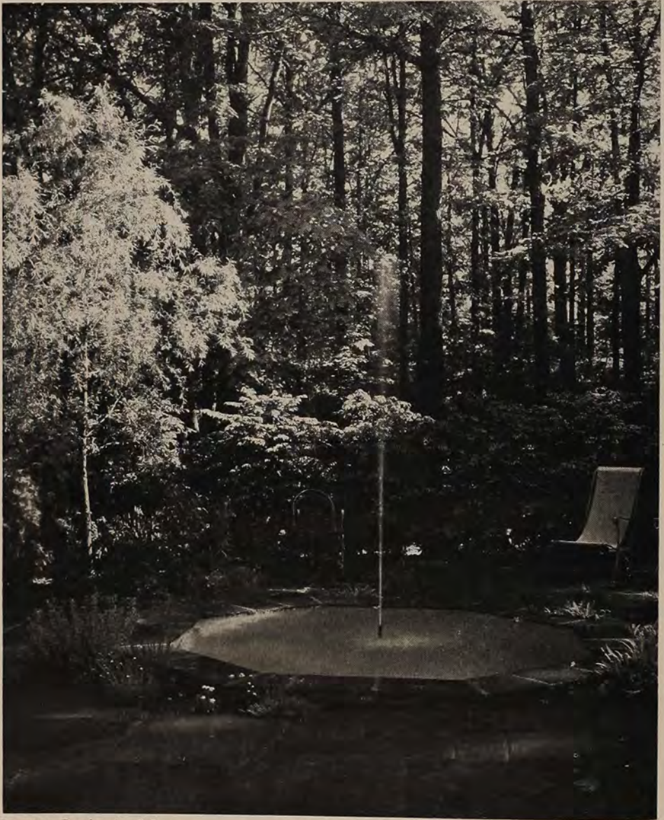
Frances Benjamin Johnson

"The vertical motif of tree trunks is accentuated . . ."