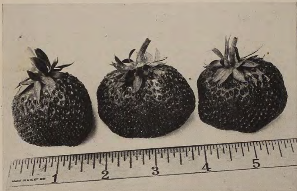
W. F. Allen Co.