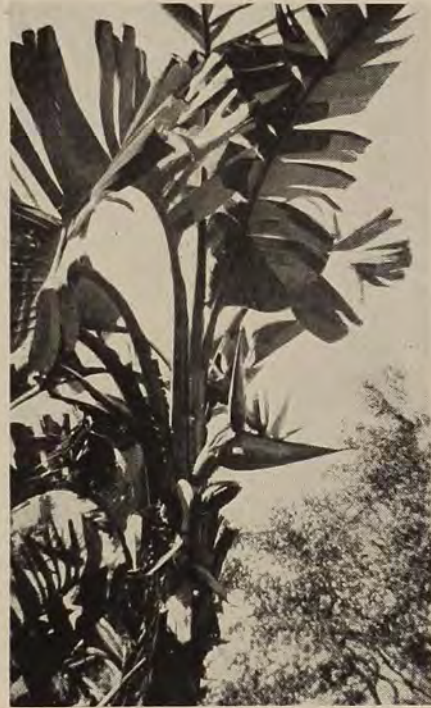
Strelitzia Augusta with inflorescence at right center and an old flower cluster at left center

The genus Strelitzia is one of a very few placed in the Musaceae, the Banana Family. It consists of about a dozen or so species, natives of South and Central Africa, of mostly rather tall, frequently woody plants with banana-like leaves and showy white, blue or green flowers borne in one or more boat-shaped bracts. S. Augusta was first described in 1781 by Thunberg from material collected in South Africa. It is very closely allied to Strelitzia Nicolai , another South African species, which it greatly resembles both in habit and foliage, but it has smaller flowers