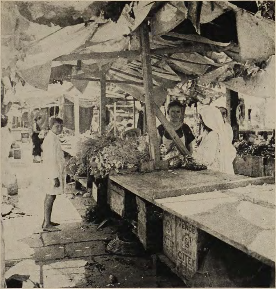
Herb market in Concepción, Paraguay.

wise unsatisfactory. On the other hand, the professional botanist may prepare good specimens but usually ignores the economic data. As a result, our botanical institutions are scantily supplied with specimens suitable for the study of native economic plants.