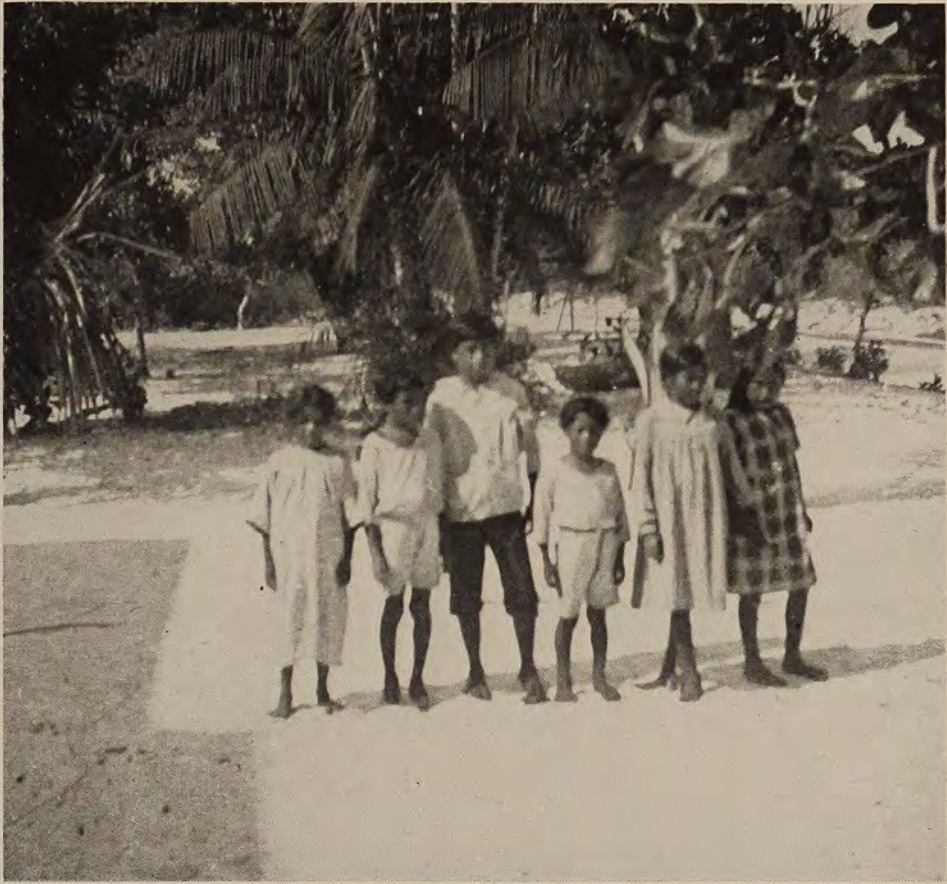
Carib children in Surinam on their way to school to learn the ABC of the white man.