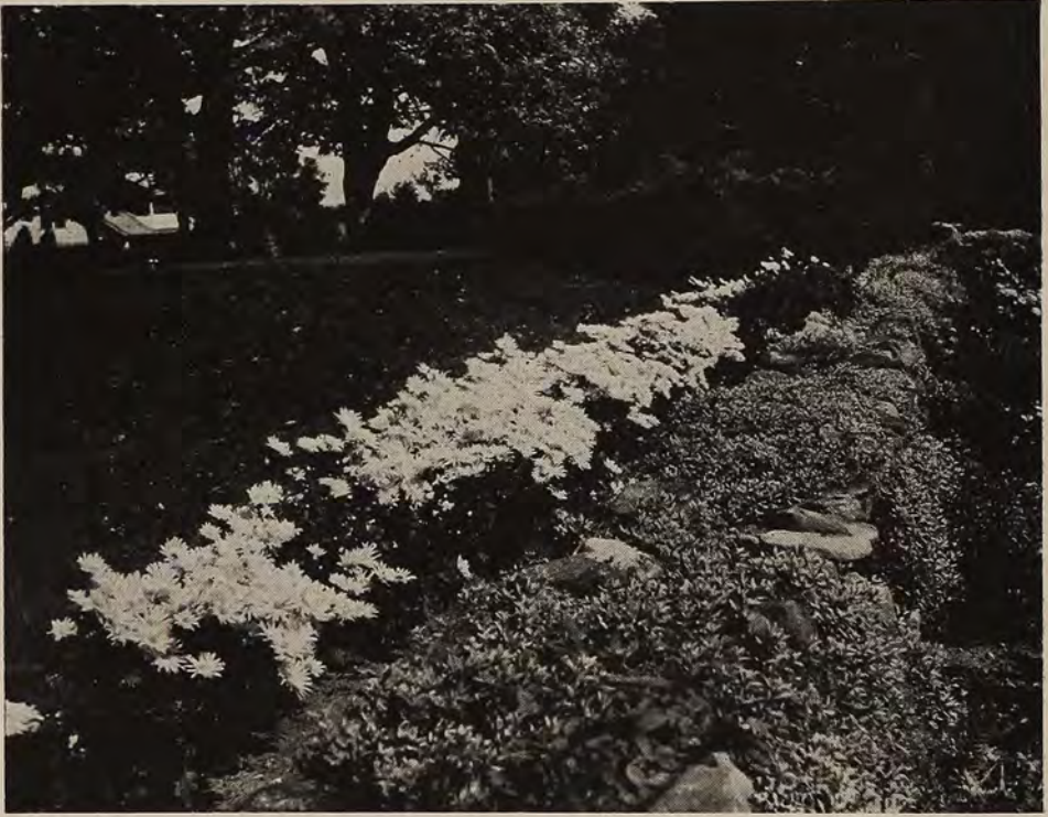
Hardy Single, North Star