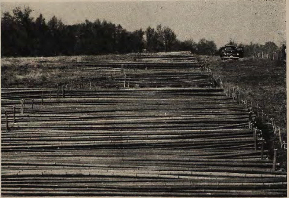
Bamboo poles cut for shipment, graded according to size.

smaller type bamboos are used for pipe stems, and are supplied pipe makers in the north for this purpose in 20,000 to 30,000 lots. Hundreds of thousands of the smaller canes are used for plant stakes, and an unlimited demand for the medium-sized canes is at hand locally for trappers' stakes, for making the set traps in marshes where muskrats and other fur-bearing animals are caught. The larger canes are used for various ornamental purposes: the making of flower vases, match-holders, and recently carloads of the largest canes were sent north to be split and laminated together for ski poles to be used by our troops for which purpose this wood is admirably adapted, as it is not only light and very strong, but will not splinter if broken.