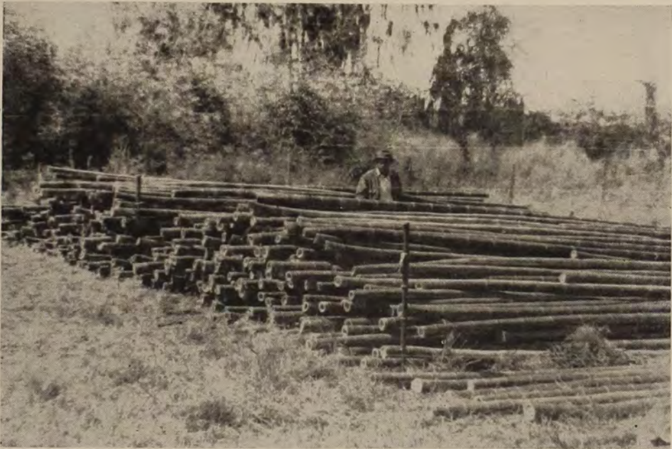
Bamboo poles cut and stacked for shipment. No pole in this lot measured less than 4" diameter at butt.

valuable plants, in the same manner as it is now supplied with a wood lot, but a suitable location must be chosen for such a planting. A rich, well-drained soil is desirable, and the two other most important factors governing the growth of bamboo are temperature and moisture.