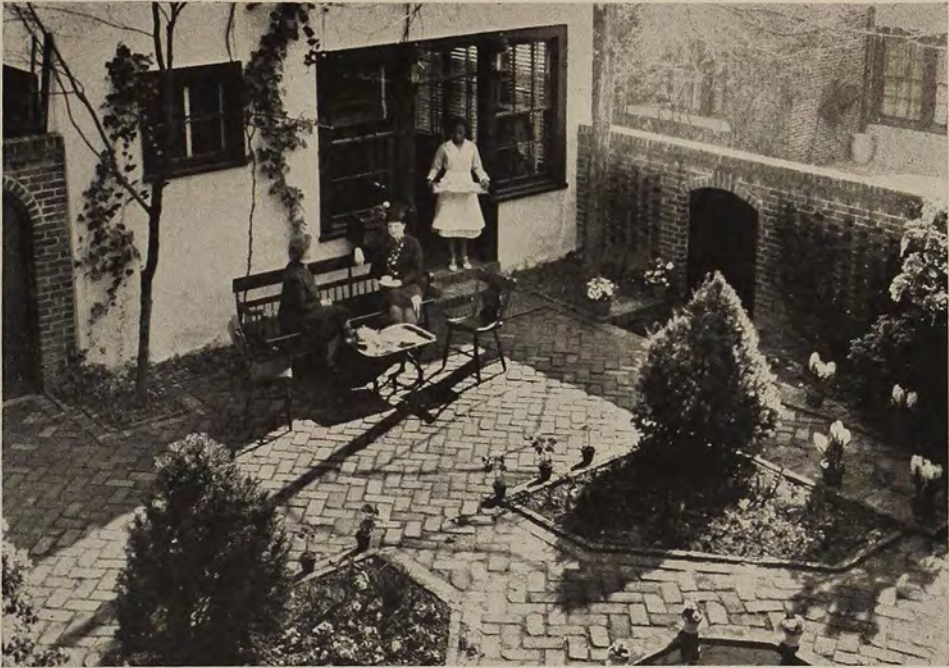
"Here plant form is frankly managed . . ."