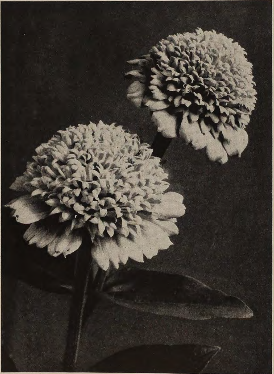
I. Horace McFarland Co.