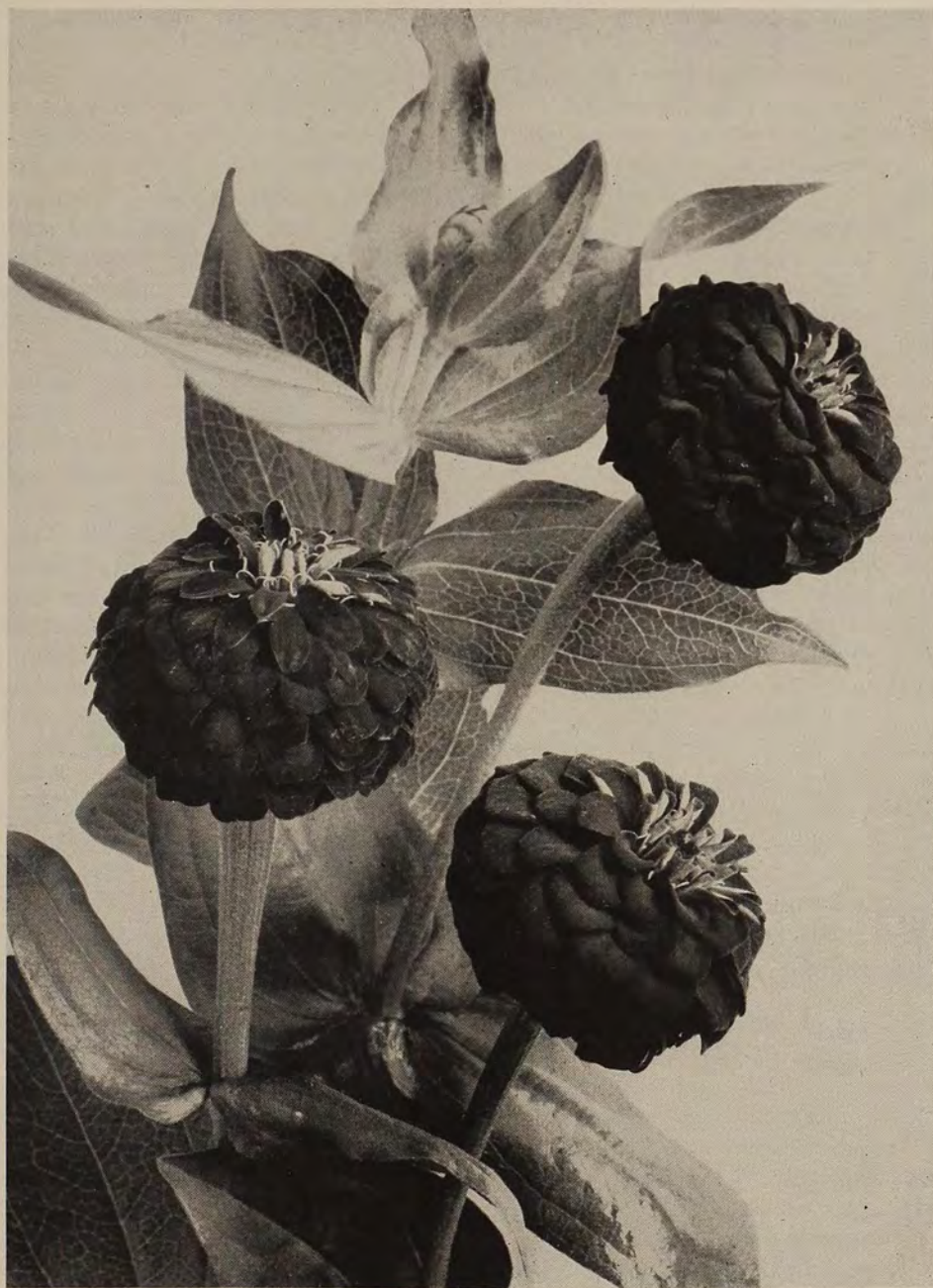
I. Horace McFarland Co.