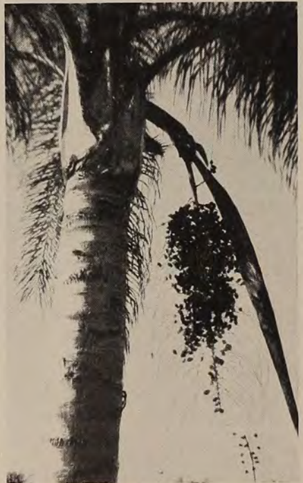
The Queen Palm, trunk leaf bases and immature fruit cluster

Arecastrum Romanzoffianum is a native of a large area in South America, ranging from the southern part of the state of Bahia in north-central Brazil, throughout the central and southern parts of that great nation, all of Paraguay and Uruguay, and much of northern Argentina. In Brazil it is known