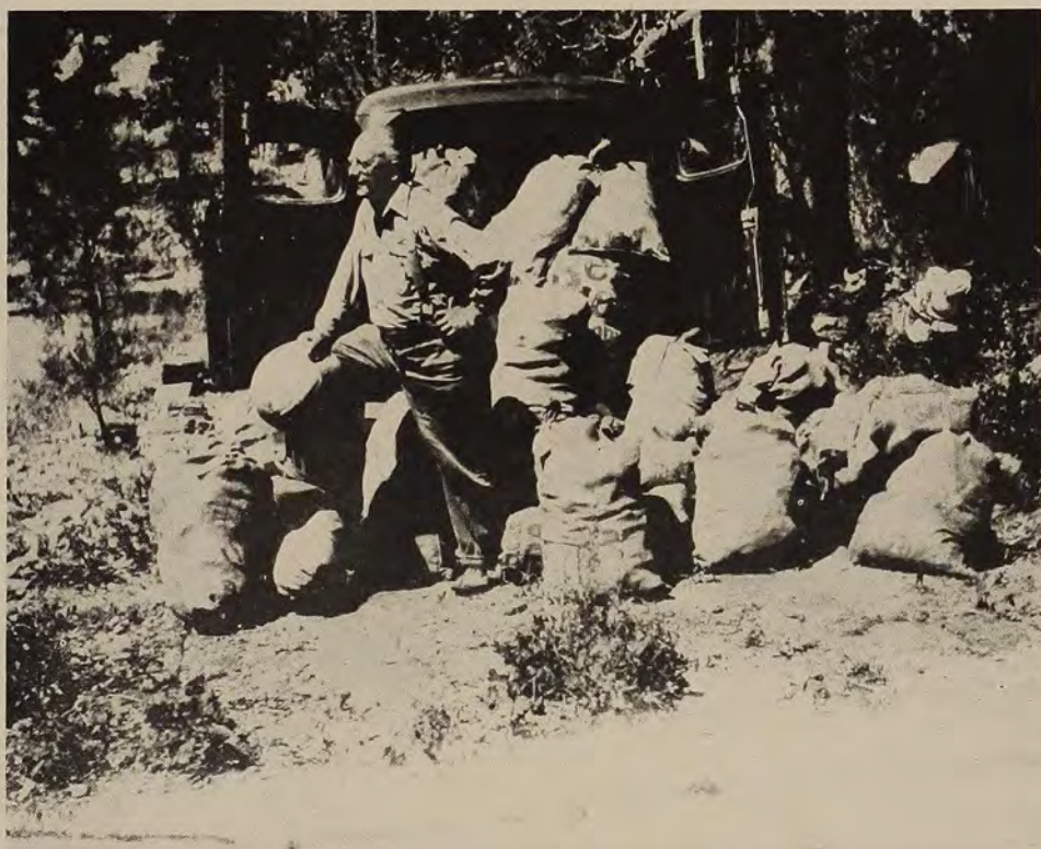
Percy Train collecting samples for analysis of Indian medicinal plants in Nevada.

utensils. Even yet, the Ecuadorean and Chilean Indians employ plant dyes to produce brilliantly colored textiles. The examples could be multiplied endlessly. But without immediate and adequate measures most of these plant secrets will be lost irretrievably.