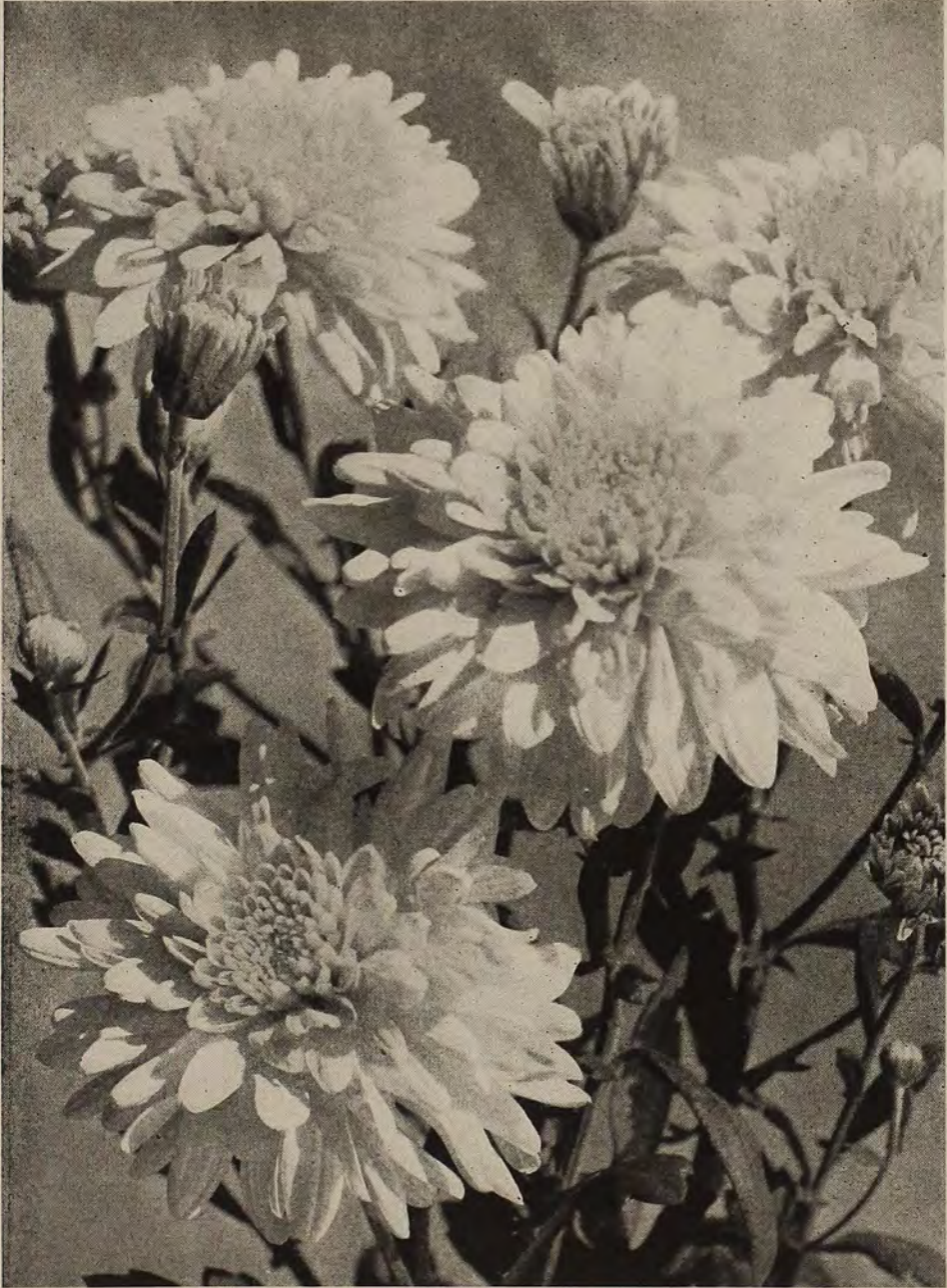
New Korean-Nipponicum Hybrid