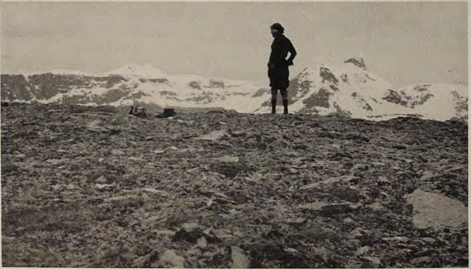
July 17. Looking east down over the valley of the south fork of the Nelson River