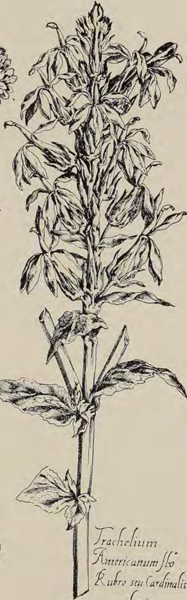
Trachelium Americanum flo Rubro seu Cardinalis planta