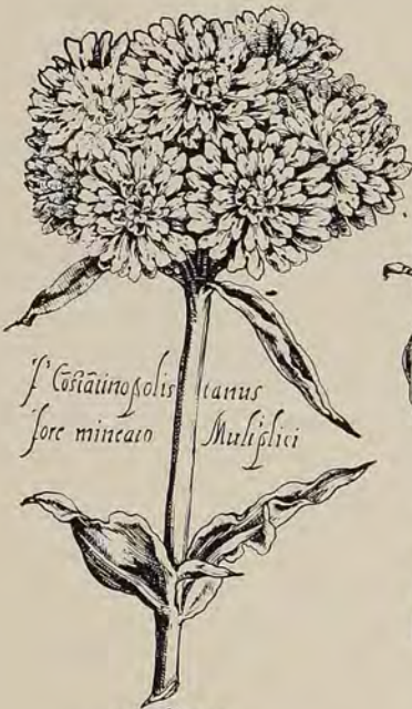
Cyanus Costantinopolis fore mincero Mulglici