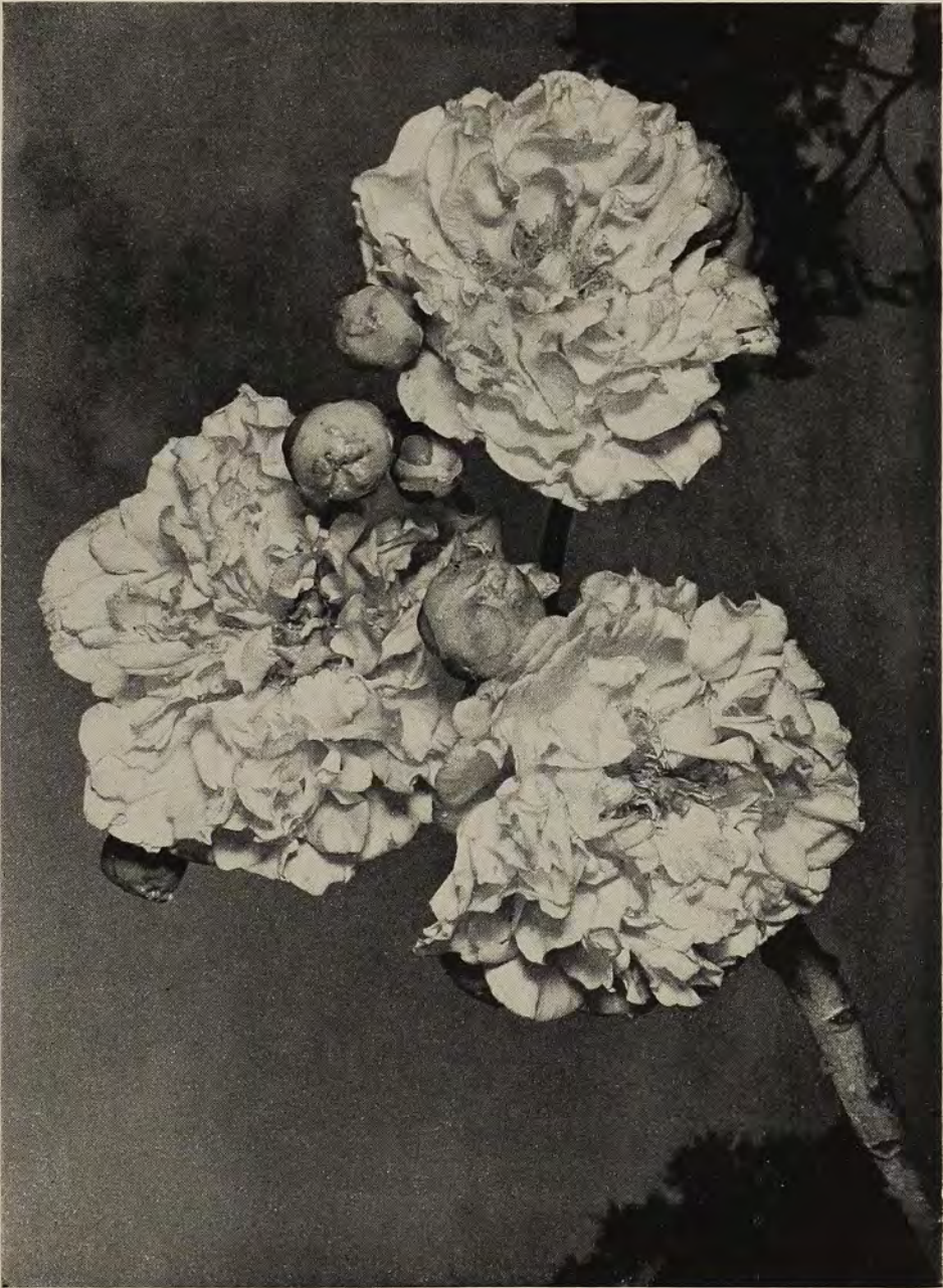
Cochlospermum vitifolium (double-flowered form) Blossoms 5 inches across, in clusters up to 30. Round buds get 1½" in diameter before opening. Color bright buttercup yellow

ginning to burst open as the new leaves come out in June.