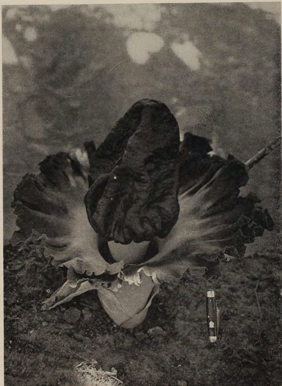
Amorphophallus campanulatus : Twenty-four hours after the bud is well above ground it opens and measures 16 inches in height and 17 inches across

In the Autumn the leaf dies and the tuber remains dormant through the critical Winter and early Spring periods. Nothing has been found in the