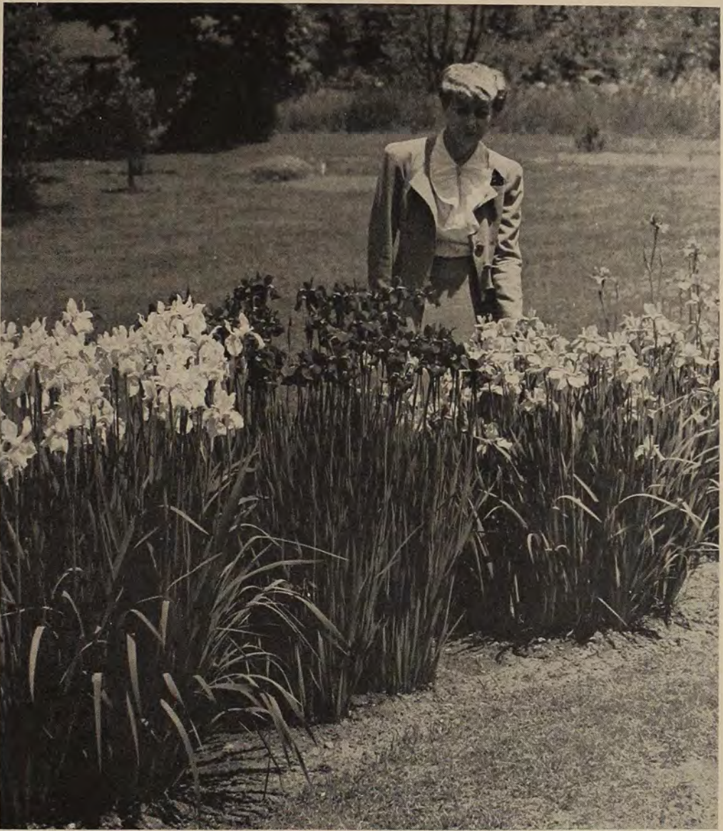
Well grown plants of Siberian Iris.