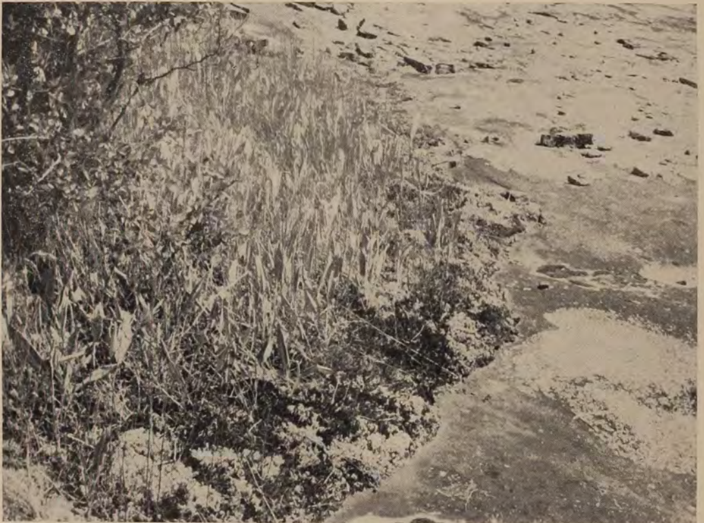
Gray foliage of Senecio tomentosa