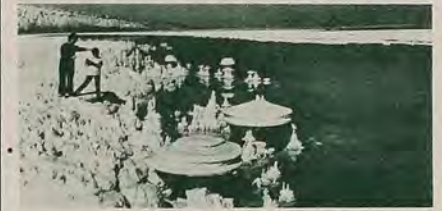
The Dead Sea—Israel

All members of the American Horticultural Society are eligible to participate in these exclusively designed explorations. The arrangements are high-quality, with first-class hotels, most meals and tips included. Besides public and private gardens, visits to diversified nurseries are included.