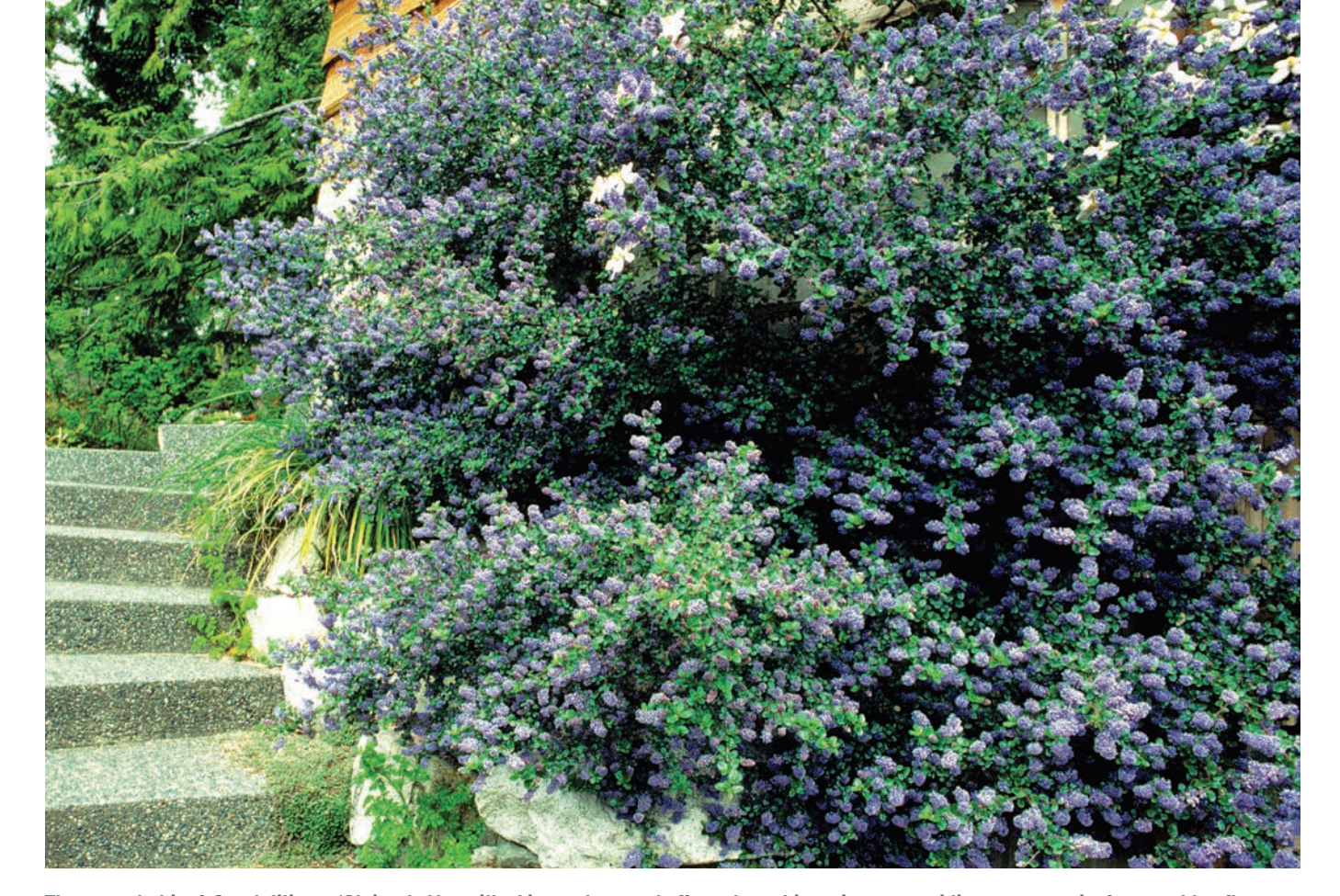
The rangy habit of C. × delilianus 'Gloire de Versailles' is used to good effect along this stairway, providing access to its fragrant blue flowers.

of fungal organisms." When you combine moisture with heat, Fross adds, the plants become extremely vulnerable to soil fungi.