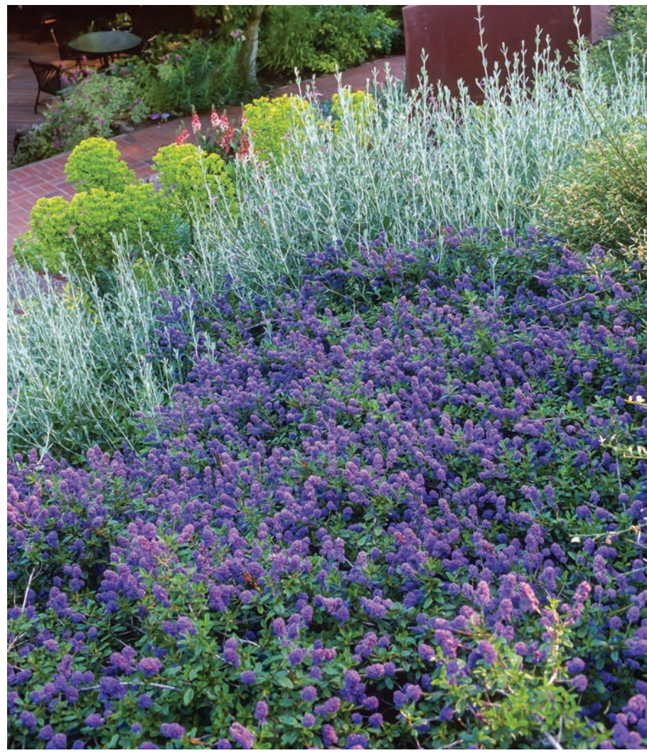
Ceanothus come in a range of habits, from shrubby or treelike 'Concha', top, to the groundcovering 'Yankee Point', above, shown in a hillside garden designed by Suzanne Porter.