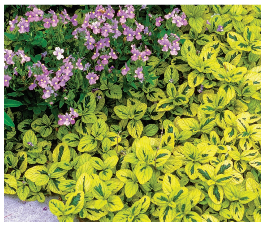
Growing to only a foot tall, 'Diamond Heights'—shown here paired with blue-flowering nemesia—forms a dense groundcover with chartreuse and green variegated leaves.

Parry's ceanothus (Ceanothus parryi) is native to chaparral, evergreen forests, and redwood forests on coastal mountains from Northern California into west-central Oregon. Deep blue flowers appear in