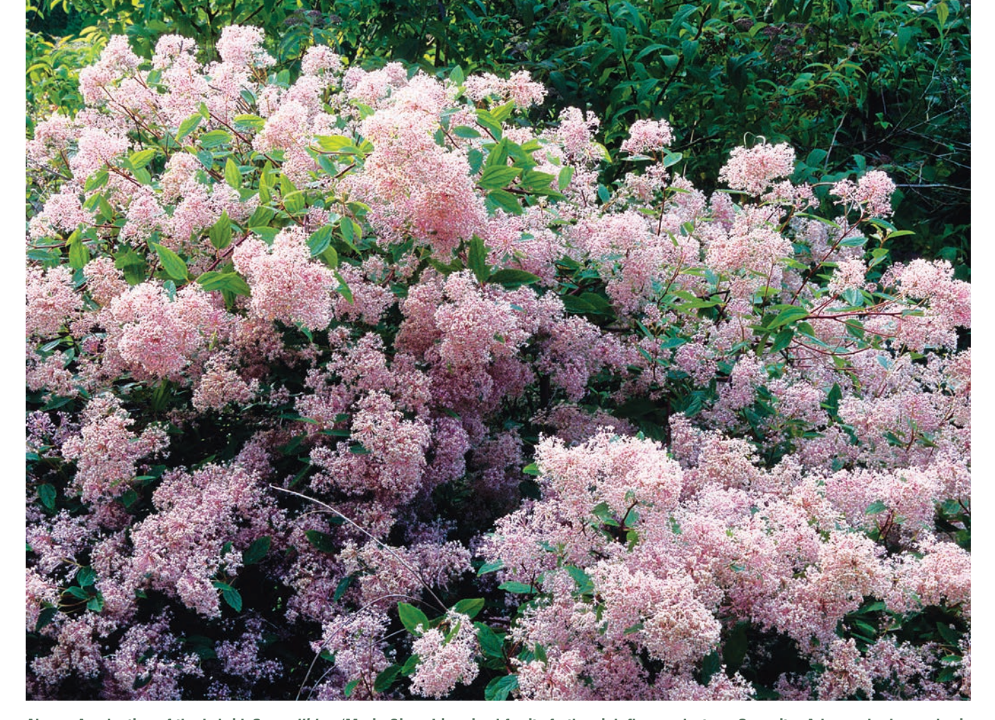
Above: A selection of the hybrid C. xpallidus, 'Marie Simon' is prized for its frothy pink flower clusters. Opposite: A large shrub popular in California coastal gardens, 'Dark Star' has rosy pink flower buds that open into cerulean blue flowerheads.

plant" or "thistle." However, not all members of the genus are spiny. They are commonly called ceanothus, which can be both singular or plural. Some references also list California lilac or wild lilac as common names, but this is misleading because they are not at all related to true lilacs (Syringa spp.).