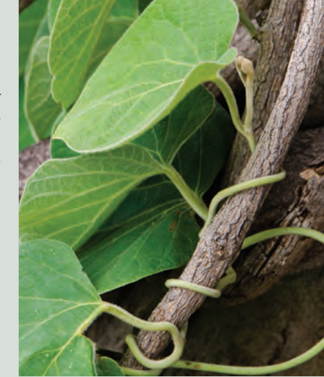
Dutchman's pipe has twining stems.

Clinging stem vines have short, but vigorous adventitious rootlets that can burrow into supports and loop through older stems—they may need initial training to ensure they grow where you intend them to. Provide sturdy support such as a tree trunk or utility pole for these vines, which include trumpet vine ( Campsis spp.) and climbing euonymus ( Euonymus spp.). —C.O.