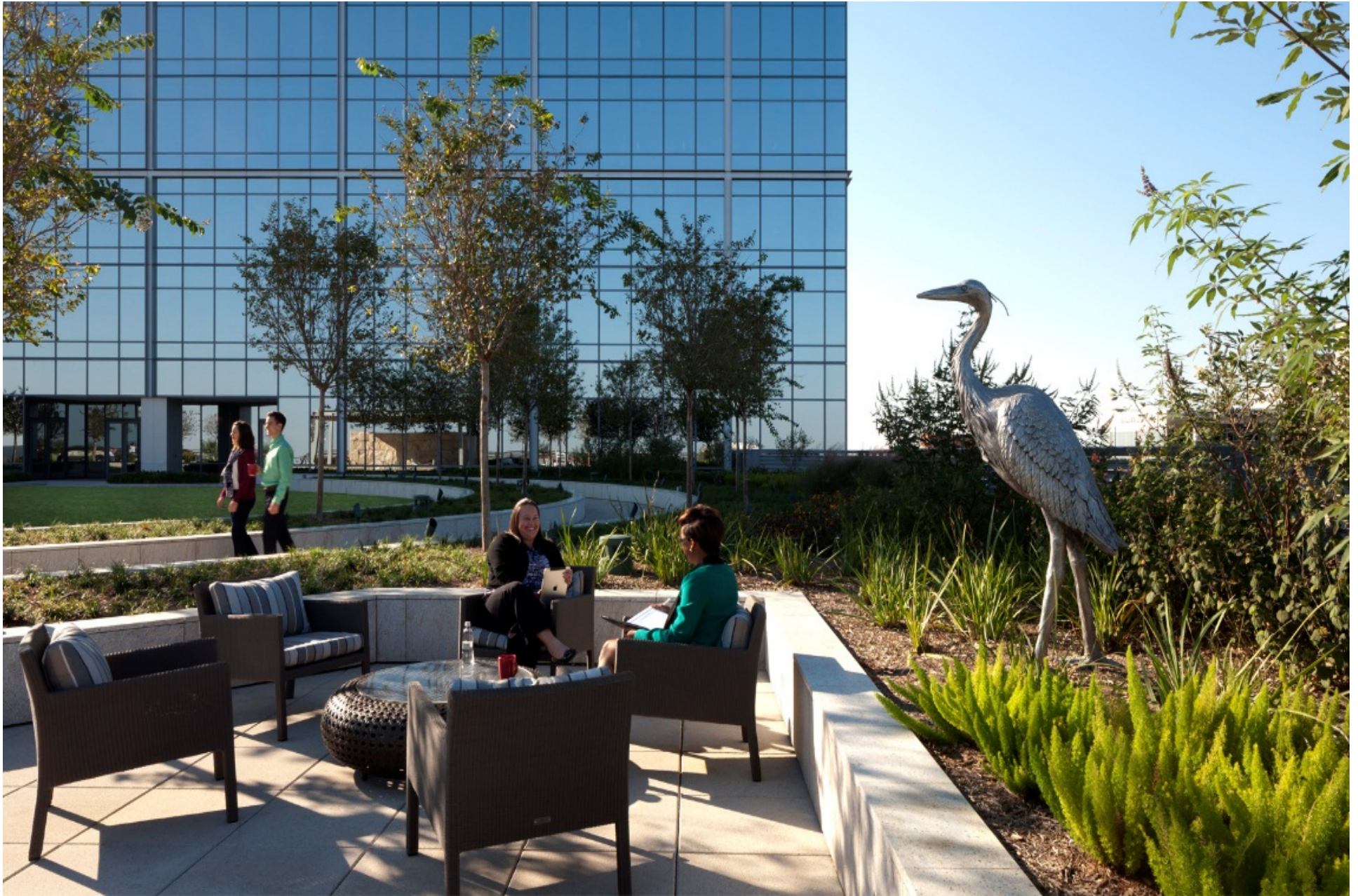
On the 11 th floor, above the garage, a green roof provides an attractive outdoor space adjacent to the conference center. The outdoor venue is used for events as well as casual meetings.