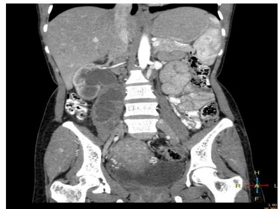
Figure 2: Contrast enhanced coronal CT section showing extent of abscess involvement. The abscess is seen extending from L2-L5 and closely abutting right PUJ and proximal ureter.

On coronal CT abscess was seen extending from L2 to L5 vertebrae closely abutting right pelviureteric junction and proximal ureter. These findings confirmed diagnosis of right psoas abscess.