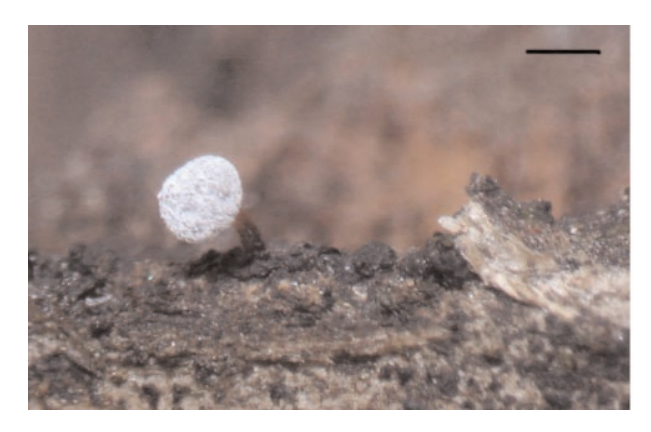
Figure 1. Stereomicroscopic image of the sporangium of Badhamia gracilis.