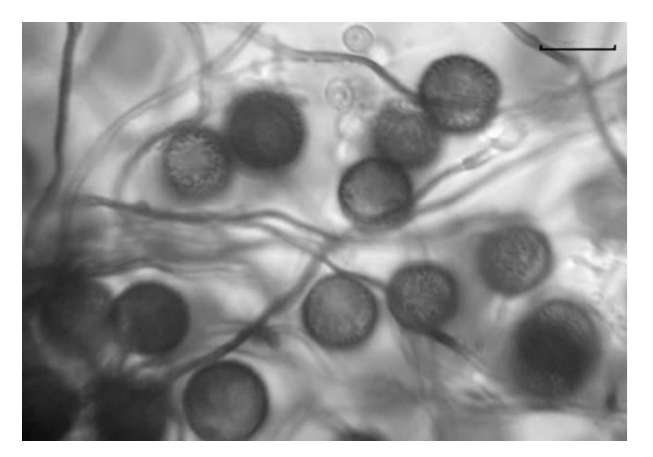
Figure 3. A view of capillitium and spores of Diderma crustaceum.

inner peridium, a prominent subglobose columella and small, dark, strongly but sparsely warted spores mostly 10-12 µm in diameter. D. spumarioides is characterised by very conspicuous limy hypothallus in which the sporangia may be deeply imbedded, with a rough, chalky outer peridium, closely oppressed to the membranous, dull grey inner peridium, a flat, pulvinate, often coloured columella and minutely warted, pale spores mostly 8-11 µm in diameter. Our specimen is characterised by a very conspicuous limy hypothallus, with the sporangia superficial or only slightly imbedded in it, with smooth, chalky outer walls remote from the iridescent blue inner peridium, a small, globose or clavate columella that is often lacking and large, dark spiny, sometimes subreticulate spores mostly 14-15 µm in diameter. Prematurely dried specimens of D. spumarioides may appear to have widely separated peridia.