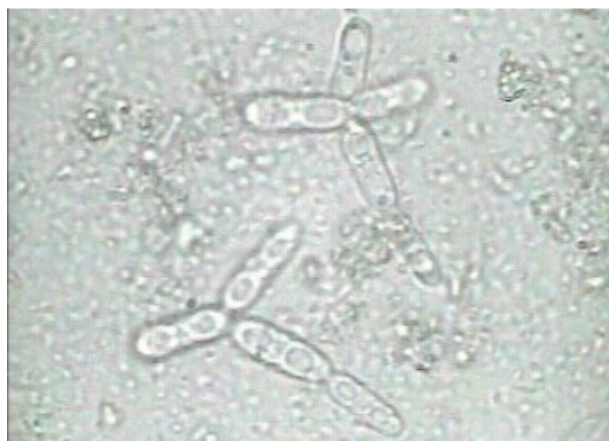
Figure 1. Photomicrograph represented unicellular hyaline arthroconidia in fecal material ( \times 400 ).