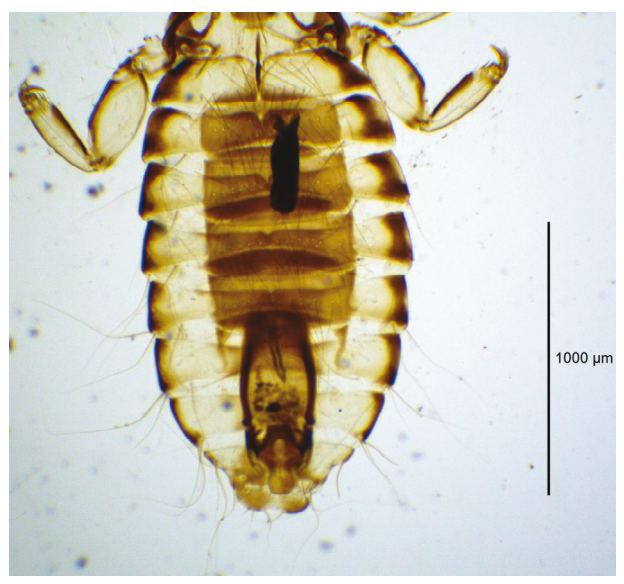
Figure 5. Cuclotogaster heterographus, male genitalia, original.

the Eurasian Woodcock, P. silvicultrix from the Common Redstart (Phoenicurus phoenicurus), P. longuliceps from the Cetti's Warbler (Cettia cetti), B. iliaci from the Redwing, P. pikulai from the Barred Warbler (Sylvia nisoria), Brueelia sp. (N) and Penenirmus sp. (N) from the Black-headed Bunting, and C. latifrons from the Common Cuckoo ( Cuculus canorus ) are reported for the first time in Turkey. The Common Moorhen (Gallinula chloropus), Macqueen's Bustard (Chlamydotis macquenii), Eurasian Woodcock, Redwing (Turdus iliacus), and Tawny Owl (Strix aluco) were examined for lice for the first time in Turkey in this study. The Eurasian Woodcock had 2 louse species and Redwing had 1 louse species, while the others had no louse infestation. These lice are therefore new records for Turkey. Thus, C. heterogarphus was determined for the first time anywhere in the world on turkeys.