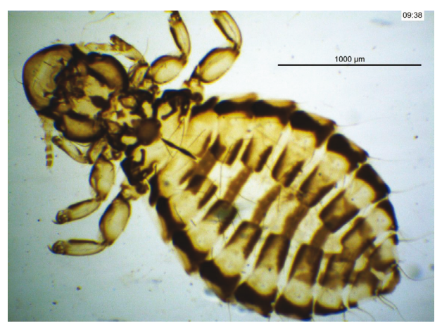
Figure 3. Cuclotogaster heterographus, female, original.

In conclusion, 25 lice species were recorded on birds in this study. R. helvolus and Saemundssonia sp. (N) from