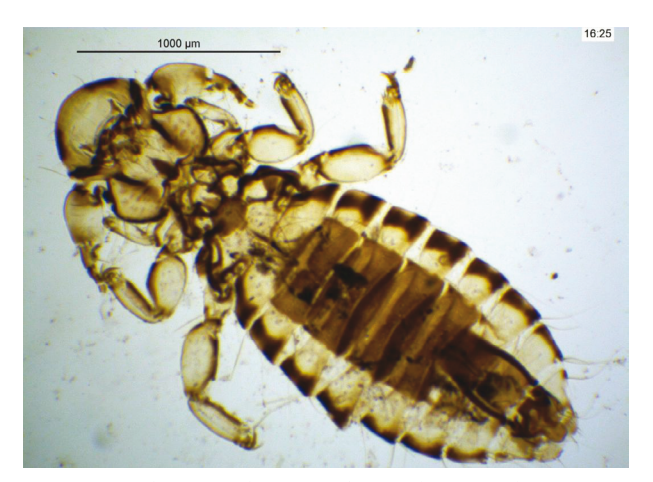
Figure 4. Cuclotogaster heterographus, male, original.