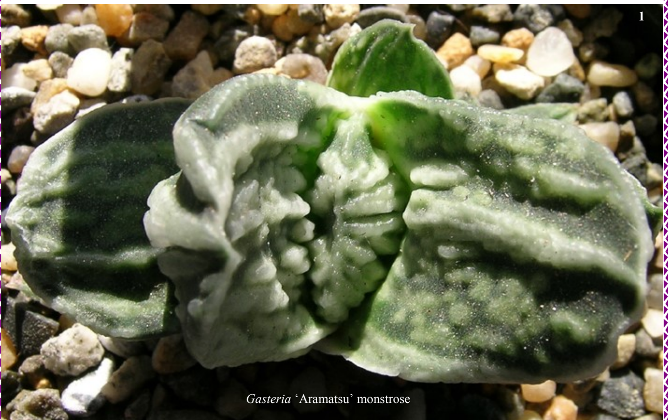
Gasteria 'Aramatsu' monstrose