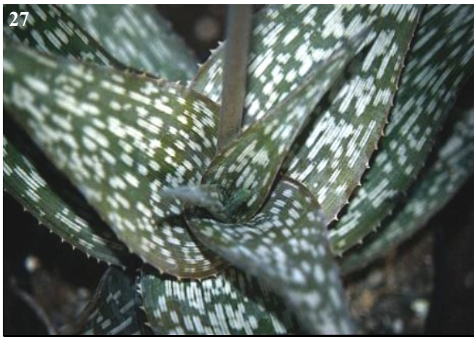
Aloe 'Hardy's Dream' ISI 1996-26

closed rosette but one grown with consideration will have an open rosette. Propagation is by offsets.