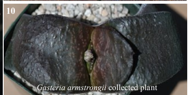
Gasteria armstrongii collected plant