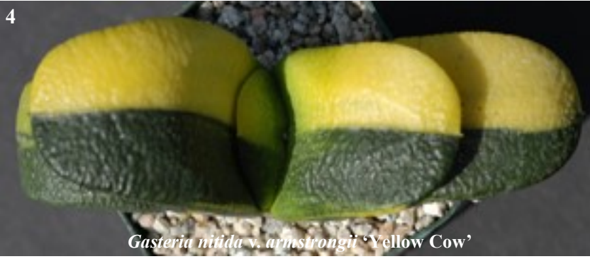
Gasteria nitida v. armstrongii 'Yellow Cow'