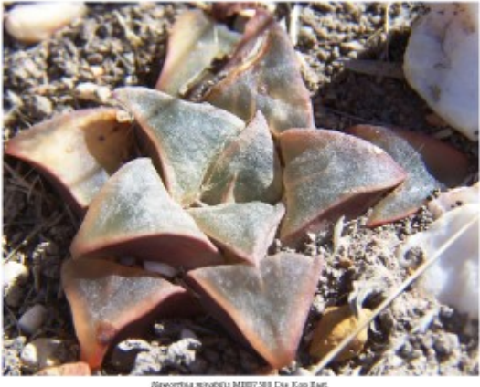
Haworthia mirabilis MBB7388 Die Kap East.