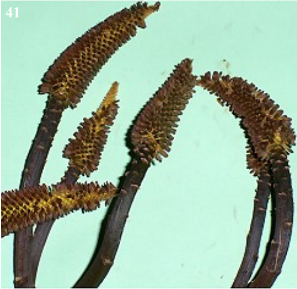
Fig. 41. Buds of the unidentified Aloe , May-July 2006, Manica