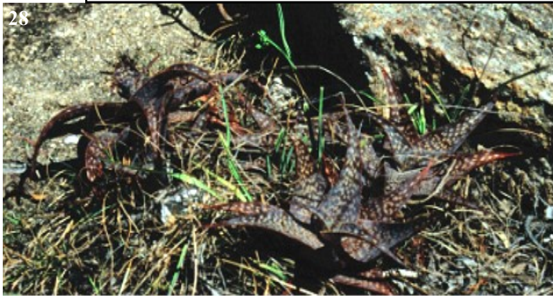
Aloe 'Hardy's Dream' growing SW of Tolaniaro