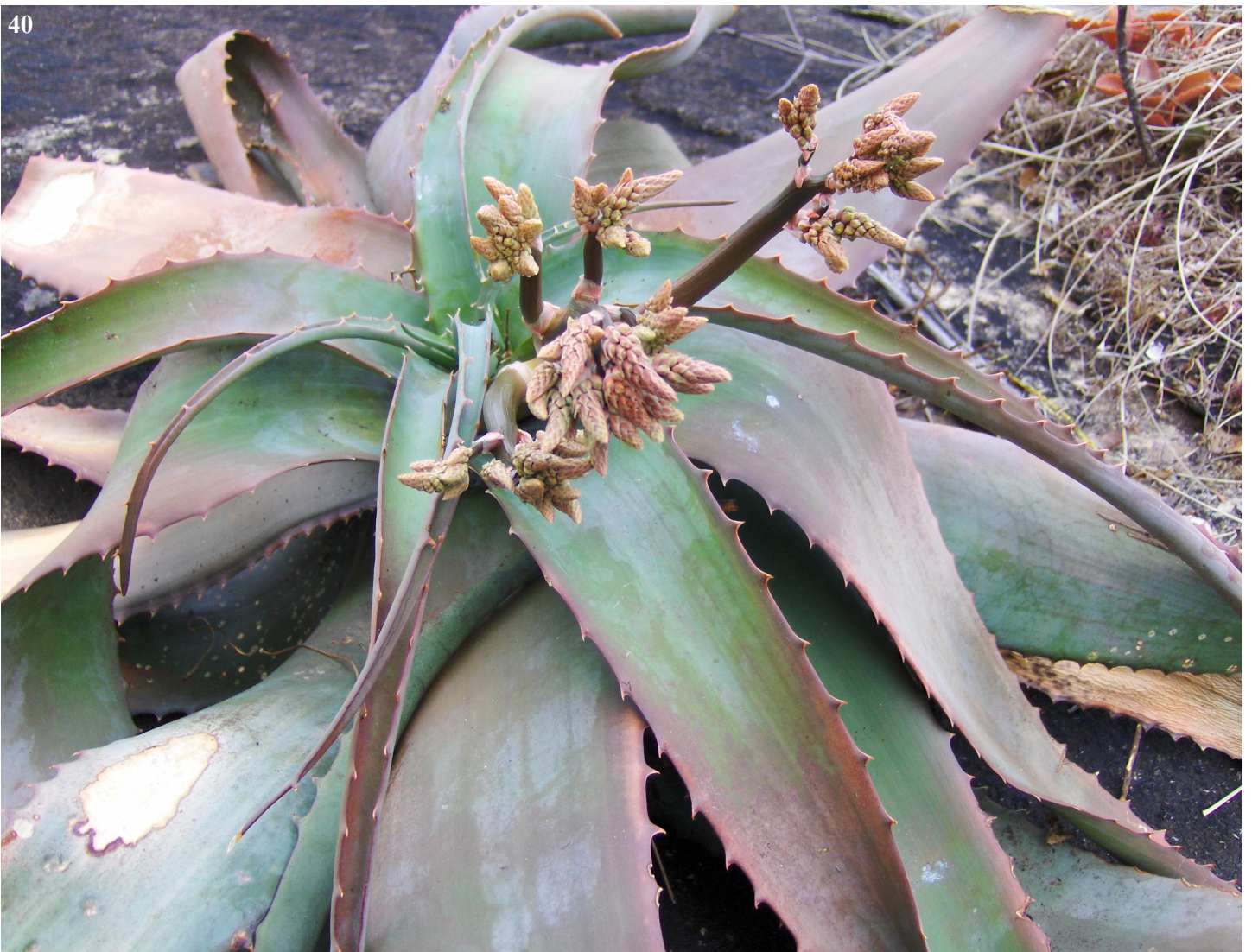
Fig. 40: plant with intensely branched inflorescence.

Fig. 38: rosette with long, glaucous leaves growing in a spiral.