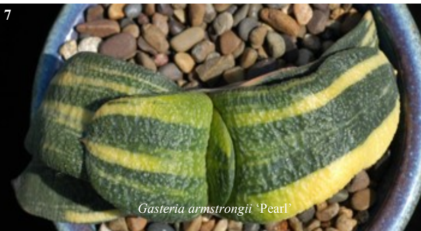
Gasteria armstrongii 'Pearl'