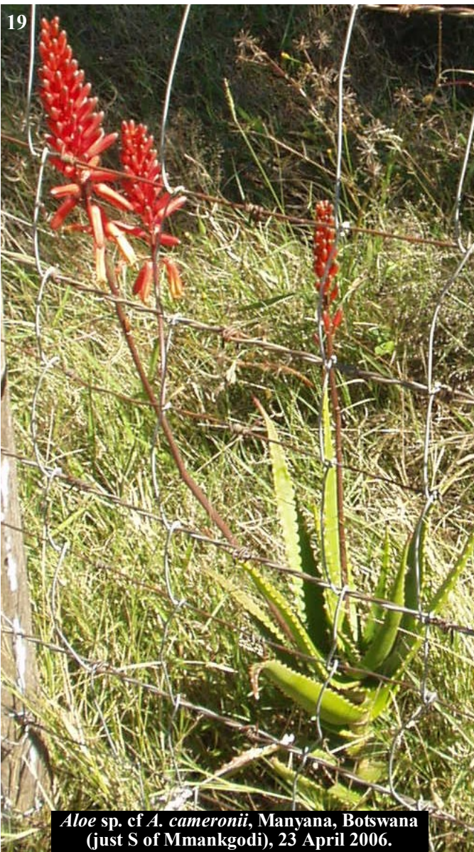
Aloe sp. cf. A. cameronii , Manyana, Botswana (just S of Mmankgodi), 23 April 2006.