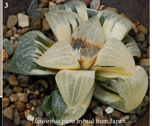
Haworthia picta hybrid from Japan.