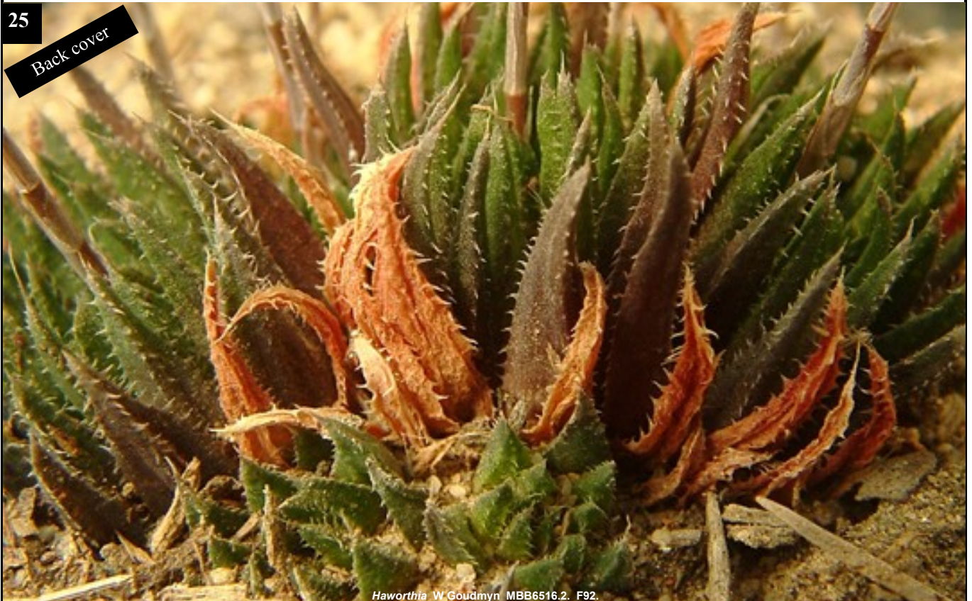
Haworthia W Goudmyn MBB6516.2. F92.