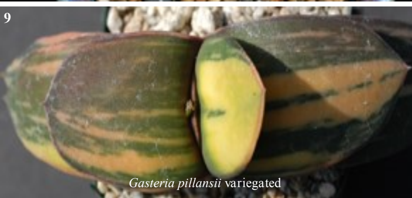
Gasteria pillansii variegated