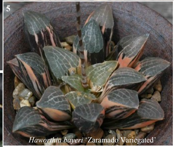
Haworthia bayeri 'Zaramado Variegated'