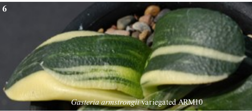
Gasteria armstrongii variegated ARM10