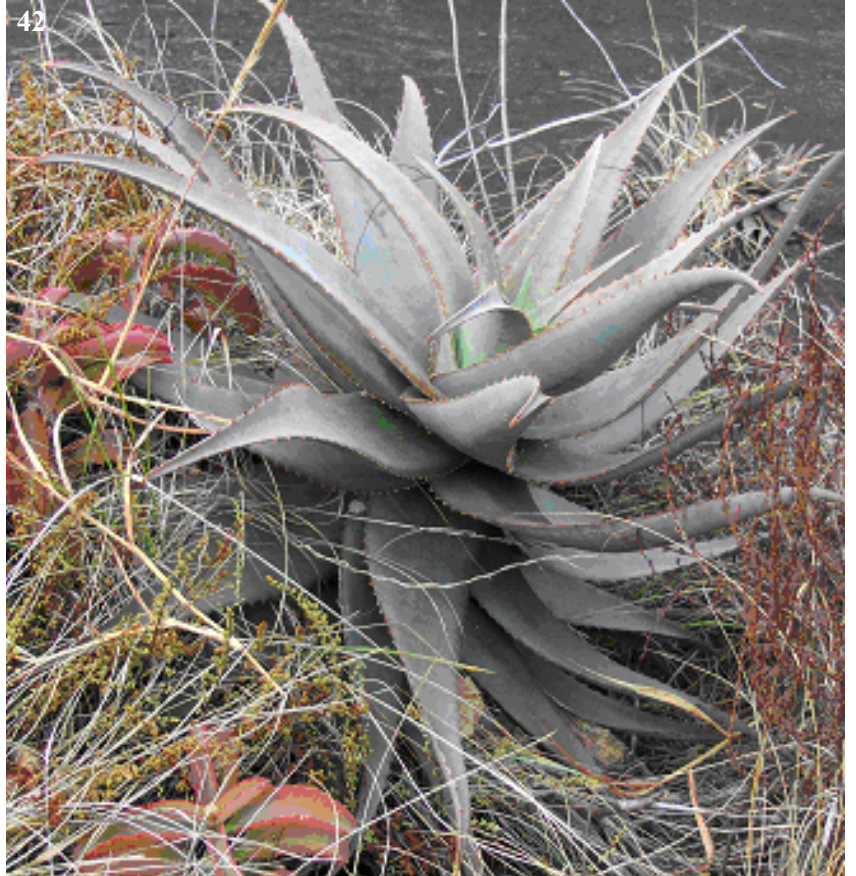
Figures 42 & 43. Examples of Aloe chabaudii vegetative variation on the lower mountain.