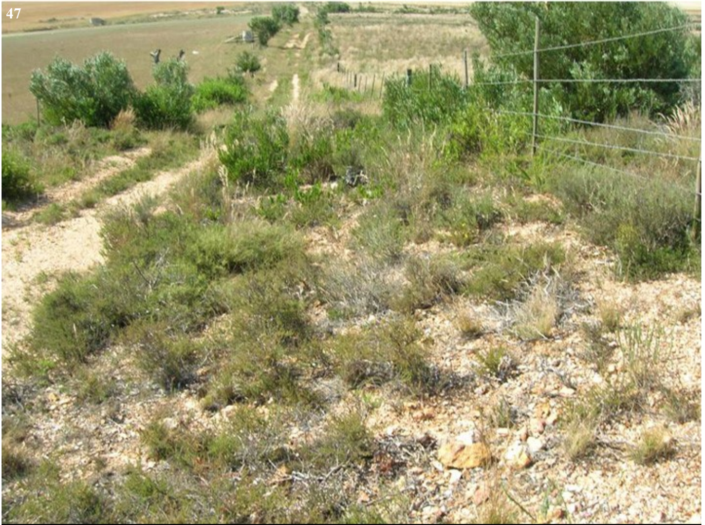
The habitat of Haworthia mertonii where the one surviving plant was found on the bank. The main population had been over the fence in a rocky outcrop covered with bushes. The surrounding area is mainly agricultural land devoted to Marino sheep and grain crops.