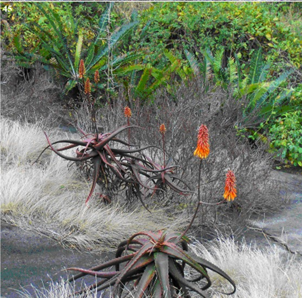
Figure 44 &amp; 45.

Examples of colours and different forms of inflorescences of Aloe cameronii growing on the lower slopes of the mountain.