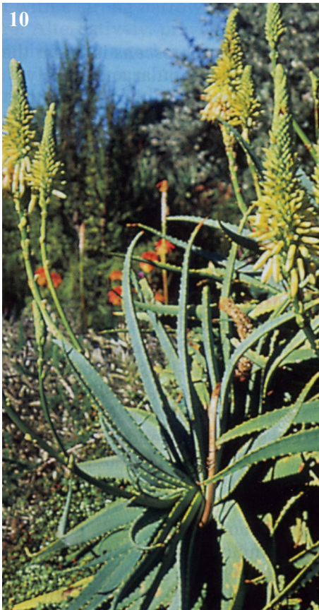
Aloe arborescens 'Eloff'