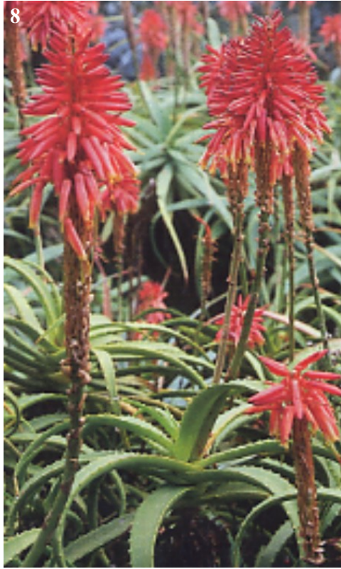
2. Aloe arborescens 'Compton'