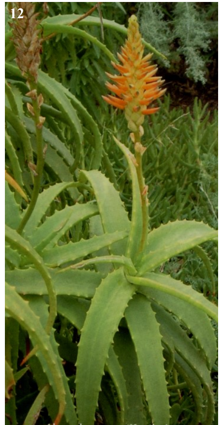
Aloe arborescens 'Huntley'