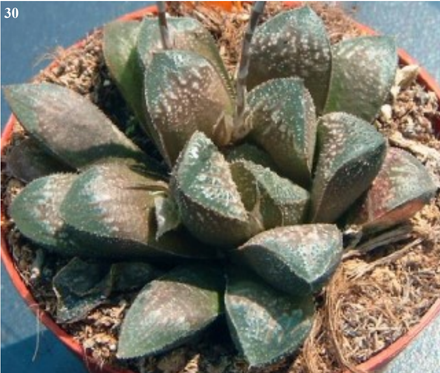
H. truncata x H. maughanii x H. mirabilis v. paradoxa