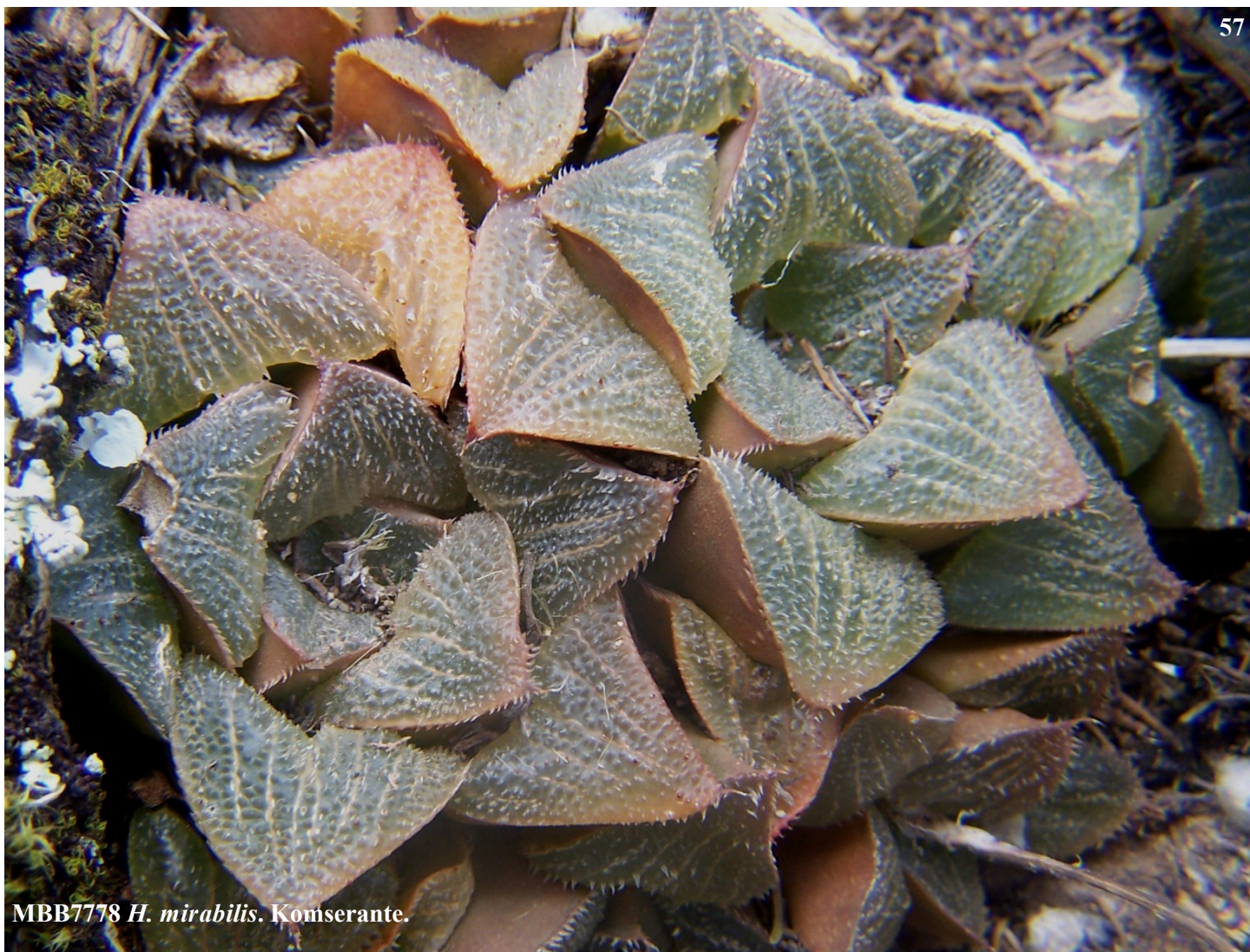
MBB7778 H. mirabilis . Komserante.