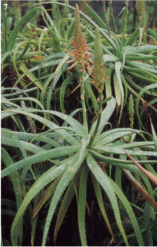
Aloe arborescens 'Pearson'