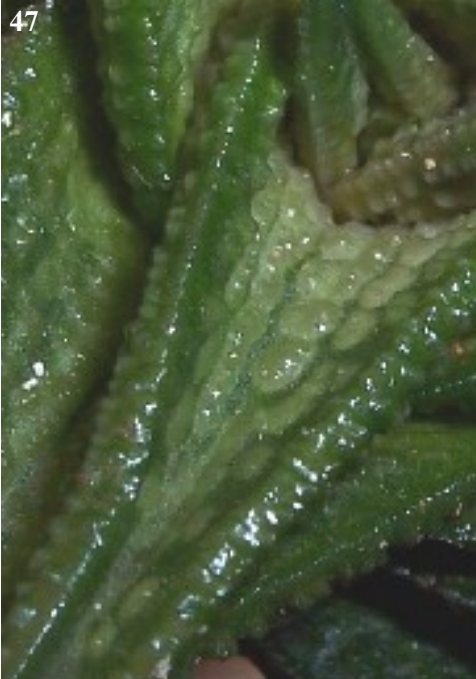
Leaf details of Haworthia 'Malachite'