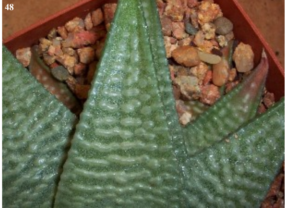
Leaf details of Haworthia 'Delight'