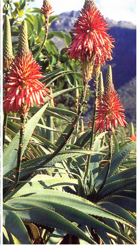
Aloe arborescens 'Rycroft'