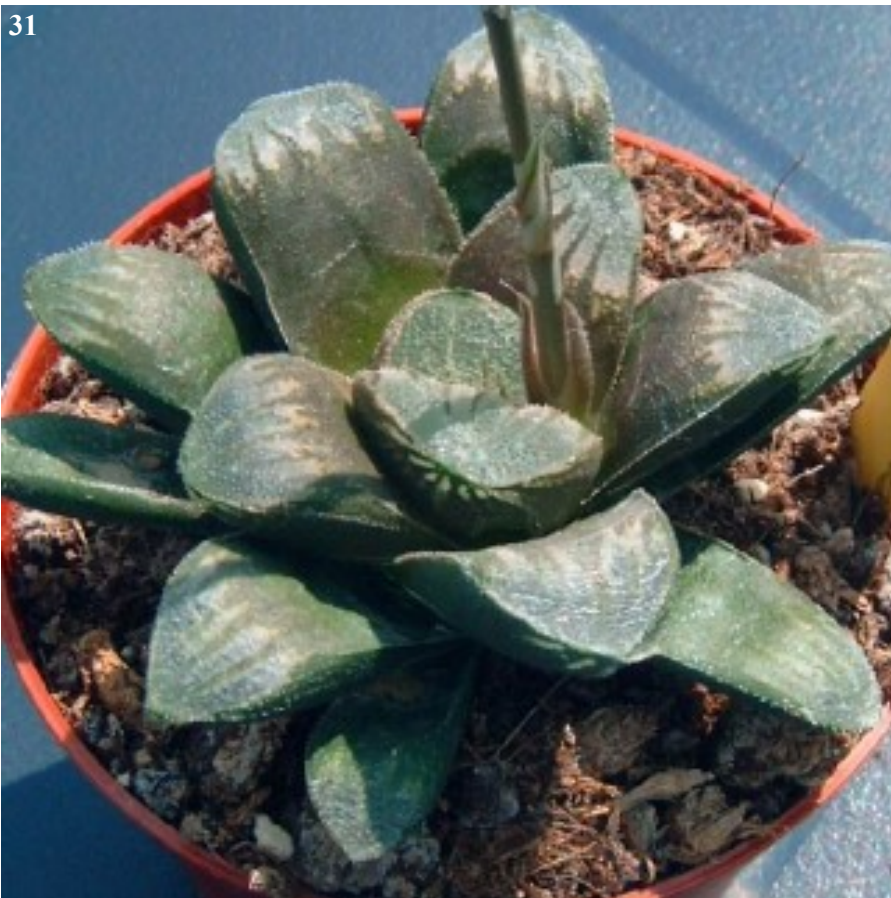
H. truncata x H. maughanii x H. pygmaea

The illustrations show four plants in my collection which I have obtained from friends. The information I received with them was limited, partly because my friends had received some of them from their friends, etc. They are outstanding plants