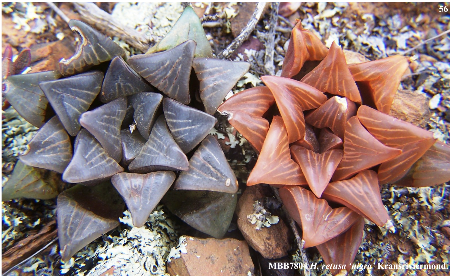
MBB7804 H. retusa 'nigra' Kransci Sermond.