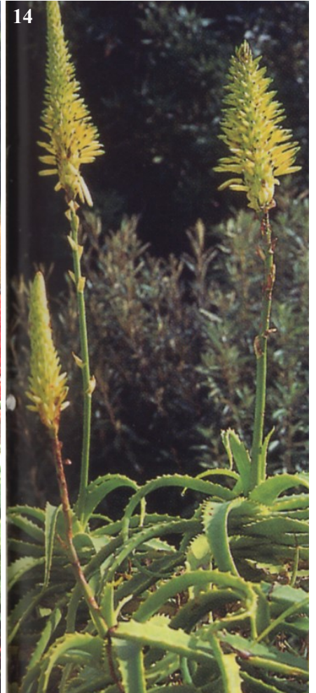
Aloe arborescens 'Jack Marais'