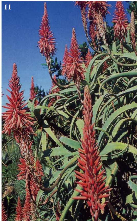
Aloe arborescens 'Mathews'