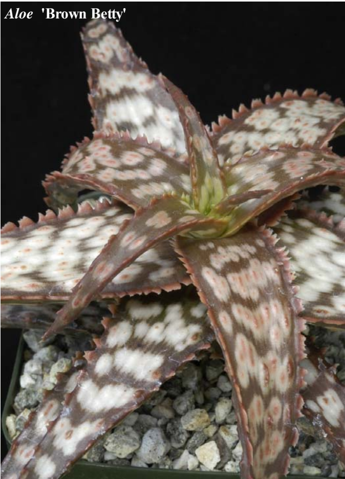
Aloe 'Brown Betty'