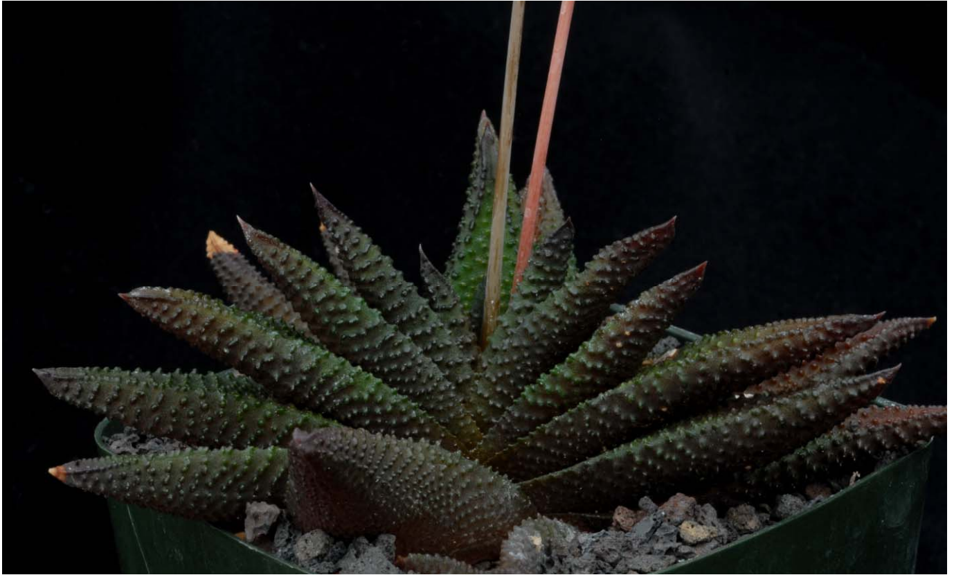
Haworthia 'Three-Cornered-Hat.