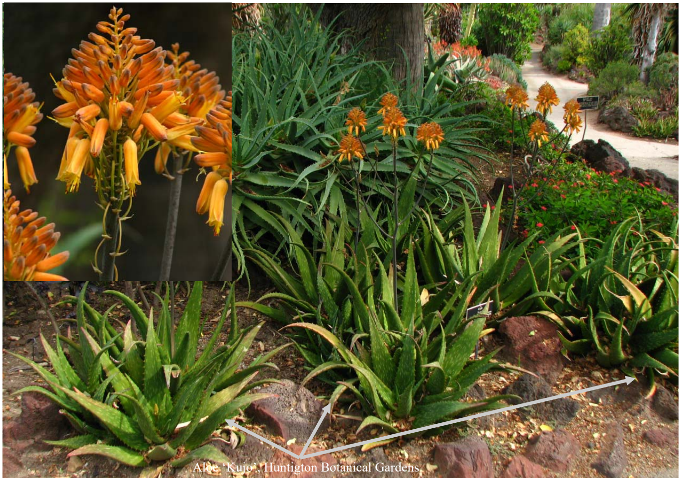
Aloe 'Kujo', Huntingdon Botanical Gardens