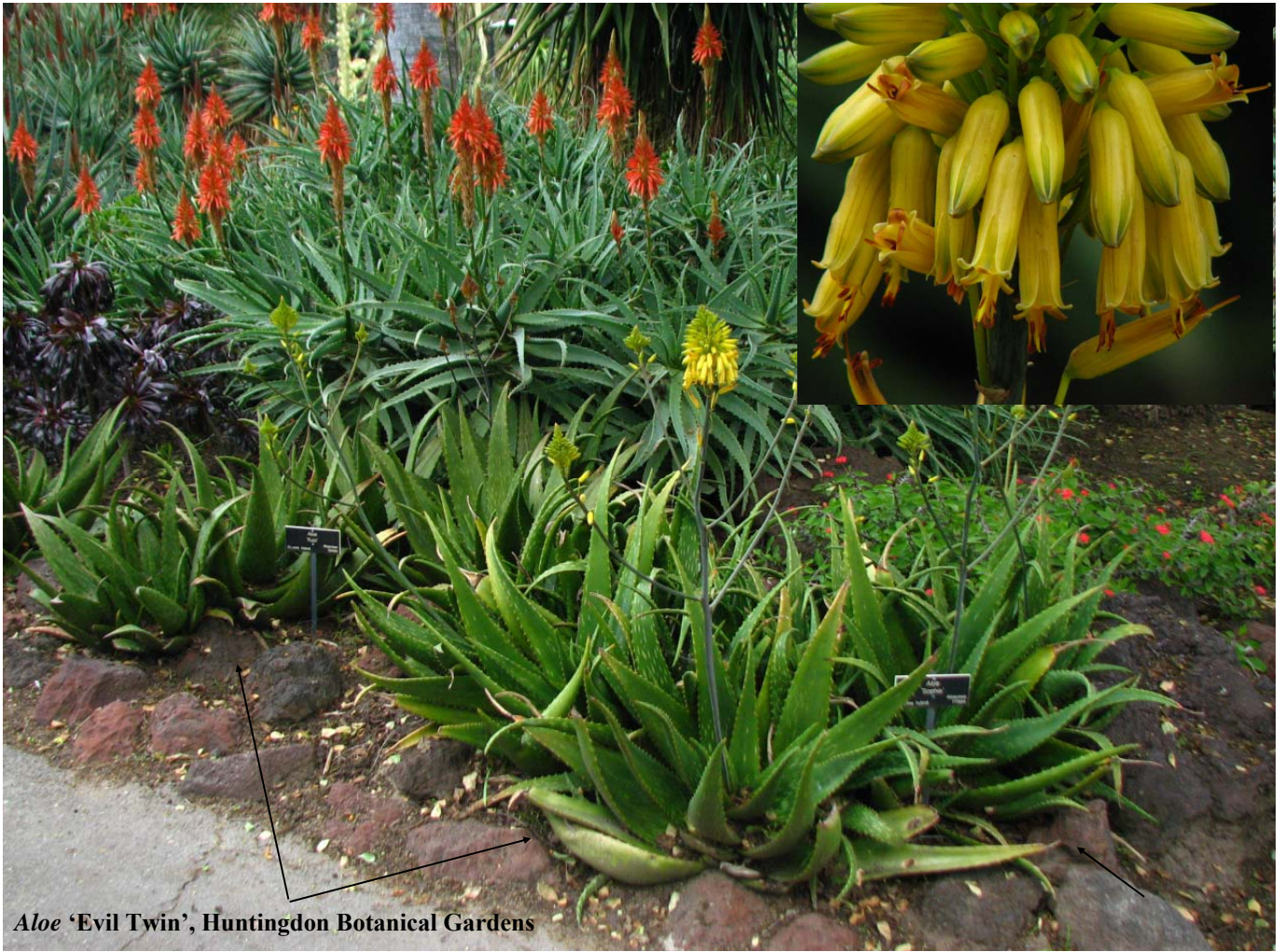
Aloe 'Evil Twin', Huntingdon Botanical Gardens