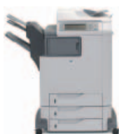
HP Color LaserJet 4730xm mfp

The HP Color LaserJet 4730mfp is perfect for mid-volume workgroups (from 6 – 15 users) in enterprise environments and workgroups (from 3 – 10 users) in small and medium businesses with IT management, that print A4 documents in mono and colour and need the benefits of multiple functionality to enhance their productivity.