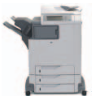
HP Color LaserJet 4730xs mfp