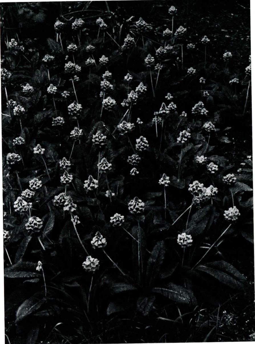
Primula nutans -