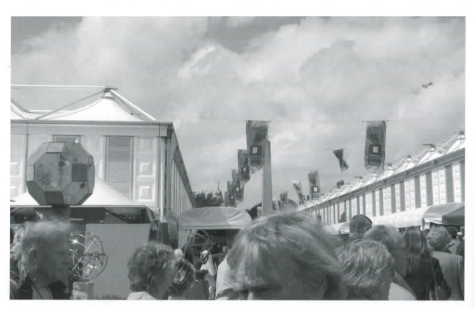
It's easy to see why the Chelsea Flower Show is truly the Olympics for our sport we call gardening, and like the Olympics, crowds are to be expected.

shocking, horrid, surprising, and inspirational, all at the same time. But by far, our biggest memory we're the crowds. Incredible Superbowl sized crowds of deeply passionate gardeners, amateurs and those just looking for pretty flowers, all moving slow like cattle, inching along wide paths out of doors, and indoors, slowly, pushy, carrying you along wherever they moved.