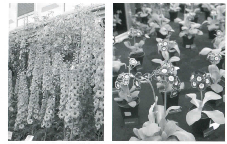
From towering mountains of Delphinium to tables of perfect Auricula, the Chelsea Flower Show offers some of the worlds best grown plants.

This is no ordinary flower show. The difference between the English gardener and the American gardener is, as we all know, intensity. Upon entering, one passes through a grand gate, and across to a wide stairway that leads down to an allee of huge elms, under which were two long rows of vendors. We both gasped at the sea of heads, silently imagining how could we ever pass though this phalanx of tweed and wellies.