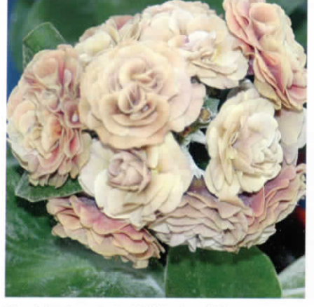
'Sandpiper' grown by K. Whorton, UK.