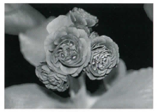
A deep violet double Primula auricula 'Fred Booley' grown by Derek Salt in the UK.

A large number of different cultivars of double forms of P. auricula have been bred over the