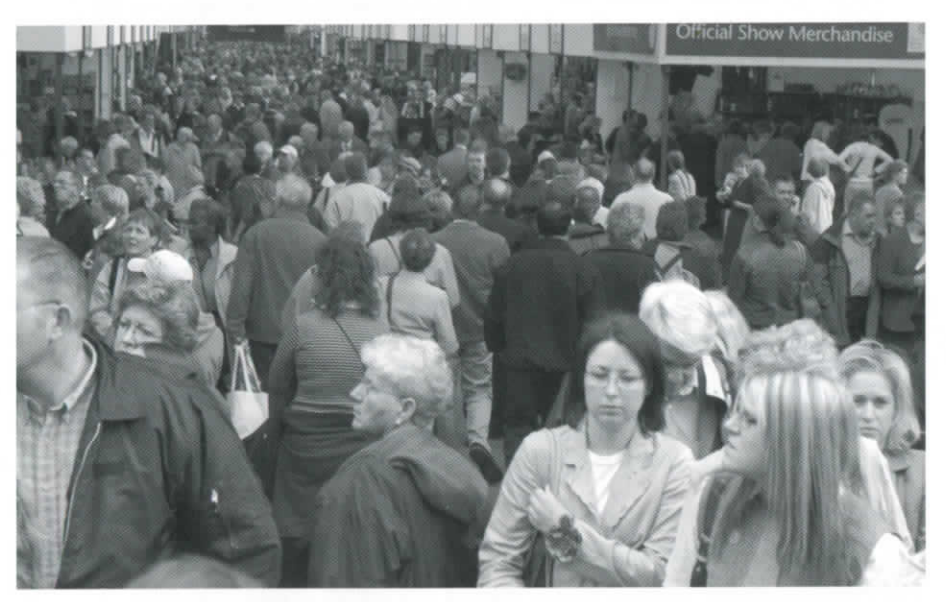
Plan on visiting the Chelsea flower show next May, but be ready to deal with as many people as there are choice plants.

I'm not much for the major flower show circuit. Like many of us, the idea of posy pushers and the requisite stalls of retailers pitching dyed eucalyptus interests me as much as Hollywood gossip magazines. I'd rather spend my time, in the fresh cool solitude of an alpine meadow hiking ankle deep in glacial run-off, studying tiny precious spring ephemerals – but that's another story.