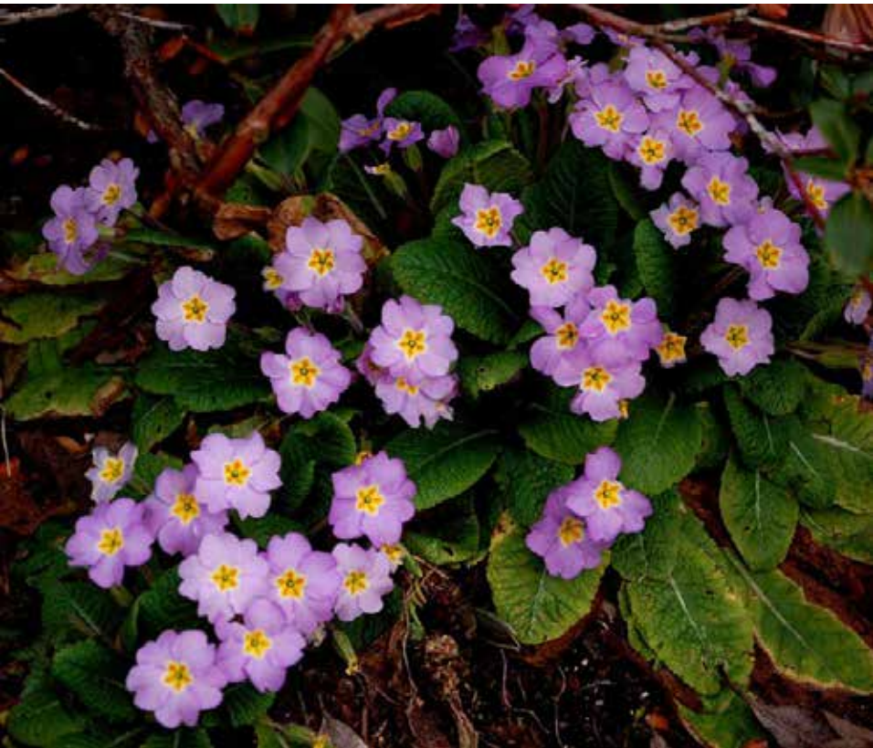
Facing page, top: Primula renifolia. Bottom: Primula juliae. This page, top: Primula grandis. Bottom: Primula sibthorpii.