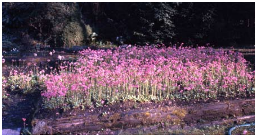
Above: the Berry garden, taken by Orvil Agee in 1961 (top) and 1962 (bottom).

Left: P. ?, grown by Rae Berry, photo taken by Orvil Agee in 1958.