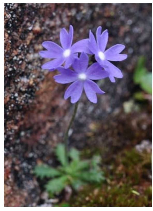
Left: Primula primulina with its "cottonball" centers