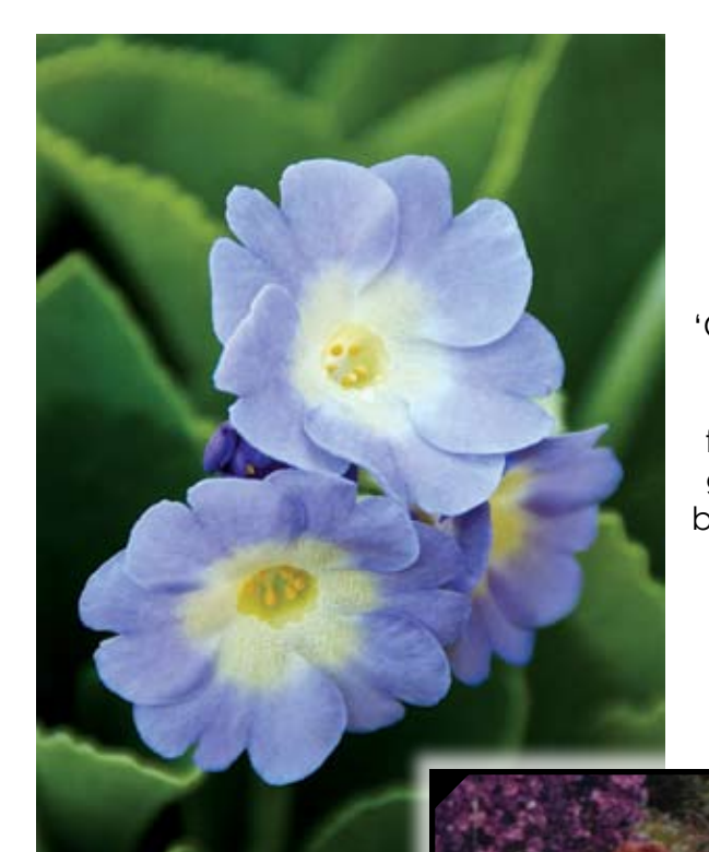
Left: 'Caroline's Blue', a lovely clear blue auricula from Caroline's garden.