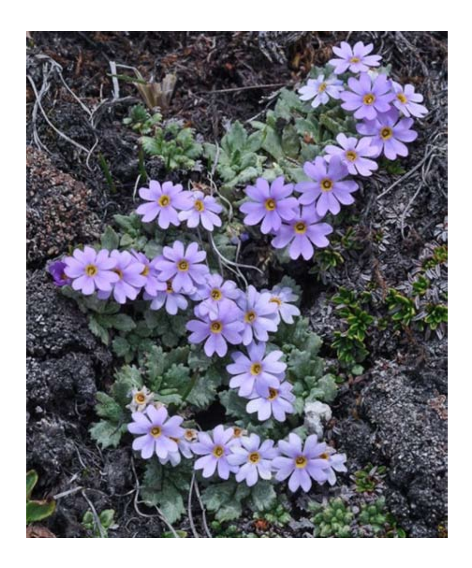
"Another nice Primula around the lake is Primula concinna, which makes very tiny rosettes, and they grow in dryer conditions on rocky slopes and crevices. The pale pink, sometimes white flowers, are almost stemless. A real beauty!"