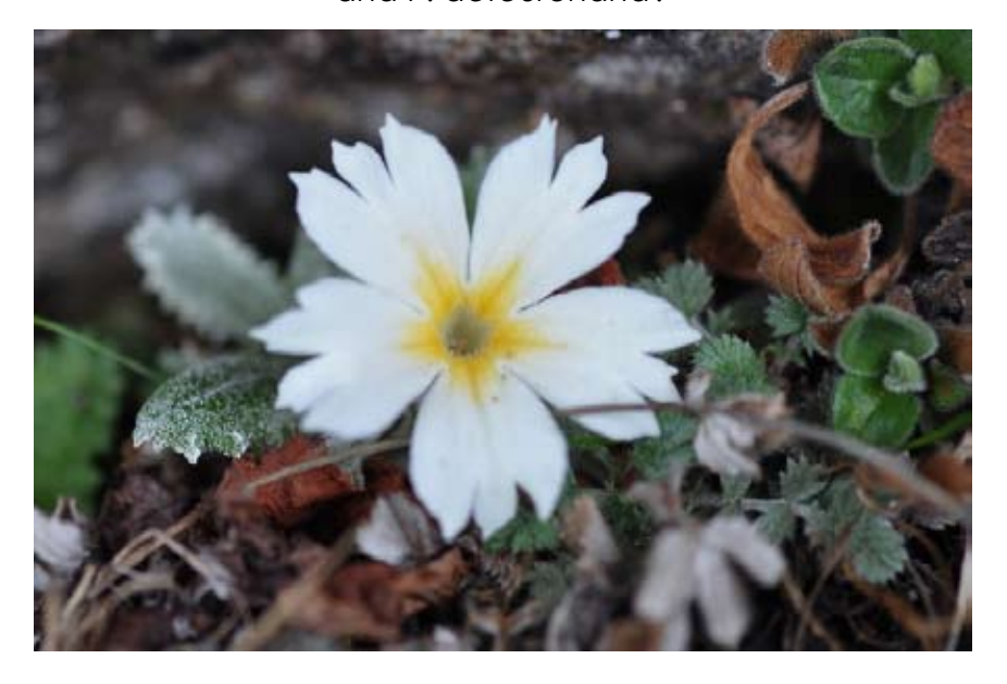
Below: Maybe a hybrid of P. aureata and P. deteuronana?