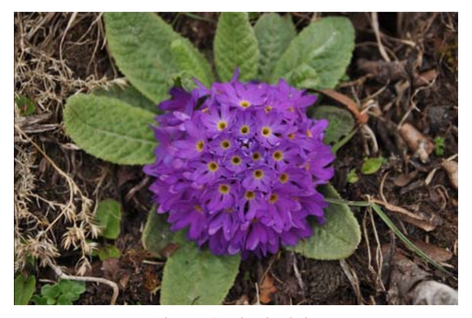
Above: P. atrodentata