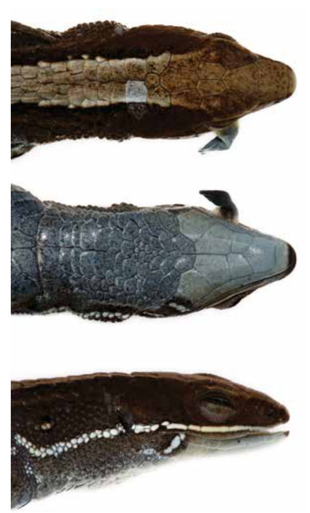
Fig. 2. Head of the holotype of Pholidobolus ulisesi sp. nov. (CORBIDI 12734) in dorsal (A), ventral (B), and lateral (C) views.

of nasal, directed lateroposteriorly, piercing nasal suture; loreal rectangular; frenocular enlarged, in contact with nasal, separating loreal from supralabials; supraoculars two, with the first being the largest; four elongate superciliaries, first one enlarged, in contact with loreal; palpebral disk divided into two pigmented scales; suboculars three, elongated and similar in size; three postoculars, ventral one smaller than the others; ear opening vertically oval, without denticulate margins; tympanum recessed into a shallow auditory meatus; mental semicircular, wider than long; postmental pentagonal, slightly wider than long, followed posteriorly by three pairs of genials, the anterior two in contact medially and the posterior one separated by postgenials; all genials in contact with infralabials; gulars imbricate, smooth, widened in two longitudinal rows; gular fold incomplete; posterior row of gulars (collar) with two enlarged scales medially, larger than the anterior gulars.