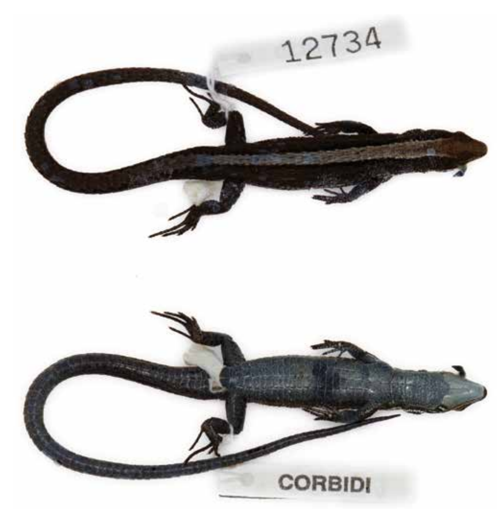
Fig. 1. Holotype of Pholidobolus ulisesi sp. nov. (CORBIDI 12734; male, SVL = 45.5 mm) in dorsal ( top ) and ventral ( bottom ) views.

A new species of Andean microteiid lizard