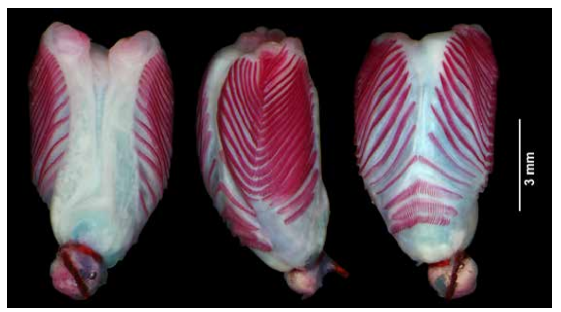
Fig. 5. Left hemipenis of Pholidobolus ulisesi sp. nov. (CORBIDI 12734 - holotype) in sulcate (left), lateral (middle), and asulcate (right) views.

Remarks: In a molecular phylogeny of Cercosaura and related taxa, Torres-Carvajal et al. (2015) showed, with high support, that Pholidobolus ulisesi ( Pholidobolus sp. in their paper) and P. hillisi are sister species. Together they form a clade sister to all other species of Pholidobolus . In addition, these authors found that both " Cercosaura " vertebralis and " Cercosaura " dicra were nested within Pholidobolus , and were therefore referred to this genus (Torres-Carvajal et al. 2015). An identical topology can be observed in a recent molecular phylogeny of the clade Cercosaurinae by Torres-Carvajal et al. (2016). Therefore, we adopt this taxonomic change in the discussion below.