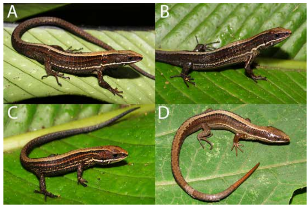
Fig. 3. Four individuals of Pholidobolus ulisesi sp. nov. in life. (A) holotype (CORBIDI 12734); (B) adult female (CORBIDI 12737); (C) juvenile (CORBIDI 12744); (D) adult male from Cañaris (photo voucher).

Variation: Variation in measurements and scutellation of Pholidobolus ulisesi is presented in Table 1. Usually two supraoculars, 2/3 (left/right) in specimen CORBI-DI 12742; superciliaries usually four, 3/4 in CORBIDI 12749, 6/5 in CORBIDI 00873, and 5/5 in CORBIDI 00872; little intrusive scales present on each side, in the posterior angle of frontonasal in three specimens (COR-BIDI 12735, 12741, 12744); usually seven supralabials, 7/6 in CORBIDI 00871, 12738 and 6/6 in CORBIDI 12742–43; infralabials usually six, 5/5 in CORBIDI 12738, 12740, 12742, 6/5 in CORBIDI 00873, 12744