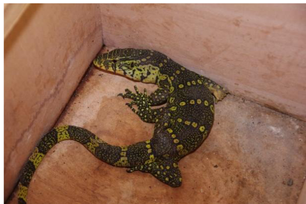
Fig. 12. Adult Varanus ornatus in Bakoumba, Haut-Ogooué Prov., southeastern Gabon.

Pearson et al. (2007) presented a picture of a monitor taken in Plateaux Batéké NP that they identified as “ Varanus sp. (probably V. niloticus ).” The photo shows a juvenile individual with five transversal rows of ocellae on the back between the fore and hindlimbs, as is typical for V. ornatus . A photograph of another individual from Plateaux Batéké NP was presented by Pauwels and Vande weghe (2008:127). On 25 March 2016 SM photographed an adult individual in Bakoumba (Fig. 12). On 22 October 2016 at midday SM photographed a subadult individual (total length about 70 cm) inside a dead tree standing above the surface of Lékédi Lake in Lékédi Park. New Dept. record and new record for the park (not listed from the Dept. by Pauwels et al. 2007, 2017d,e). Although heavily hunted, this monitor is still abundant in all parts of the country and in all kinds of environments, from pristine forests and savannas to urban areas; it was recorded from nearly all protected areas of Gabon (Pauwels, 2016). Dowell et al. (2015) did not fully resolve the systematics within the Varanus niloticus complex and called for “urgent taxonomic revisions in this group;” until more conclusive results are obtained, we prefer to maintain here the use of the name Varanus ornatus for the Varanus populations found in Gabon.