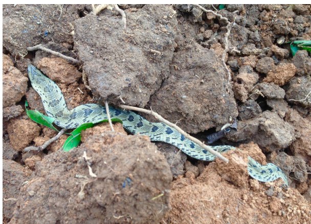
Fig. 32. Adult Causus maculatus in Moanda, Haut-Ogooué Prov., southeastern Gabon.