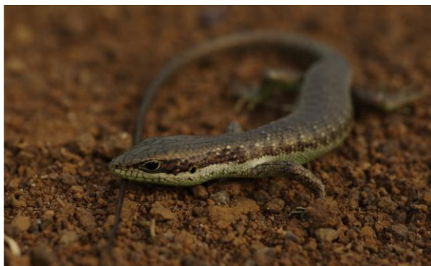
Fig. 11. Young Trachylepis polytropis polytropis in Lékédi Park, Haut-Ogooué Prov., southeastern Gabon.

The individual RBINS 18501 was encountered by SM on 4 January 2017 in Lékédi Park. It shows a transparent disk in each lower eyelid, 4/4 supraoculars, 5/5 supraciliaries; 6/6 supralabials; supranasals separated by a narrow gap, prefrontals separated by a narrow gap; 54 scales on a line between the nuchals and a point above the base of the tail; a snout-vent length of 71 mm, a tail length of 125 mm; and 30 scale rows at midbody, each dorsal scale with 5, sometimes 6 or 7, keels. RBINS 18502 was found by SM in the park on 19 August 2017. It shows a transparent disk in each lower eyelid, 4/4 supraoculars, 5/5 supraciliaries; 7/7 supralabials; supranasals separated, prefrontals in contact; 54 scales on a line between the nuchals and a point above the base of the tail; a snout-vent length of 64 mm, a tail length of 132 mm; and 30 scale rows at midbody; each dorsal scale with 5 keels. This species is locally common in open areas in the park, and was regularly observed by SM in 2016 and 2017. It had already been recorded and documented from the park by Ineich and Le Garff (2015).