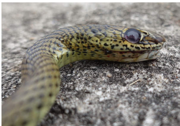
Fig. 27. Dead-on-road adult Psammophis cf. phillipsii in Franceville, Haut-Ogooué Prov., southeastern Gabon.

On 5 July 2017 JLA found a dead-on-road adult individual on the road to Amissa Hospital, at six km from the center of Franceville, Passa Dept. Its total length was about 105 cm (including the incomplete tail). A second individual was found dead-on-road in the same locality on 13 July 2017 (Fig. 27); its total length was about 110 cm. Both showed a round pupil, two internasals, two prefrontals, eight supralabials of which the 4 th and 5 th in contact with orbit, one large preocular, two postoculars, an elongate loreal, two anterior temporals, 17 smooth and oblique dorsal scale rows at midbody (vertebral row not widened), divided anal and subcaudals, and an olive brown dorsum with a black spot in the posterior part of each ventral; the dorsal surface of the head is olive brown with irregular black spots. On 11 August 2017 SM found a dead-on-road individual in Moanda, Lébombi-Léyou Dept. It showed the same head scalation features as the two specimens above, and the same coloration. New Prov. record (not recorded from the Prov. by Pauwels and Vande weghe 2008; Pauwels et al. 2016b, 2017a).