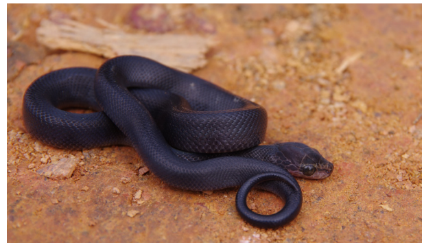
Fig. 26. Young Boaedon perisilvestris in Bakoumba, Haut-Ogooué Prov., southeastern Gabon.

was aggressive and bit when handled. It showed a vertical pupil, one preocular, in contact with the frontal, two postoculars, one loreal, eight supralabials with three (3 rd –5 th ) in contact with the orbit, one anterior temporal, 29 smooth dorsal scale rows at midbody, the vertebral row not widened, a single anal plate, divided subcaudals, two poorly contrasted stripes on each side of the head, and a uniform blackish dorsum without light stripes. An adult female individual showing the same head scalation characteristics, but no stripes on the sides of the head (as is typical for adults, according to Trape and Mediannikov 2016) was found on 26 December 2016 inside a dried well in Lékédi Park. It was resting near the six oblong, white eggs it had just laid. The adult female RBINS 18505 (see Appendix 1) was found by SM in Lékédi Park on 18 November 2016. It contains six large eggs, the largest with a length of 32 mm and a maximum width of 12 mm; its stomach contains the remains of a micromammal. The young individual RBINS 18482 (see Appendix 1) was found in Moanda, Lébombi-Léyou Dept. on 20 November 2016 at 7h00. Its temporal formula is 1+2+3 on each side. Another individual (RBINS 18506; see Appendix 1) was found by SM in Moanda on 5 November 2016; it also shows a temporal formula of 1+2+3 on each side. The adult female RMCA 29885 (see Appendix 1) was collected in “Munana, près de Moanda” [= Mounana near Moanda, in Lébombi-Léyou Dept.] in 1969–1970