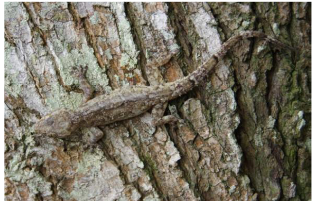
Fig. 8. Adult Hemidactylus mabouia in Léconi Park, Haut-Ogooué Prov., southeastern Gabon.