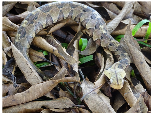
Fig. 31. Young Bitis gabonica in Lékédi Park, Haut-Ogooué Prov., southeastern Gabon.