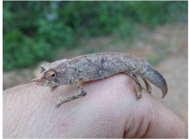
Fig. 7. Adult male Rhampholeon spectrum in Lemanassa, Haut-Ogooué Prov., southeastern Gabon.

listed from this Prov. by Pauwels and Vande weghe 2008; Pauwels et al. 2008). This village is located at about five km from the border with the Republic of Congo. Like the two chameleons above, this species has been evaluated as Least Concern by the IUCN (Mariaux and LeBreton 2010).