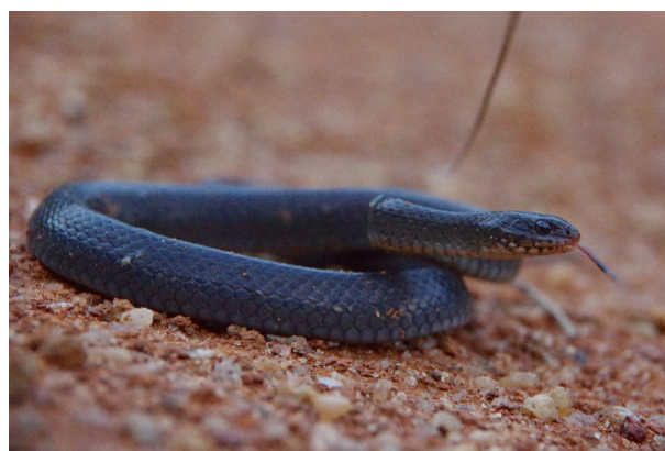
Fig. 28. Adult female Natriciteres olivacea (RBINS 18484) in Lékédi Park, Haut-Ogooué Prov., southeastern Gabon.

An adult female (RBINS 18484, see Appendix 1 and Fig. 28) was encountered by SM at midday on 10 October 2016 in Lékédi Park. It contains four large eggs between the ventrals 93 and 127, each of a length of about 17 mm. It shows a round pupil and a temporal formula of 1+2 on each side. In life the dorsum of this individual was nearly uniformly black, and the mediodorsal band that is characteristic of this species was nearly invisible. New record for the park and new Dept. record (not recorded from the Dept. by Pauwels and Vande weghe 2008; Pauwels et al. 2017a). In Gabon this snake is much less common than its congener Natriciteres fuliginoides (Günther, 1858) which was however not found during our survey; both were evaluated as Least Concern by the IUCN.