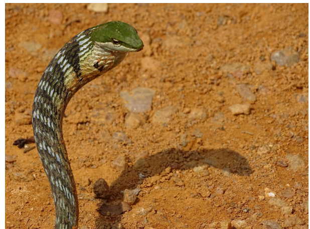
Fig. 21. Adult Thelotornis kirtlandii in defensive posture in Lékédi Park, Haut-Ogooué Prov., southeastern Gabon.

Fig. 21 shows an individual displaying the typical defensive posture, photographed on 27 June 2016 at 10h00 by SM in Lékédi Park. New record for the Dept. and for the park (not listed from the Dept. by Pauwels and Vande weghe 2008). The species was first recorded from Haut-Ogooué Prov. by Pauwels et al. (2007). This snake, which avoids primary forests and lives mostly in clearings and cultivated areas, is one of the most commonly encountered species in Gabon.