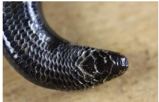
Fig. 10. Young Feylinia currori in Franceville, Haut-Ogooué Prov., southeastern Gabon.

On 10 April 2016 at 17h00 SM found an adult individual (RBINS 18473) active along a road in Lékédi Park. It has a snout-vent length of 156 mm, a tail length of 60 mm, 25 scale rows at midbody, two supranasal scales, one loreal on each side separating the supranasal from the preocular; on each side the ocular scale is in contact with the 3 rd supralabial. Another adult individual (RBINS 18474) was found at 17h00 by SM on 11 October 2016 in a natural ditch in the park; it was then active and quickly moved in the soft soil to hide under a rock. It had a snout-vent length of 164 mm, a tail length of 67 mm, two supranasal scales, 26 scale rows at midbody; its ocular scale is in contact with the 3 rd supralabial. A third individual (RBINS 18498) was found in the park by SM on 7 July 2017 at 17h30; it has a snout-vent length of 128 mm, a tail length of 49 mm, 26 scale rows at midbody, two supranasal scales, and on each side the ocular scale is in contact with the 3 rd supralabial. On 14 November 2017 Jean-Louis Albert (~JLA) found a young individual (total length 120 mm), freshly dead-on-road in Franceville in Passa Dept. (Fig. 10). New record for the park and new Prov. record; Haut-Ogooué Province was the last Gabonese province from which this common species had not yet been recorded (see distribution given by Pauwels and Vandeweghe 2008).