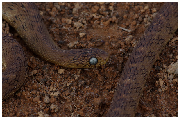
Fig. 16. Adult Dasypeltis fasciata in Bakoumba, Haut-Ogooué Prov., southeastern Gabon.

The adult specimen RMCA 29891 (see Appendix 1) was collected by M. Gauduin in 1969–1970 in “Munana, près de Moanda” [= Mounana near Moanda, in Lébombi-Léyou Dept.]. SM encountered an adult individual in Bakoumba at 20h00 on 12 February 2017 (RBINS 18477; Appendix 1; Fig. 16). Contrary to the Dasypeltis confusa individual above, it was very calm when approached and handled. Its poorly defined black dorsal bands are due to the black color of the interstitial skin between scales, which allows to easily distinguish this species from Dasypeltis confusa which shows black scales forming well-defined saddle-shaped marks on the dorsum, like in the individual shown on Fig. 15. Another individual was found by NR while it was being preyed upon by a Naja melanoleuca on the compounds of the CIRMF in Franceville, Passa Dept., on 25 December 2014 (Fig. 24). First records for the Prov. (not listed from the Prov. by Pauwels and Vande weghe 2008; Carlino and Pauwels 2015; Pauwels et al. 2016a). This species was evaluated as Least Concern by the IUCN; the former species was not yet evaluated.