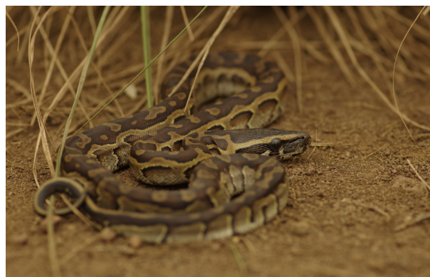
Fig. 29. Juvenile Python sebae in Lékédi Park, Haut-Ogooué Prov., southeastern Gabon.

The record of the species from Plateaux Batéké NP by Christy et al. (2008) was based on a pers. comm. to OSGP by Gaël Vande weghe who observed an individual along Mpassa River in the NP in April 2007, and on a picture of a large adult individual shown in Pearson et al. (2007). On 15 January 2018 at 13h00 SM discovered a juvenile in Lékédi Park (Fig. 29). We examined pho-