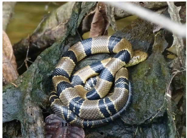
Fig. 23. Naja annulata annulata in Lékédi Lake, Haut-Ogooué Prov., southeastern Gabon.

An individual of this freshwater cobra was photographed by SM on the shore of Lékédi Lake in Lékédi Park (Fig. 23). It quickly escaped to the water after having been photographed. New record for the park and for the Dept. (this cobra species was not listed from the Dept. by Pauwels and Vande weghe 2008; Pauwels et al. 2017a).