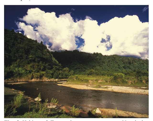
Fig. 3 Habitat of Trimerodytes percarinatus at Namdapha, India.