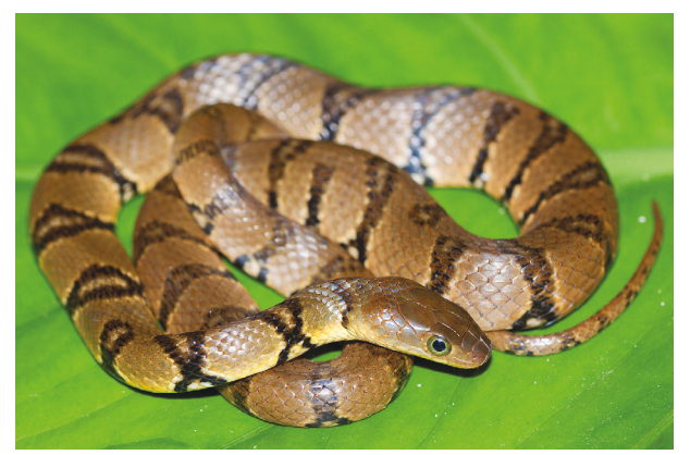
Fig. 1 Full body picture of Trimerodytes percarinatus from Namdapha, India.