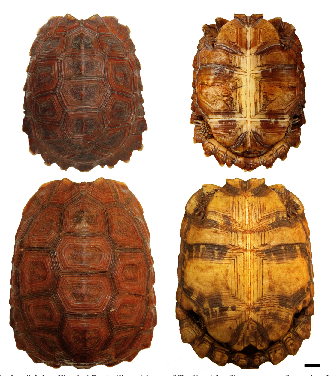
Fig. 4 . Top: Juvenile Lobatse Hinge-back Tortoise ( Kinixys lobatsiana , SCL = 81 mm) from Sigurwana, western Soutpansberg, Limpopo. Bottom: Young Speke's Hinge-back Tortoise ( K. spekii , SCL = 106 mm) from Leshiba Wilderness, western Soutpansberg. Scale bar: 1 cm. Species identification of both tortoises was genetically confirmed.

(Ihlow et al. 2019). However, this character does not always suffice in juveniles (Fig. 4). To enable later re-examination, photographs should document the dorsal, ventral, and lateral aspects of each tortoise. In addition, molecular genetic confirmation is recommended.