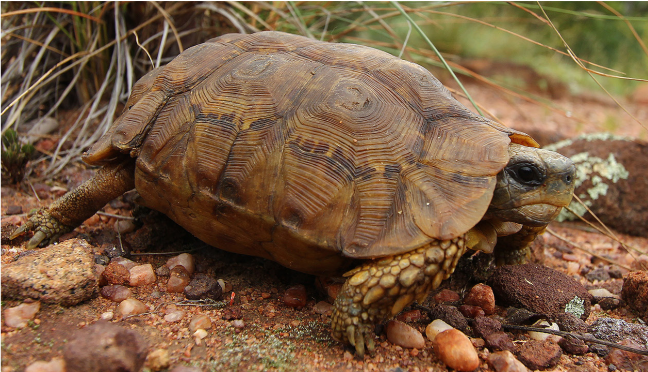
Fig. 5. Speke's Hinge-back Tortoise ( Kinixys spekii ) from the vicinity of Vaalwater (left) and Lobatse Hinge-back Tortoise ( K. lobatsiana ) from the Lapalala Wilderness Reserve (right) with very similar color patterns. Species identification of both tortoises was genetically confirmed.

photographs of hinge-back tortoises from this reserve in any of the databases that were queried. Branch et al. (1995) further highlighted the Marakele National Park (former Kransberg National Park) and the Blyde River Canyon Nature Reserve as important statutory protected areas where the species has been recorded. However, we are not aware of any contemporary records from either of these reserves. In addition to these published localities, the occurrence of K. lobatsiana from the following sites was confirmed: