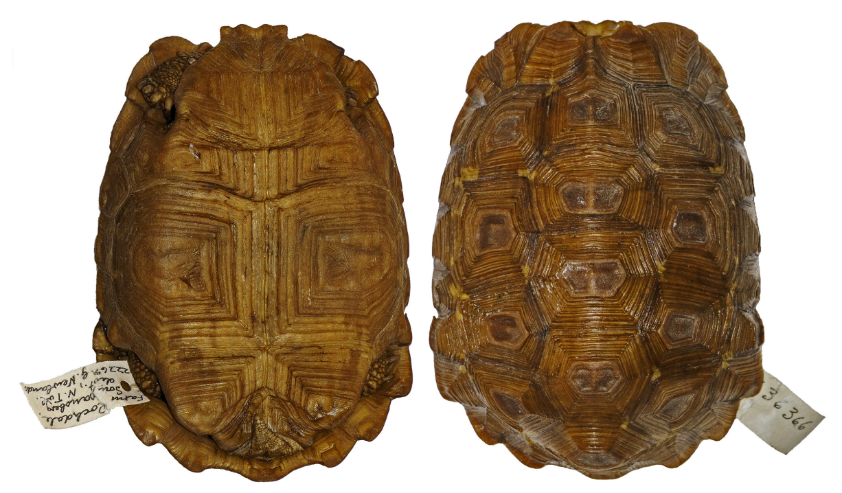
Fig. 3 . Lobatse Hinge-back Tortoise ( Kinixys lobatsiana , TM 36366) collected at Rochdale Farm, Waterpoort, from the Ditsong National Museum of Natural History.

2017). This record likely corresponds to a museum specimen housed at the Ditsong National Museum of Natural History (TM 36366) collected in 1964 by G. Newlands on Rochdale Farm, Waterpoort. Rochdale Farm lies on the northern slope of the Soutpansberg, just east of Waterpoort. A morphological examination of TM 36366 confirms that it represents K. lobatsiana (Fig. 3). Broadley (1993) suggested that this specimen might have been "swept through the gorge by the Sand River during a flood" to reach its collection site, while Boycott (2014) added translocation by humans as another possible explanation. Considering that K. lobatsiana is confirmed from two other properties on the northern slope of the Soutpansberg Mountains, 22 km away from the collection site of TM 36366, that record no longer appears to be an outlier. The present evidence rather suggests a continuous distribution of K. lobatsiana along the northern slope of the western Soutpansberg.