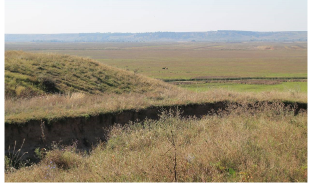
Fig. 3. Dolichophis caspius habitat in Jiu meadow, Romania.

The high number of D. caspius records is not necessarily an indicator of favorable conditions, but