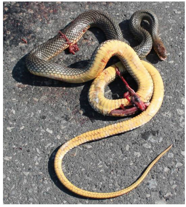
Fig. 2. Road killed Dolichophis caspius individual from Lişteva, Dolj County, Romania.

Dolichophis caspius individuals were recorded from 55 distribution localities in southern Romania (Table 1), most of which (52) were new distribution records (Fig. 1). The majority of the new distribution records are located in the western part of southern Romania, in the historical region of Oltenia, in Mehedinți and Dolj counties. Overall, 73 individual D. caspius snakes were identified. Five of the whipsnakes were encountered alive, while the others were found killed either by humans (two individuals), or by cars on the roads (Fig. 2). Juveniles and adults of up